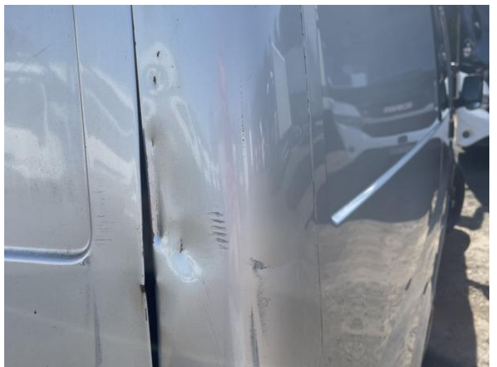
8: D Post os Dented With Paint Damage