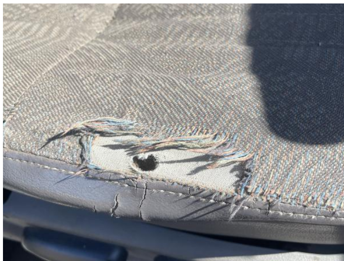
2: Seat Base Cover osf Torn Over 3mm