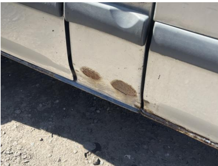
13: B Post ns Rusted Over 5mm