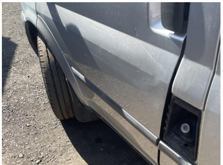
14: Door nsf Dented Over 30mm