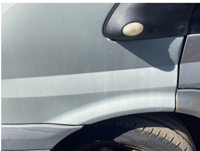
17: Wing nsf Poor Previous Repair Poor Paint