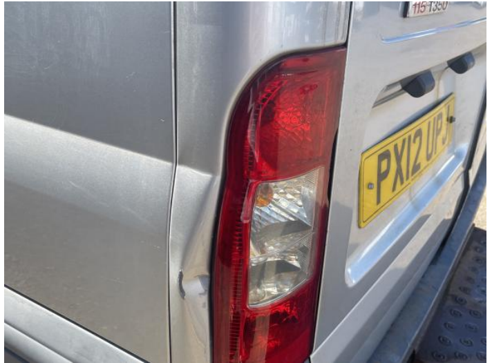
10: D Post ns Dented With Paint Damage