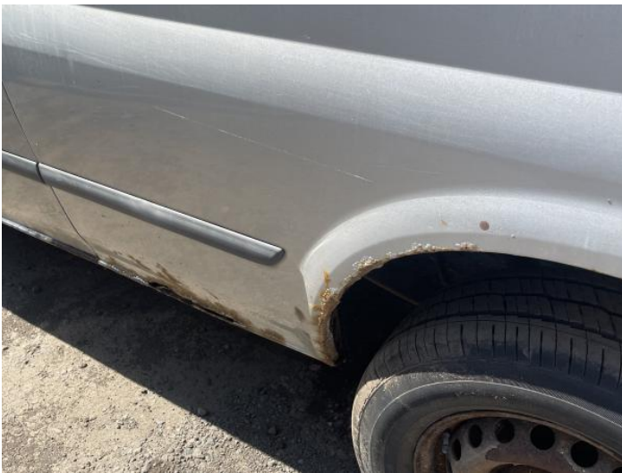
11: Qtr Panel nsr Hole UpTo 10mm