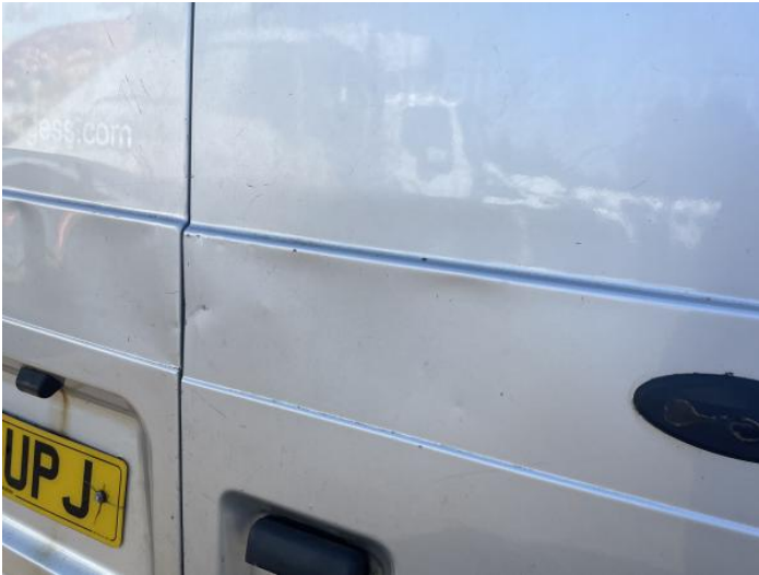
9: Tailgate Dented With Paint Damage