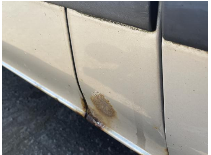
6: B Post os Rusted Over 5mm