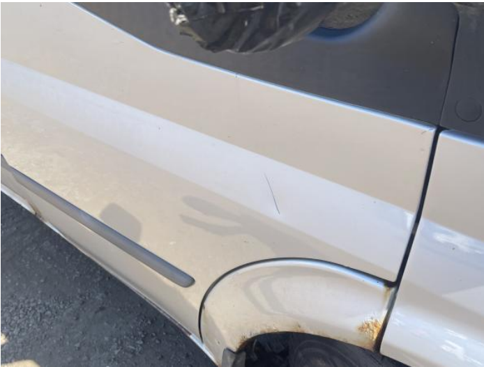
5: Door osf Rusted Over 5mm