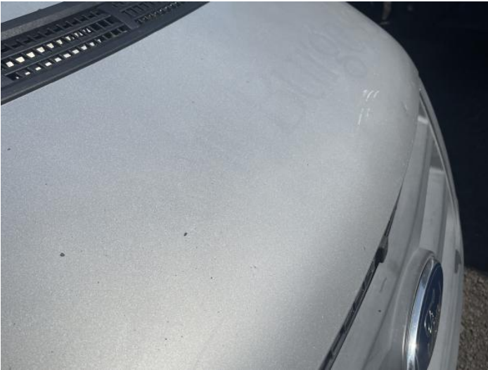
3: Bonnet Dented With Paint Damage