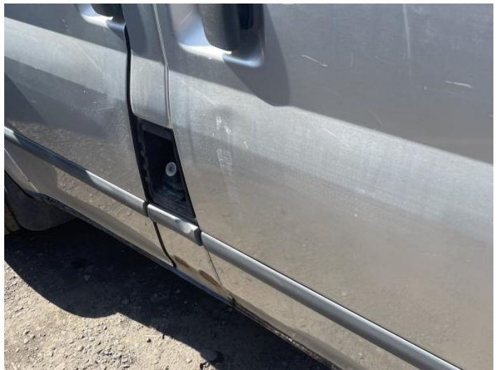
12: Door nsr Dented With Paint Damage