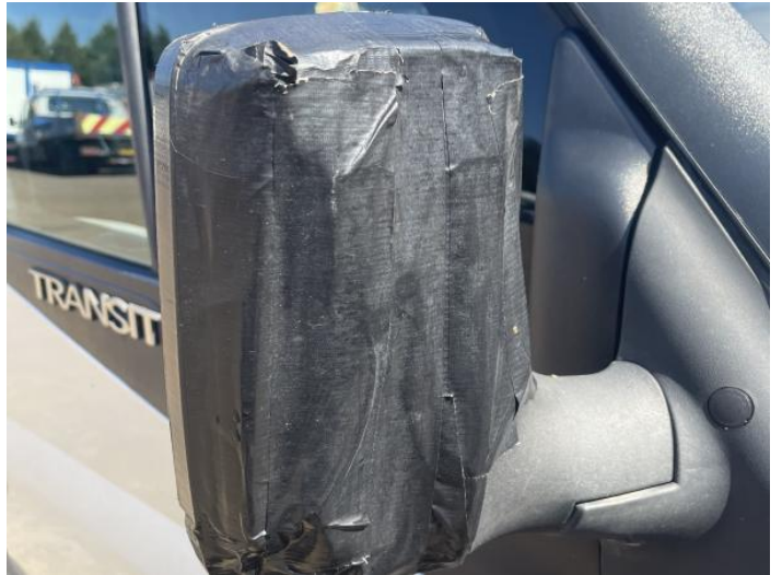
4: Door Mirror Assy osf Broken Replace