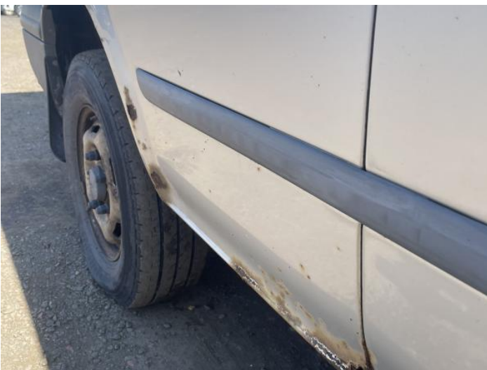
7: Qtr Panel osr Hole UpTo 10mm