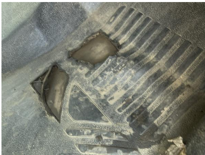
1: Carpets Front Torn Over 10mm