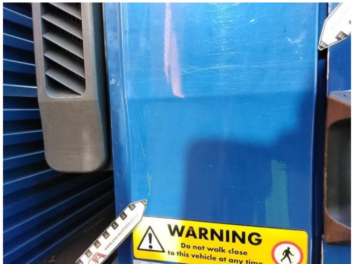
6: B Post os Scratched Over 25mm Thru Paint