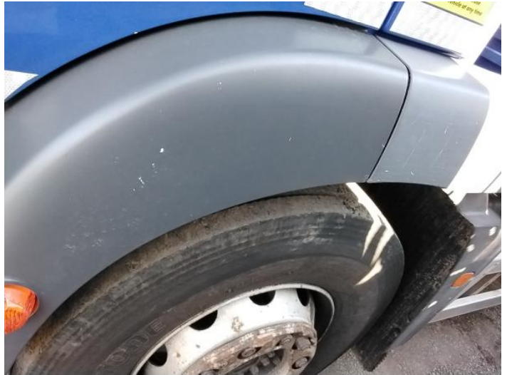
4: Wing nsf Chipped Multiple Chips