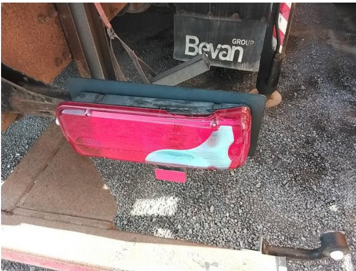
5: Lamp osr Broken Replace