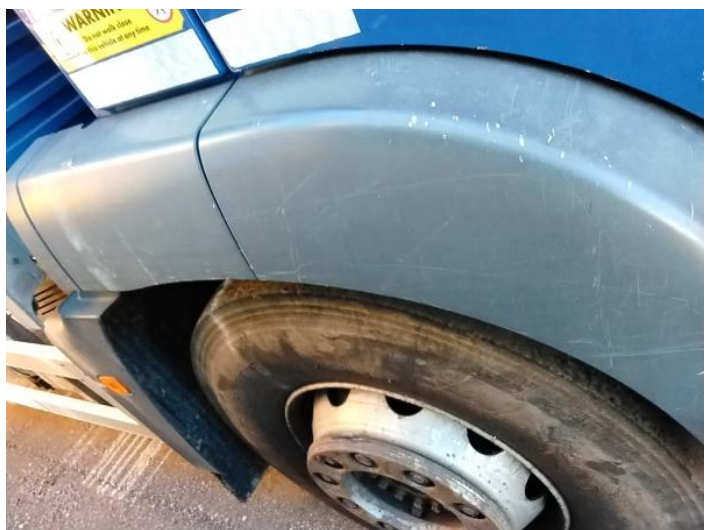
8: Wing osf Chipped Multiple Chips