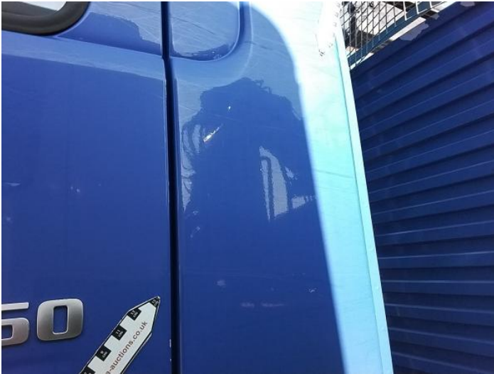
3: B Post ns Scratched Over 25mm Not Thru Paint