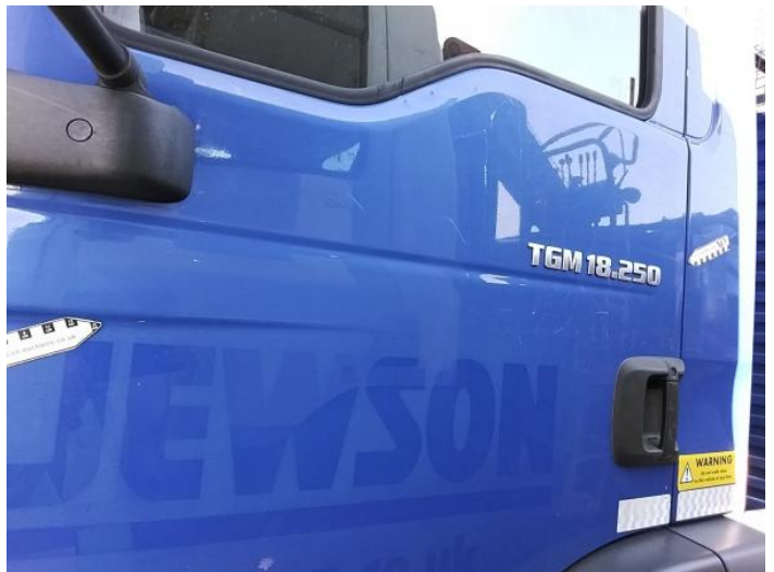
2: Door nsf Scratched Over 25mm Thru Paint