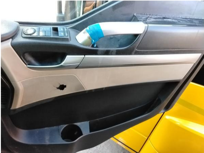
10: Door Pad osf Broken Replace