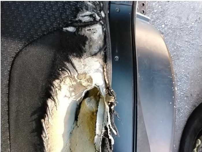
11: Seat Base Cover osf Holed Over 3mm