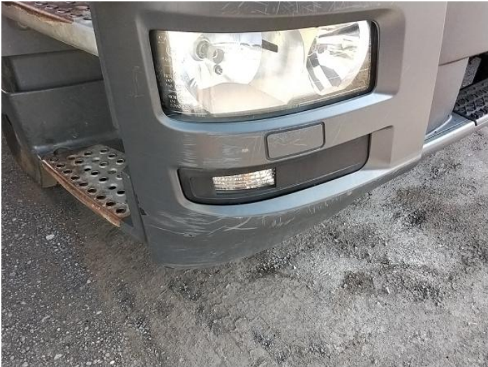
9: Bumper Front Scratched Over 100mm Thru Paint