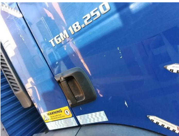
7: Door osf Scratched Over 25mm Thru Paint