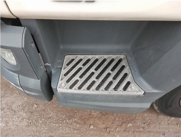
3: Wing nsf Cracked Replace