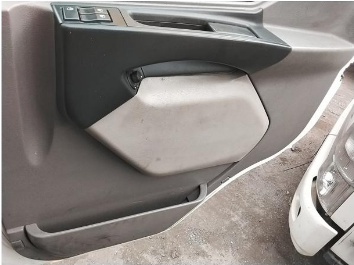
10: Door Pad osf Soiled Heavy