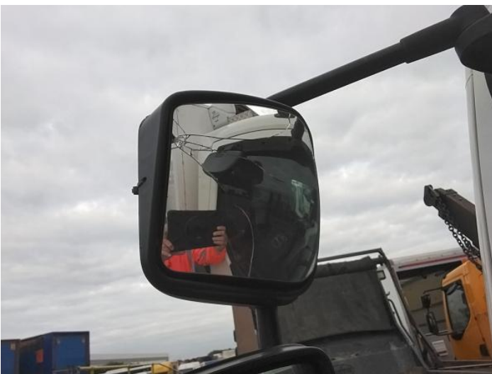
7: Door Mirror Glass ns Broken Replace