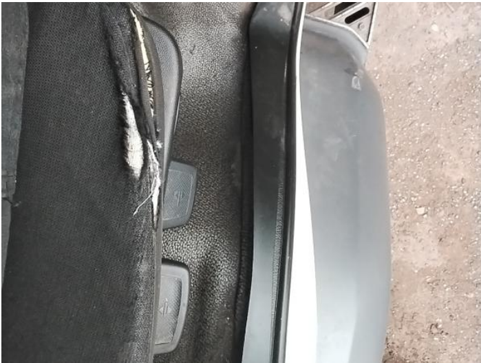
11: Seat Base Cover osf Torn Over 3mm