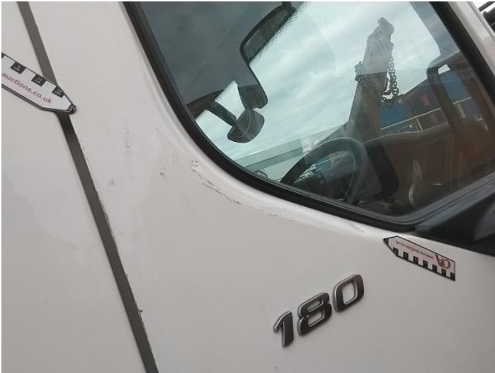
9: Door osf Dented With Paint Damage