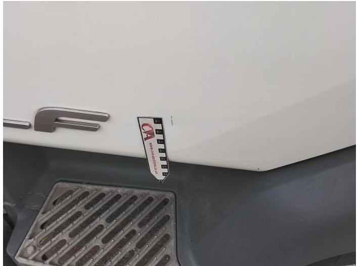
4: Door nsf Dented With Paint Damage