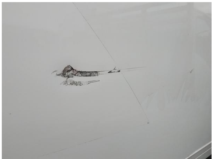
8: Qtr Panel osr Cracked Replace