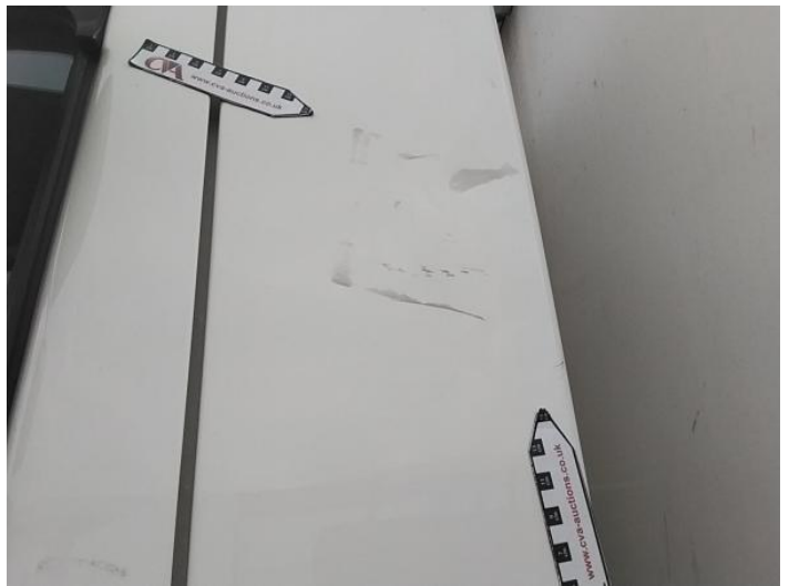
6: Qtr Panel nsr Scratched Over 25mm Thru Paint