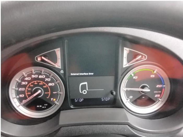
12: Dash Warning Lights Displayed No Action