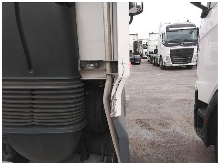
8: Qtr Panel Trim os Broken Replace