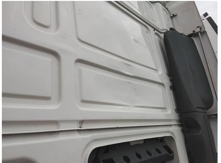
6: Panel Rear Dented With Paint Damage