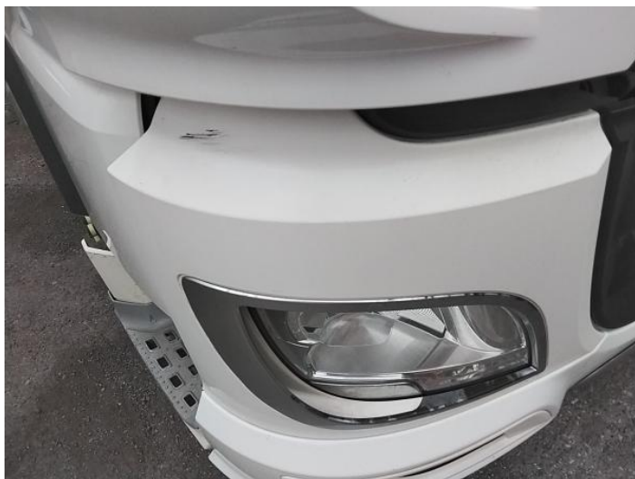
1: Panel Front Scratched Over 25mm Thru Paint