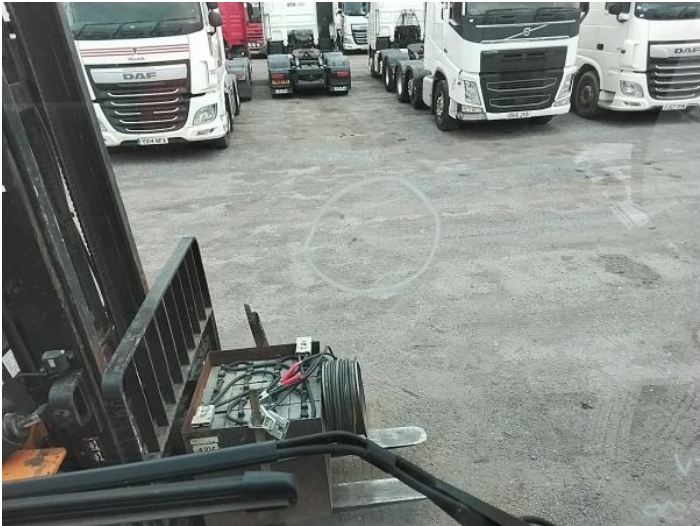
9: Screen Front Chipped UpTo 10mm