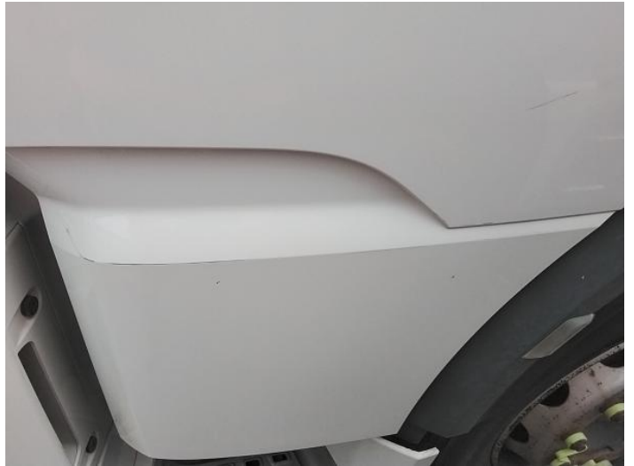
4: Door Moulding nsf Scratched (Painted) Over 25mm Thru Paint