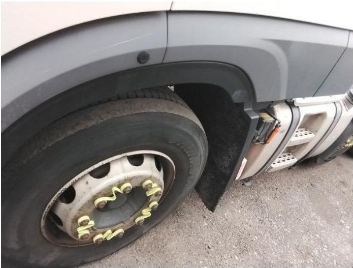
5: Wing nsf Scratched Over 25mm Thru Paint