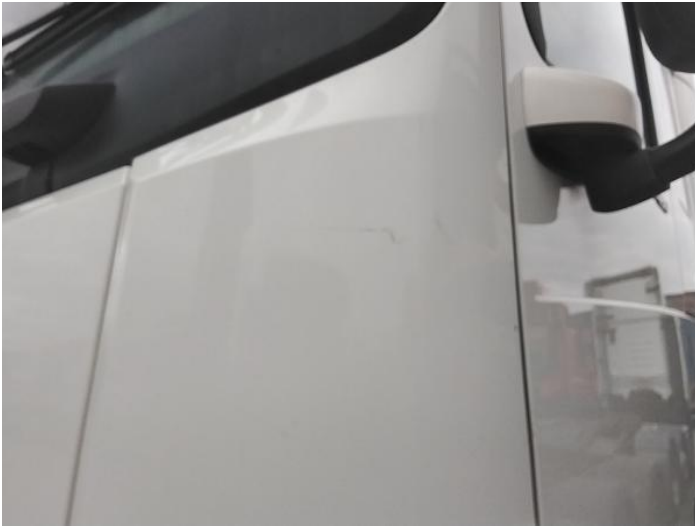
3: Panel Front Scratched Over 25mm Thru Paint