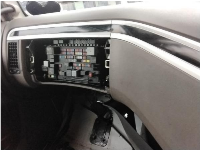
11: Fascia Panel Missing Replace