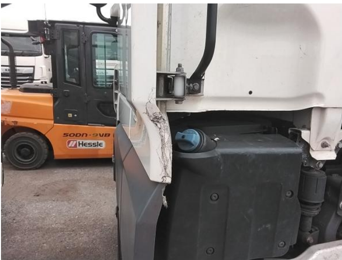
7: Qtr Panel Trim ns Broken Replace