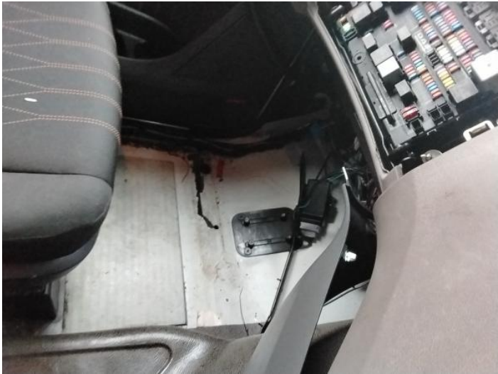
10: Carpets Front Missing Replace