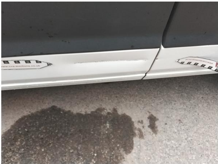
3: Qtr Panel nsr Dented With Paint Damage