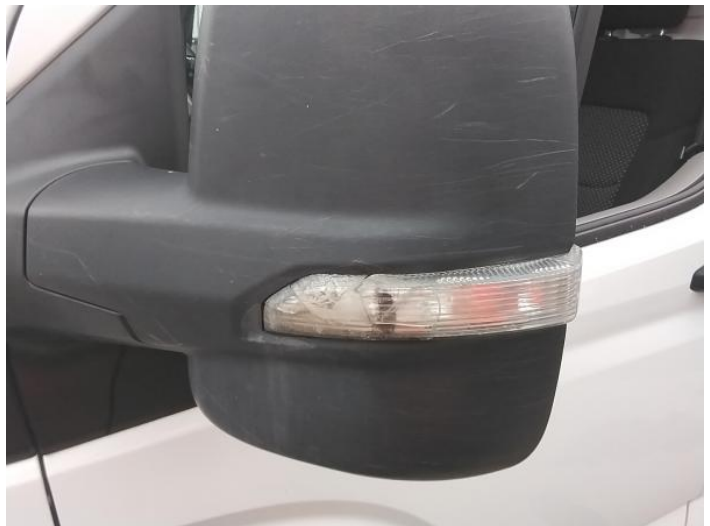
2: Door Mirror Assy nsf Broken Replace