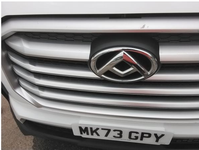
1: Panel Front Chipped Multiple Chips