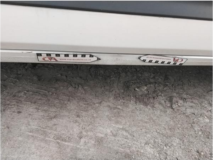
4: Sill ns Dented Over 30mm