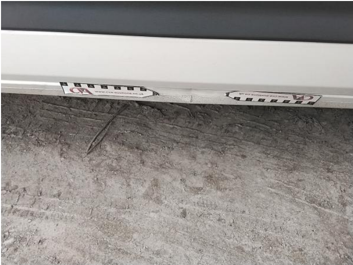
3: Sill ns Dented With Paint Damage