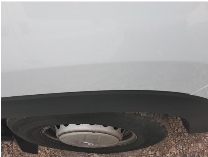
1: Wing of Scratched Over 25mm Not Thru Paint