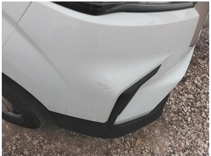
2: Bumper Front Scratched 25 to 100mm Thru Paint