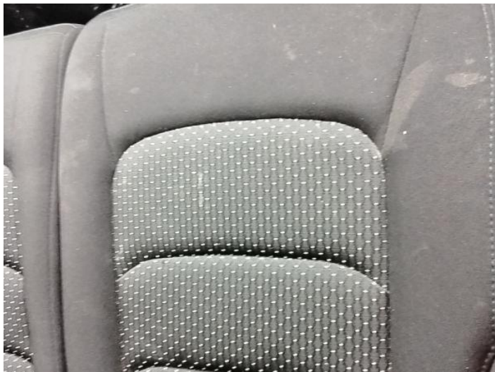
1: Seat Base Cover nsf Soiled Heavy