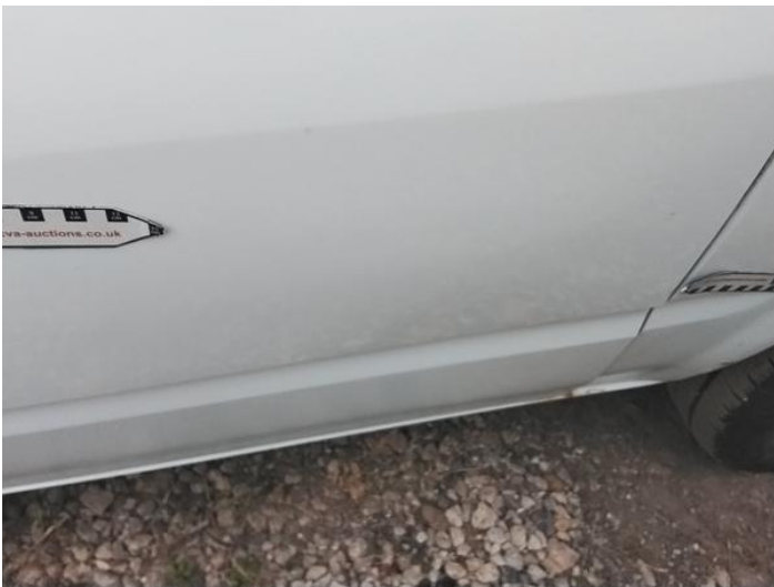
5: Qtr Panel nsr Poor Previous Repair Rippled UpTo 30%