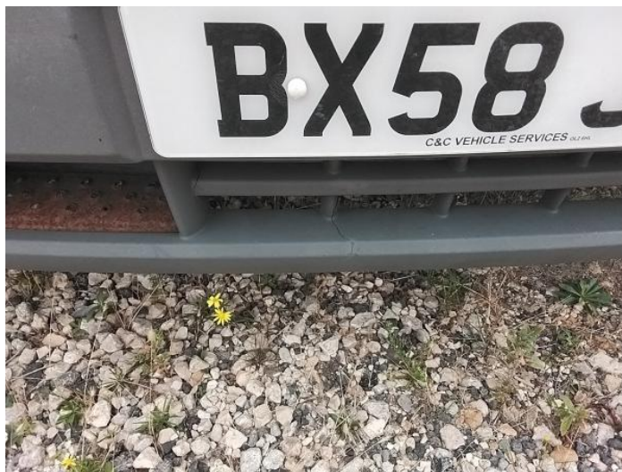
2: Bumper Front Cracked Over 25mm