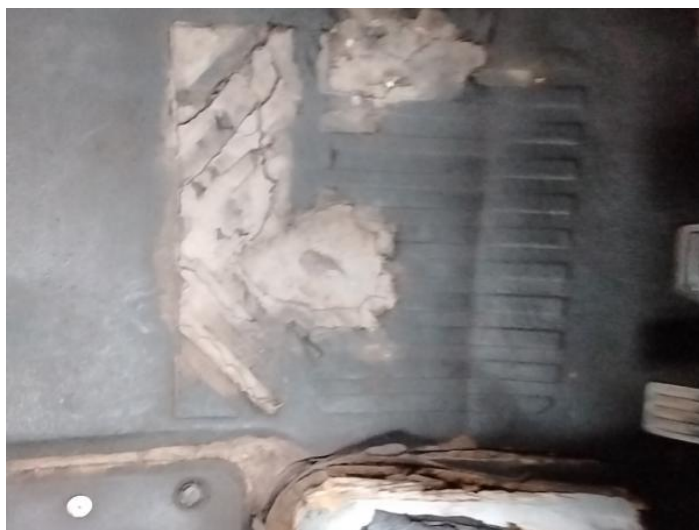
12: Carpets Front Holed Over 3mm