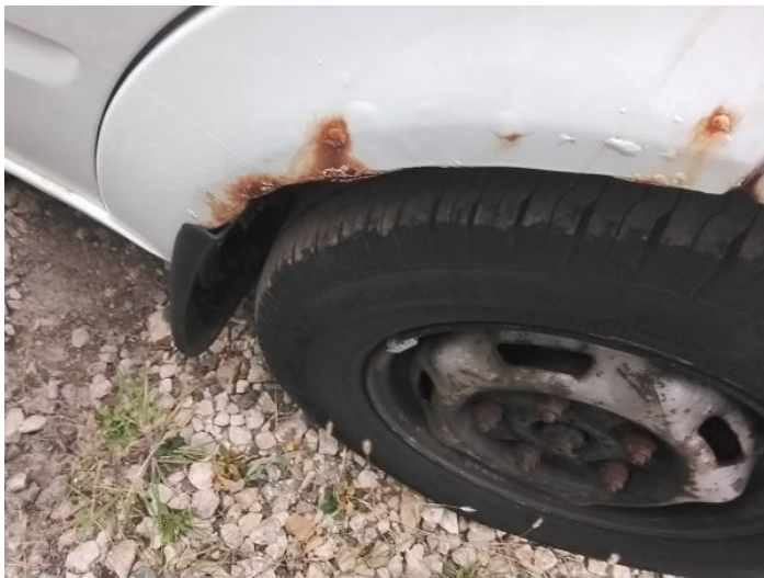
9: Wing osf Rusted Over 5mm