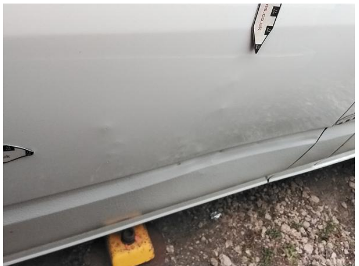
8: Qtr Panel osr Dented Over 30mm