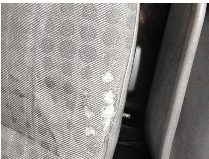
13: Seat Base Cover osf Torn Over 3mm