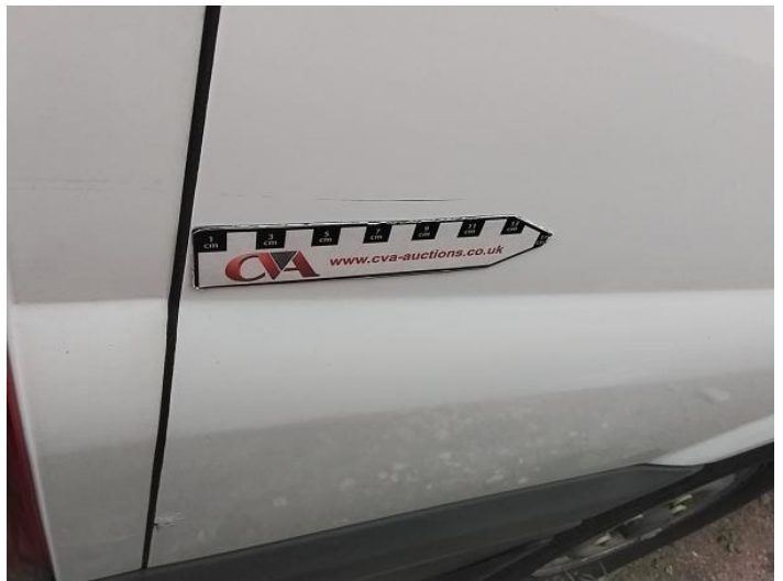
6: Qtr Panel osr Scratched Over 25mm Thru Paint