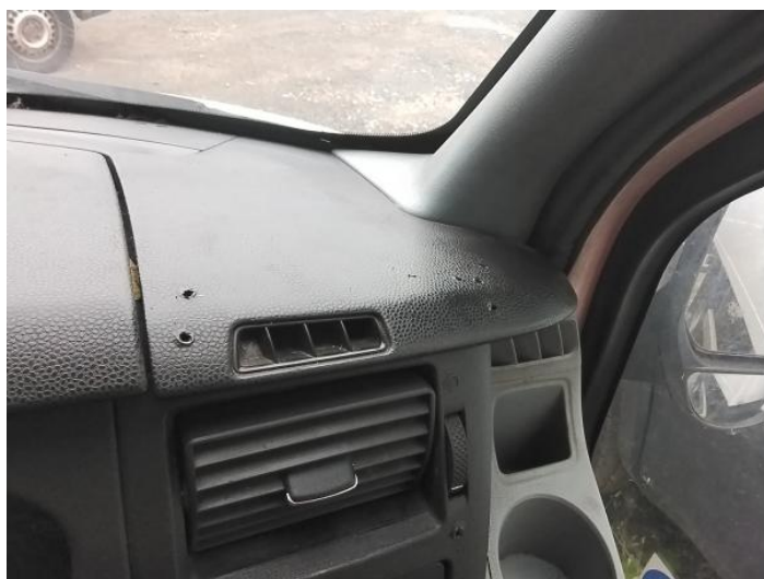
14: Fascia Panel Holed Over 3mm