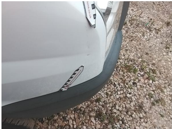
10: Wing osf Dented Over 30mm