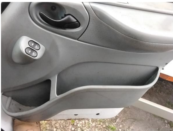
11: Door Pad osf Scuffed Over 25mm