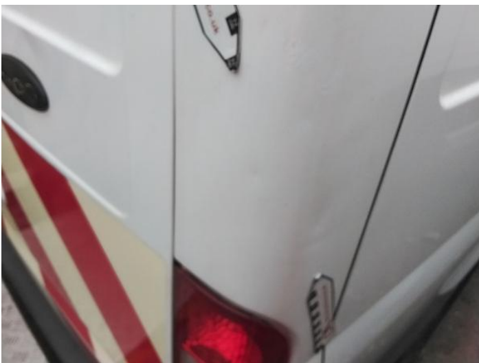
7: C Post os Dented Over 30mm