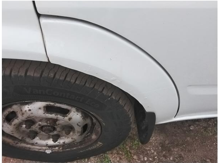
4: Wing nsf Rusted Over 5mm