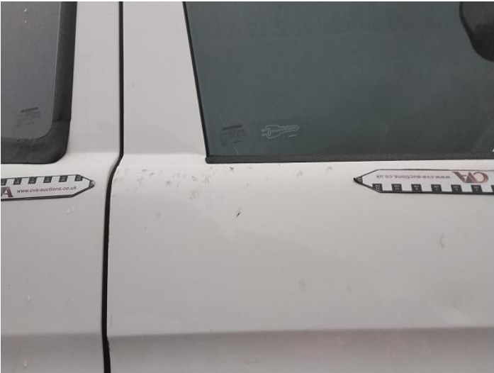
4: Door osf Scratched Over 25mm Thru Paint