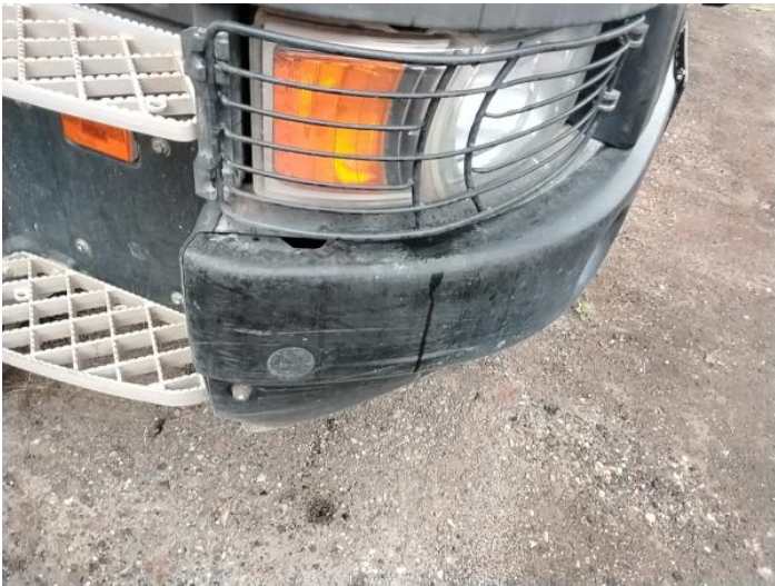
5: Bumper Front Scratched Over 100mm Thru Paint