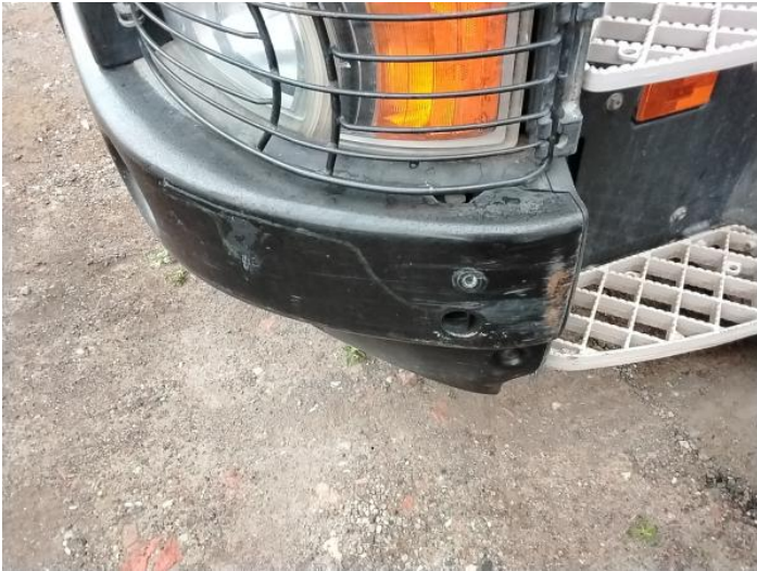
3: Bumper Front Scratched Over 100mm Thru Paint