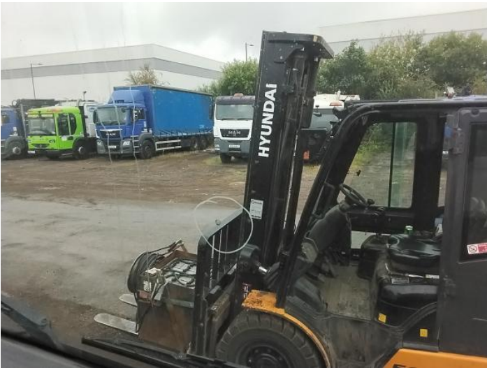
6: Screen Front Cracked Replace