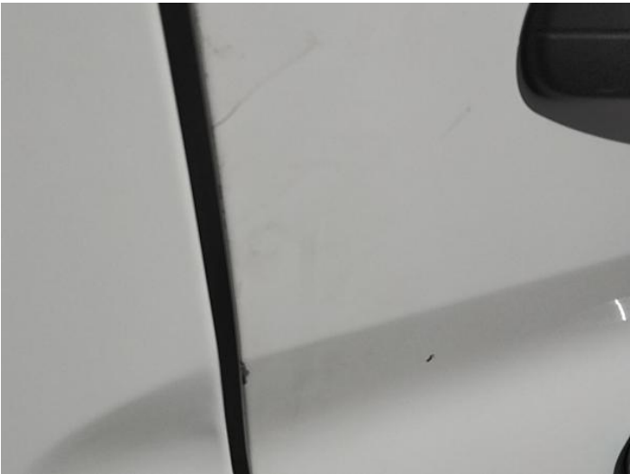
1: Door osf Chipped Edge Chip