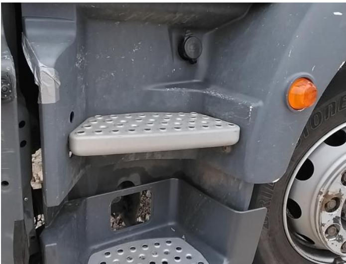
5: Other N/A N/A