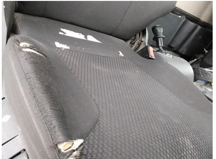
12: Seat Base Cover osf Holed Over 3mm