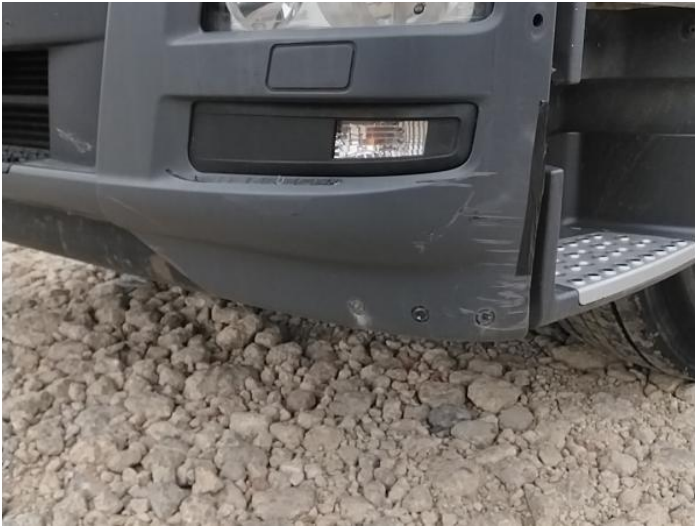
3: Bumper Front Moulding Scuffed (Unpainted) UpTo 100mm