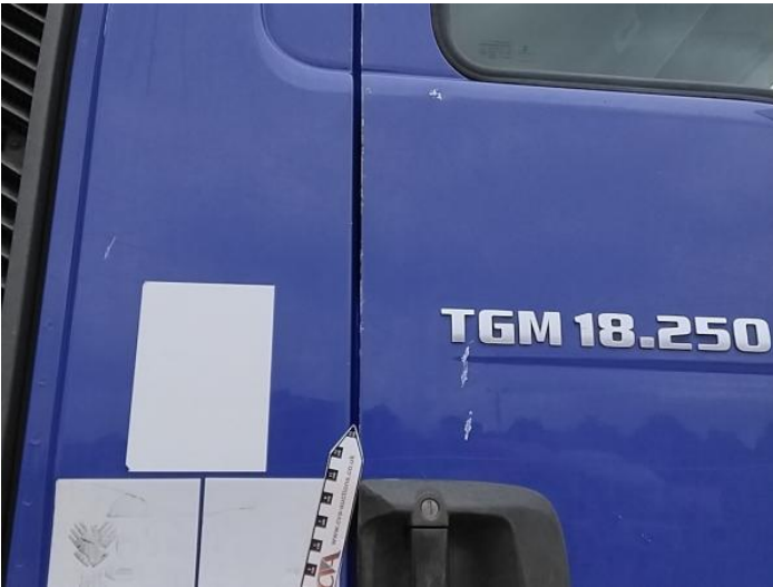
11: Door osf Chipped Edge Chip