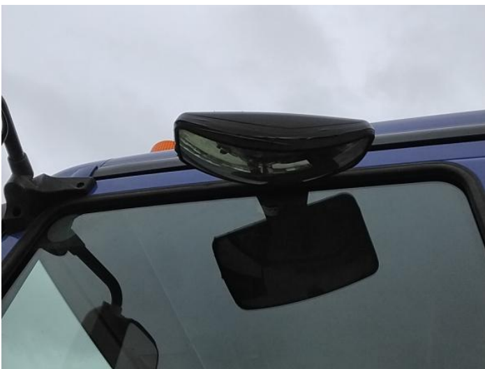
7: Door Mirror Assy nsf Broken Replace