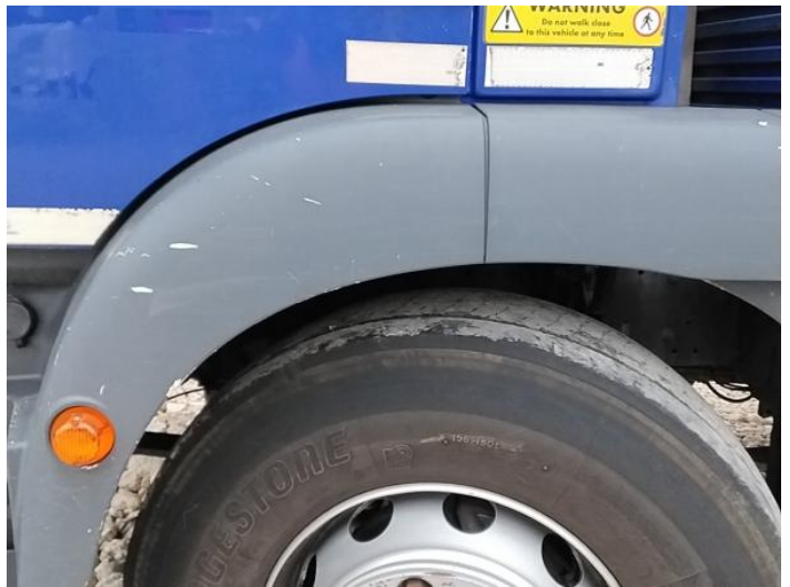
6: Other N/A N/A