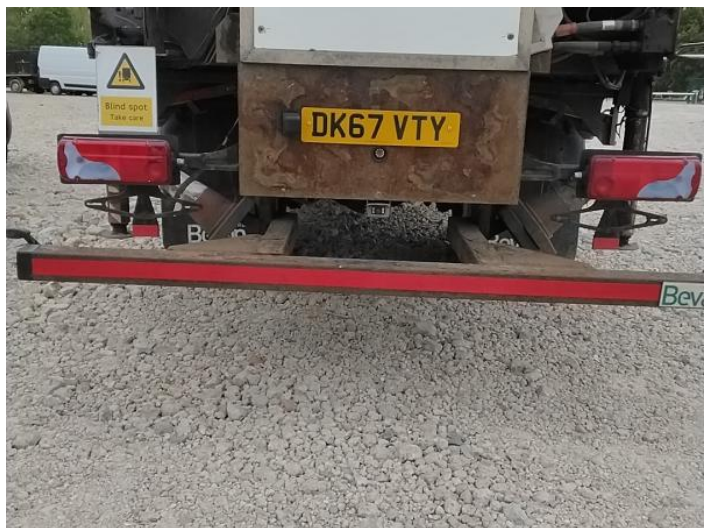
8: Bumper Rear Rusted Over 5mm