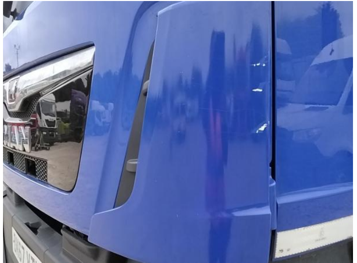
4: Wing nsf Scratched UpTo 25mm Thru Paint