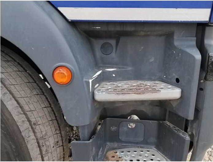
9: Other N/A N/A