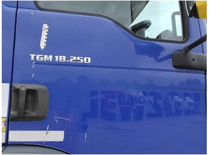
10: Door osf Scratched UpTo 25mm Thru Paint