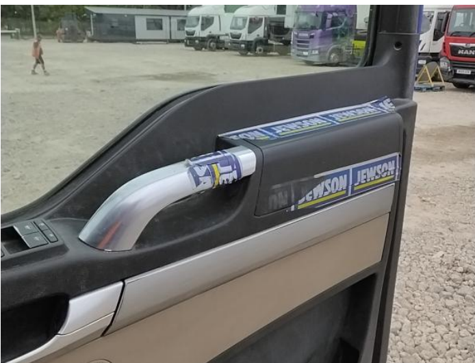
13: Door Pad osf Broken Replace