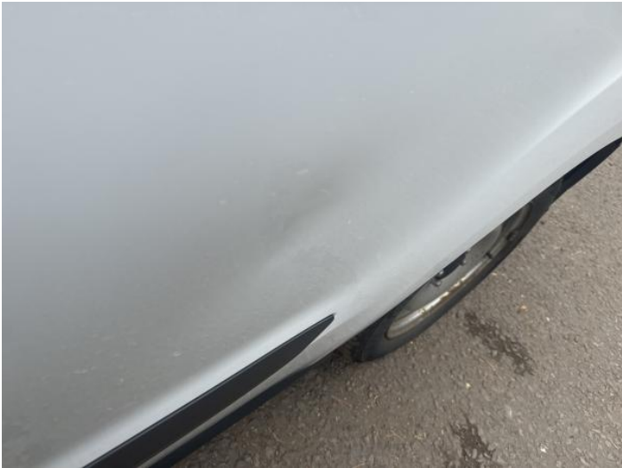
3: Qtr Panel nsr Hole Over 10mm