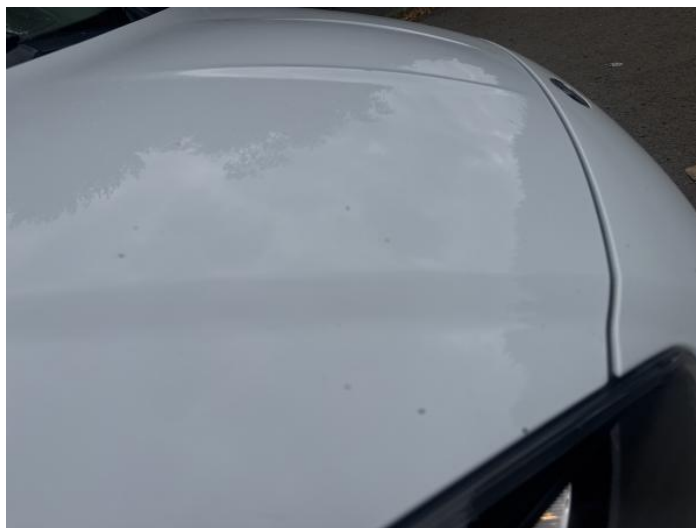
2: Bonnet Chipped Multiple Chips