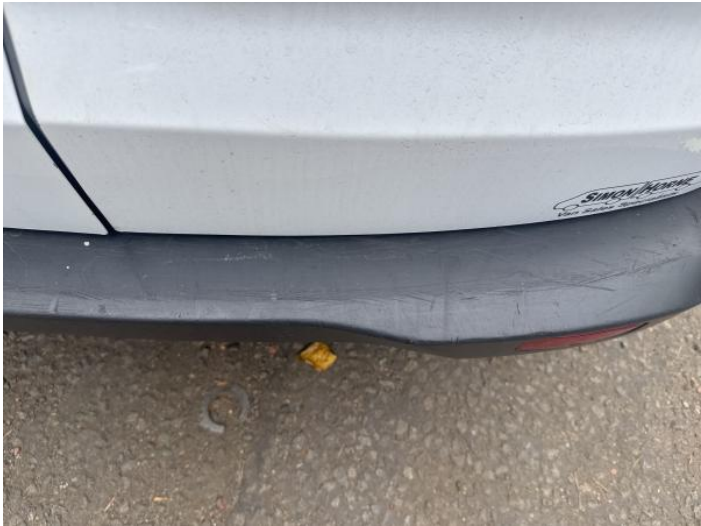
4: Bumper Rear Moulding Scuffed (Unpainted) Over 100mm

Carpet Condition Average Seat Condition OK