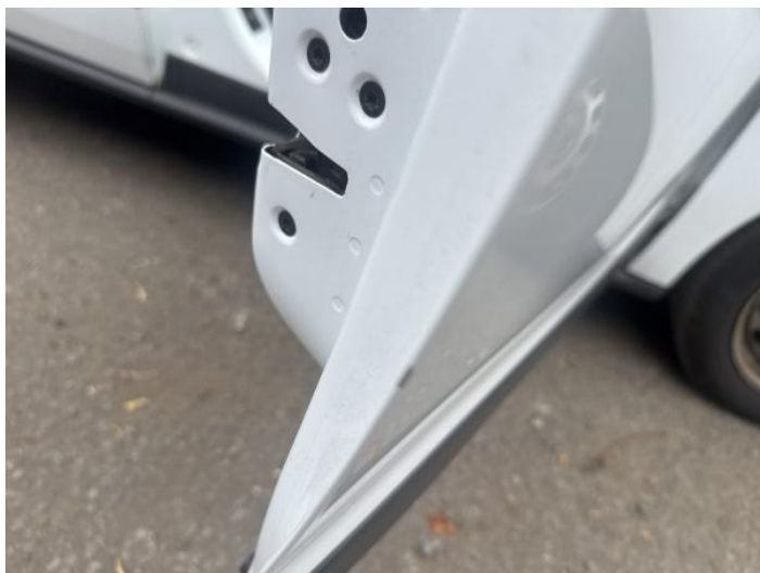
1: Door osf Chipped Edge Chip