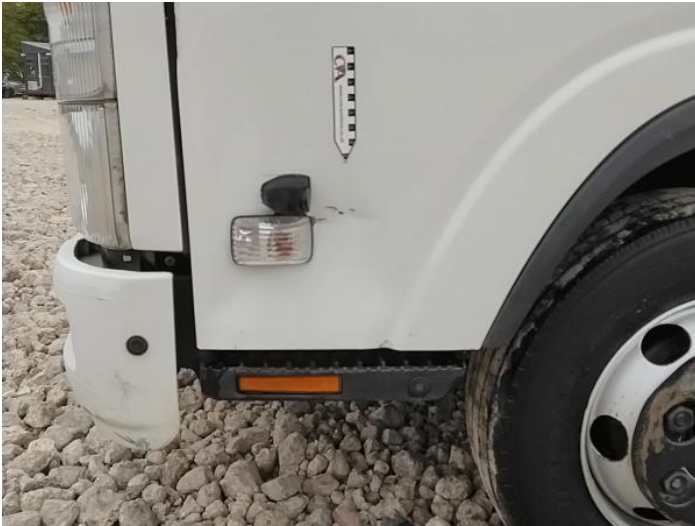
3: Door nsf Dented With Paint Damage