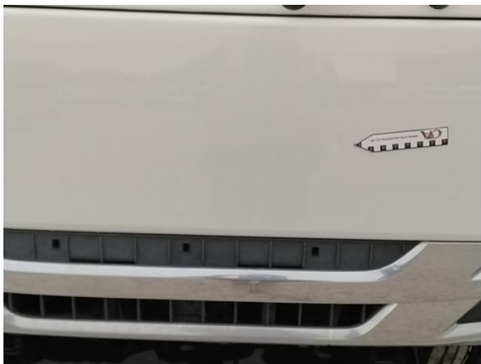
1: Bonnet Dented 2 Or Less UpTo 10mm