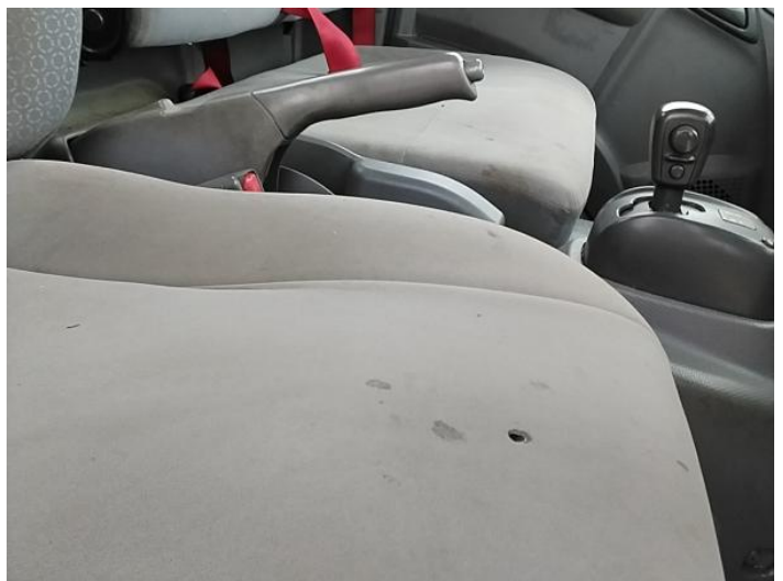
8: Seat Base Cover osf Burn Over 3mm