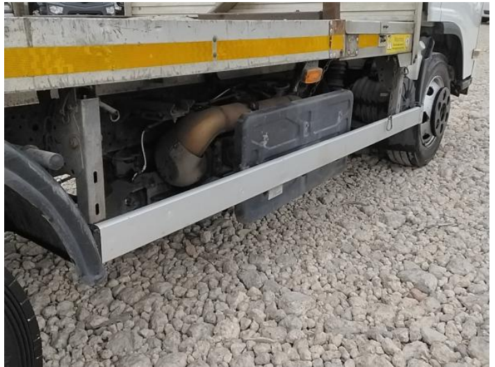
6: Other N/A N/A