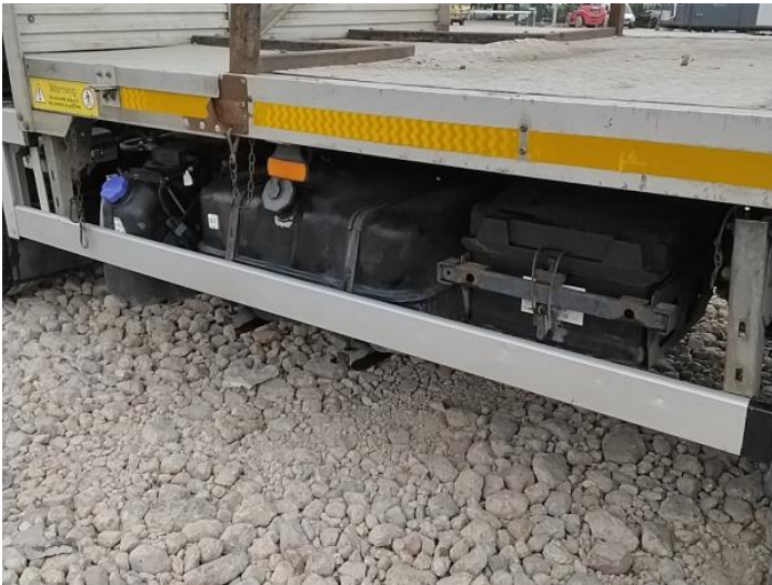
5: Other N/A N/A