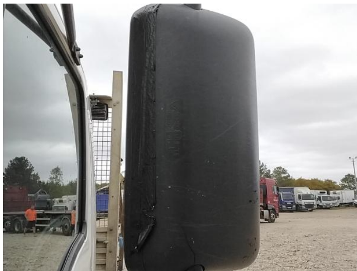
2: Door Mirror Assy nsf Broken Replace