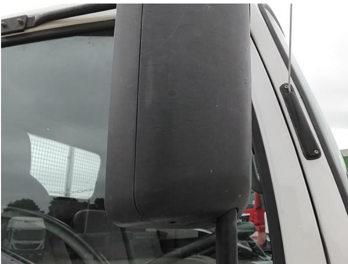
7: Door Mirror Assy osf Scuffed (Unpainted) UpTo 100mm