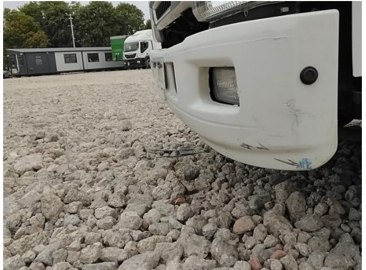
4: Bumper Front Moulding Scuffed (Unpainted) UpTo 100mm