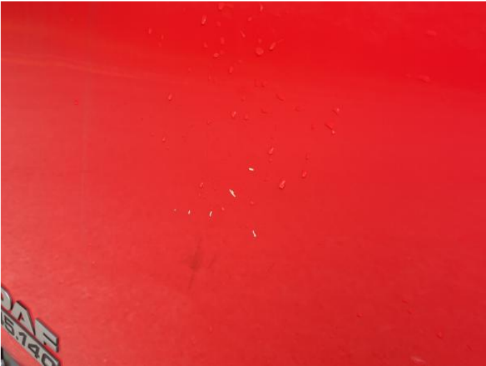
10: Door nsf Chipped Over 5mm