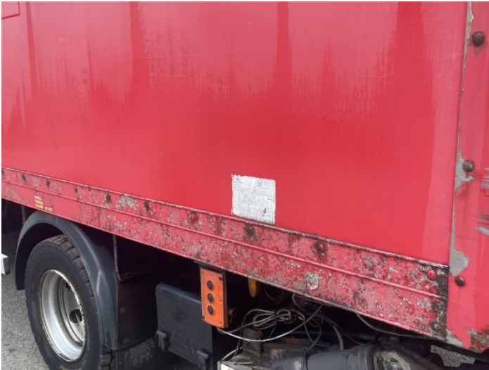
9: Qtr Panel nsr Dented With Paint Damage