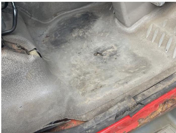
1: Carpets Front Torn Over 10mm