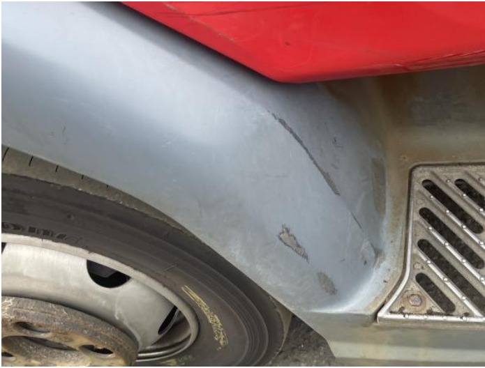
3: Door Moulding osf Scuffed (Unpainted) Over 100mm