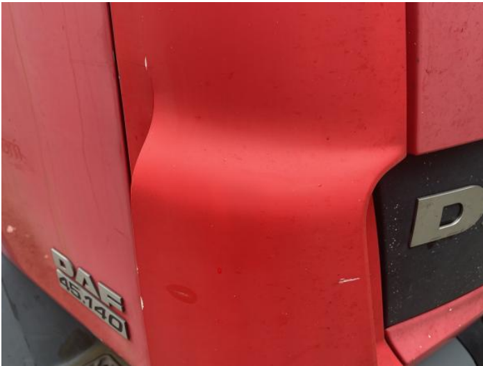
5: Wing osf Chipped Multiple Chips