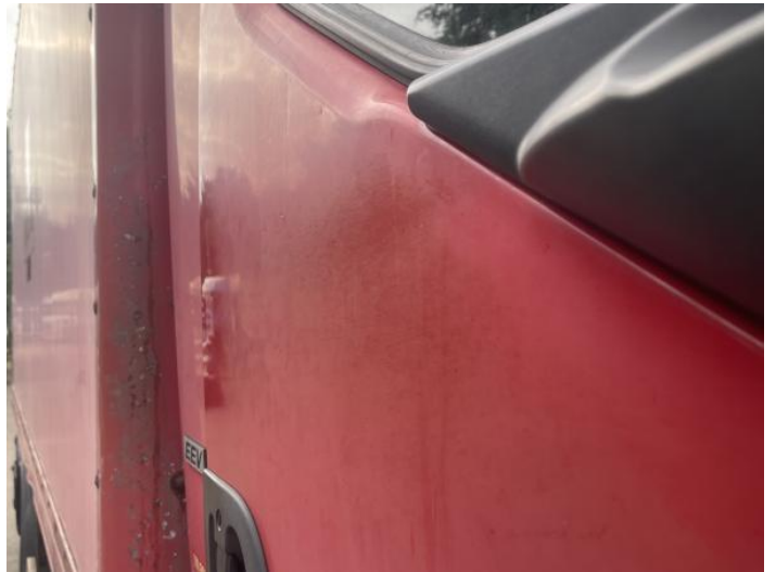
6: Door osf Dented Over 30mm