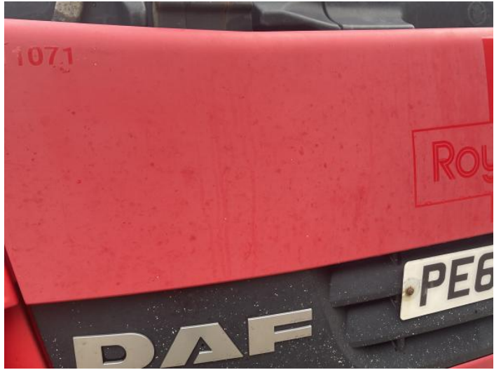
4: Bonnet Chipped Multiple Chips