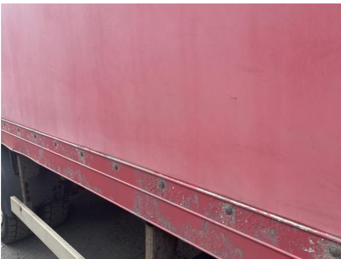
7: Qtr Panel osr Dented With Paint Damage