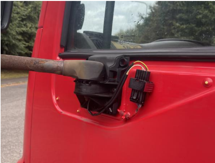
11: Door Mirror Assy nsf Missing Replace