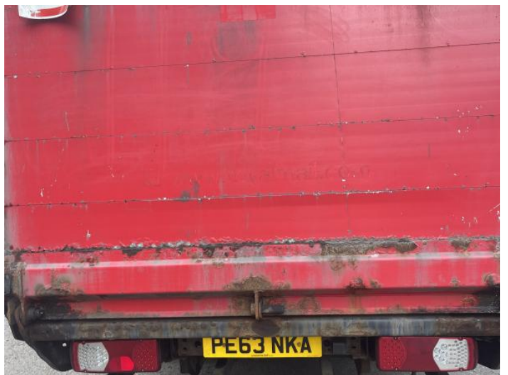
8: Tailgate Rusted Over 5mm