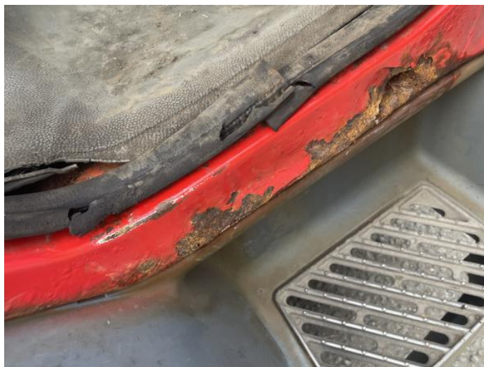
2: Sill os Rusted Over 5mm