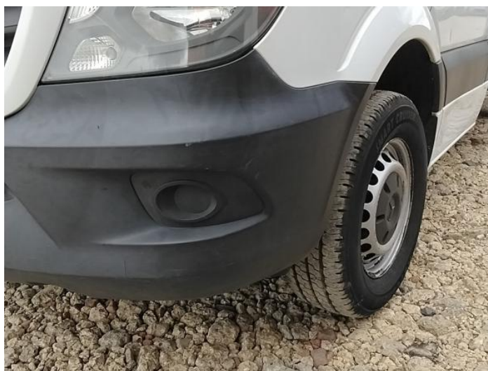
2: Bumper Front Moulding Scuffed (Unpainted) UpTo 100mm