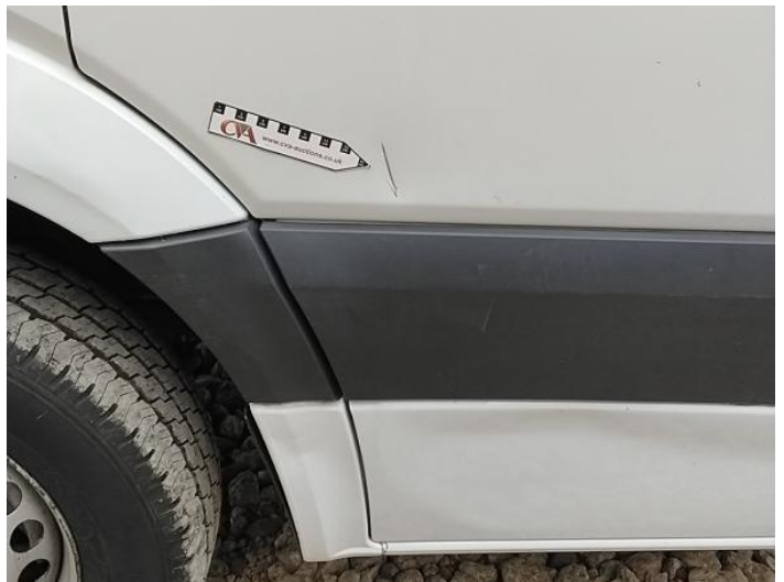
6: Door nsf Dented With Paint Damage