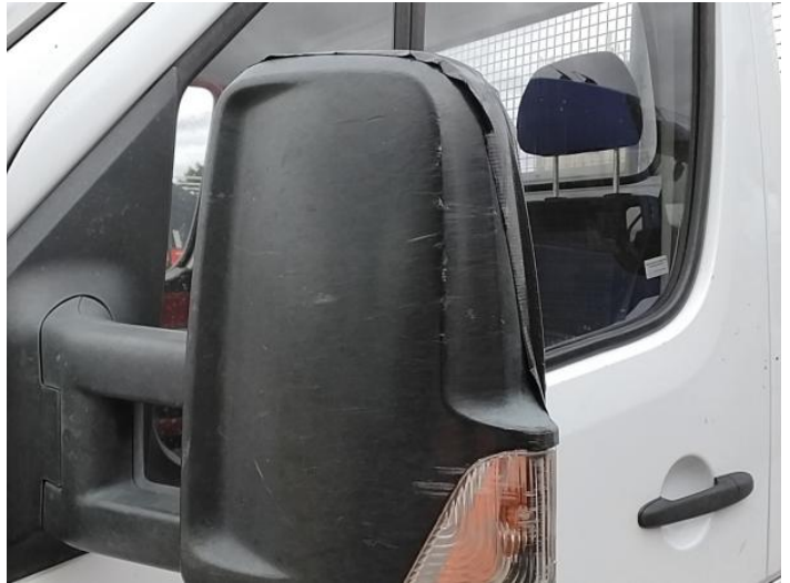
4: Door Mirror Assy nsf Broken Replace