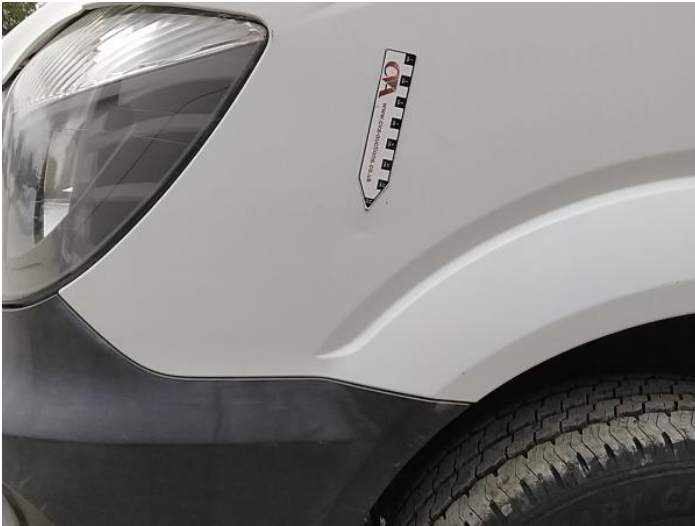
3: Wing nsf Dented 2 Or Less UpTo 10mm