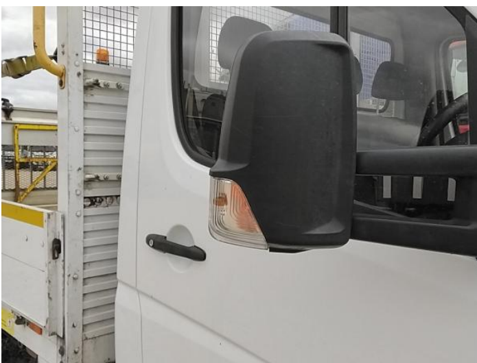
13: Door Mirror Assy osf Scuffed (Unpainted) UpTo 100mm