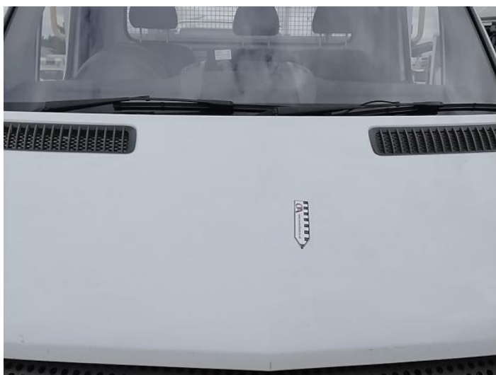
1: Bonnet Scratched UpTo 25mm Thru Paint