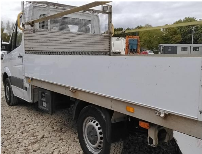
11: Other N/A N/A