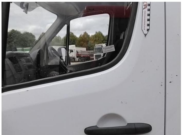
8: Door nsf Chipped Multiple Chips