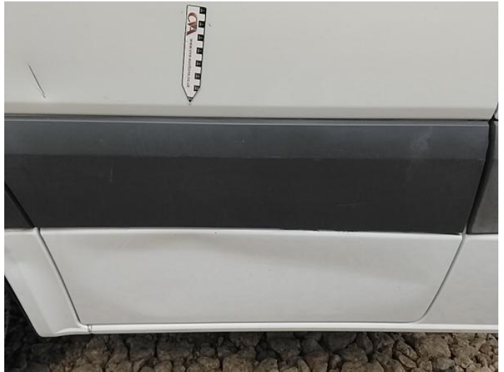
10: Door Moulding nsf Scuffed (Unpainted) UpTo 100mm