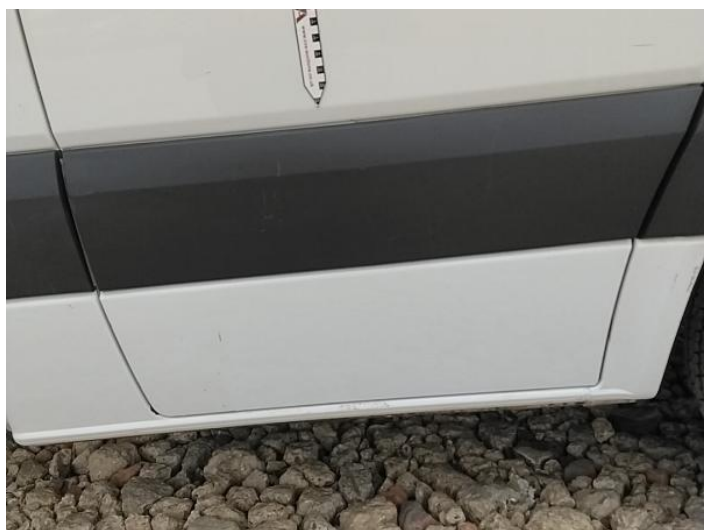
14: Door Moulding osf Scuffed (Unpainted) UpTo 100mm