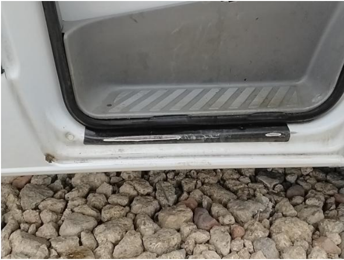
15: Sill os Scratched Over 25mm Thru Paint