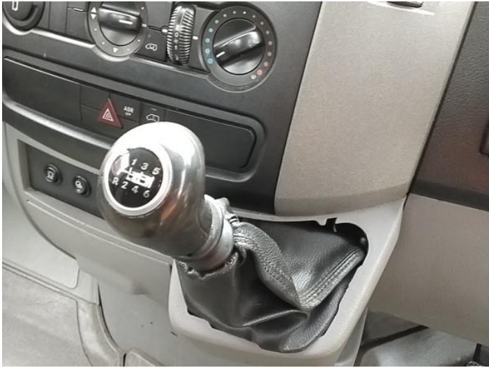
16: Other N/A N/A