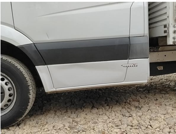
7: Door nsf Dented Over 30mm