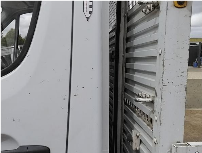
9: B Post ns Chipped Multiple Chips