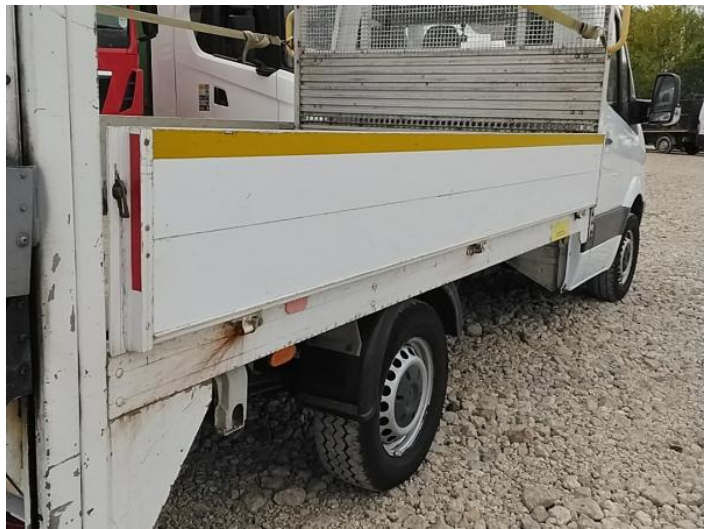
12: Other N/A N/A