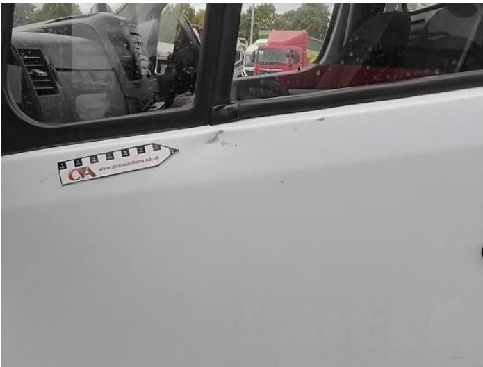
5: Door nsf Dented With Paint Damage