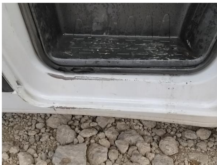
26: Sill os Scratched Over 25mm Thru Paint