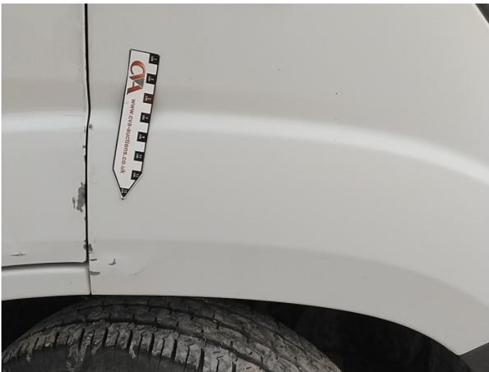
1: Wing osf Dented With Paint Damage