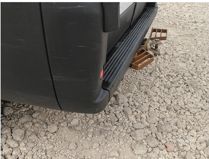
19: Bumper Rear Moulding Scuffed (Unpainted) UpTo 100mm