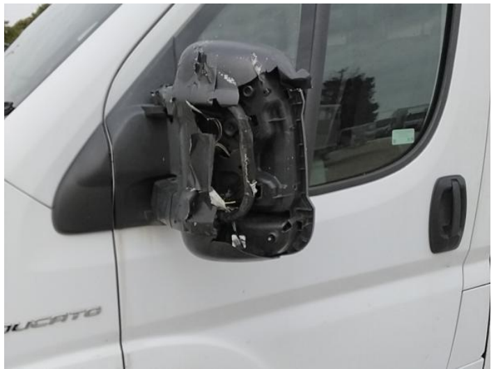
6: Door Mirror Assy nsf Broken Replace