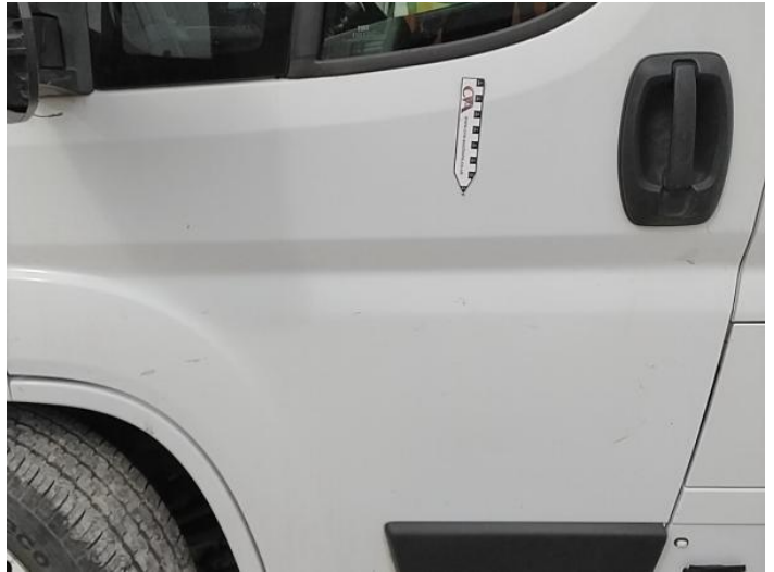
10: Door nsf Scratched Over 25mm Thru Paint