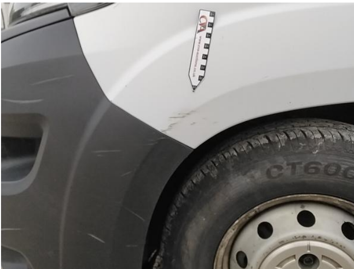
5: Wing nsf Scratched UpTo 25mm Thru Paint