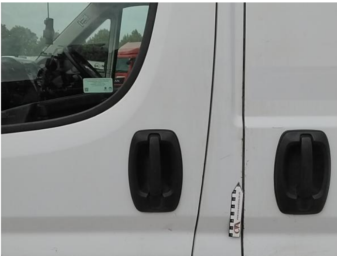
11: B Post ns Dented With Paint Damage