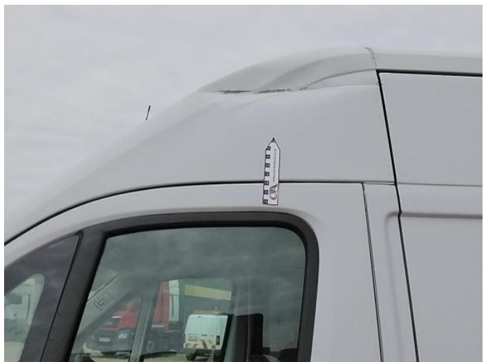
14: Other N/A N/A