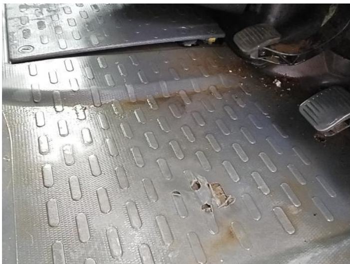
27: Carpets Front Holed Over 3mm