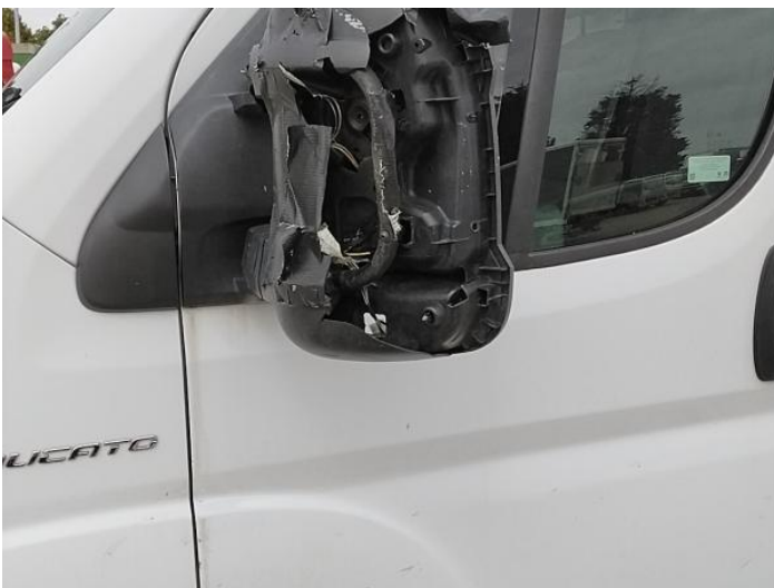
7: Flasher Side Repeater ns Missing Replace