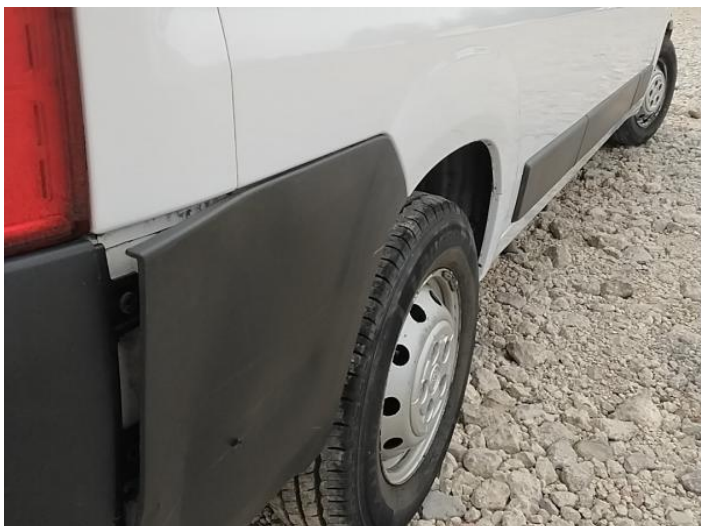
21: Qtr Panel Moulding os Broken Replace