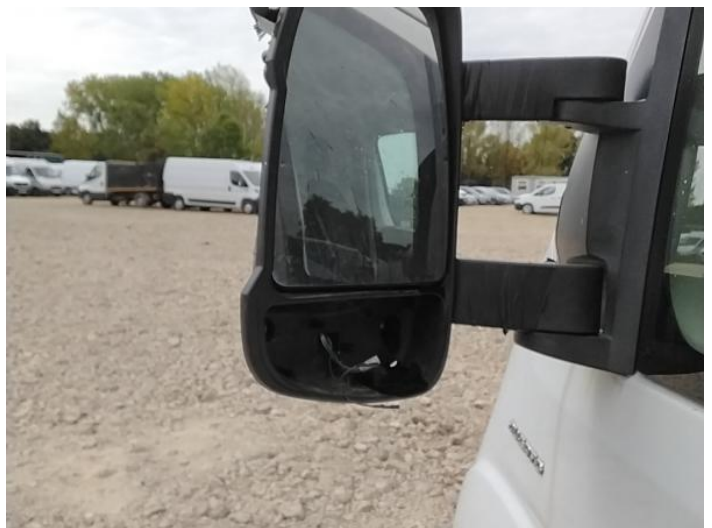
8: Door Mirror Glass ns Broken Replace