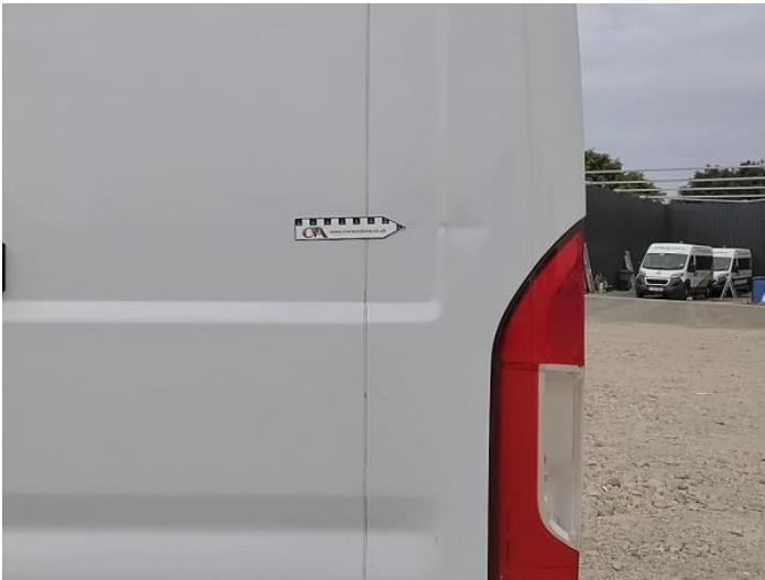
17: Qtr Panel nsr Dented Between 10mm + 30mm