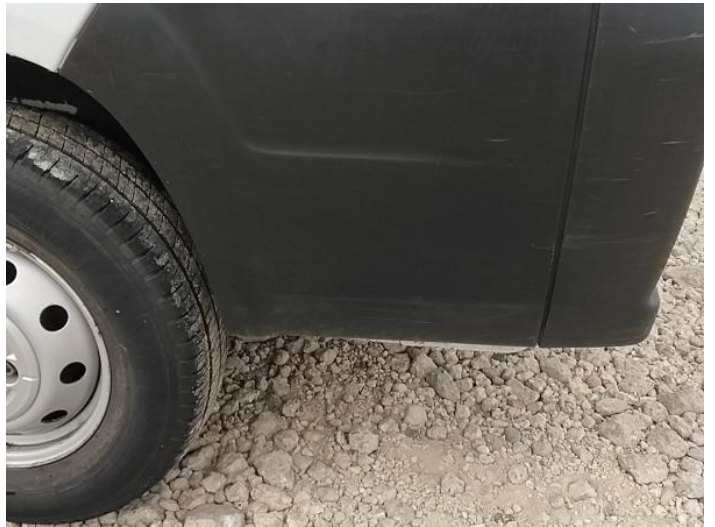
18: Qtr Panel Moulding ns Scuffed (Unpainted) UpTo 100mm