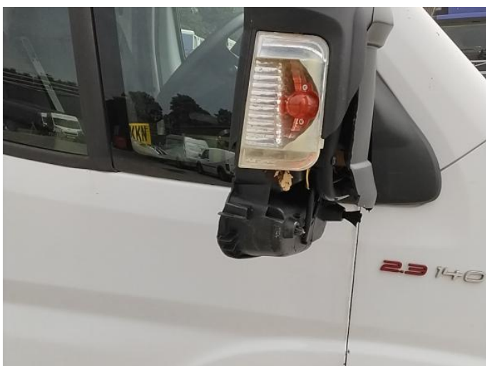
23: Flasher Side Repeater os Broken Replace