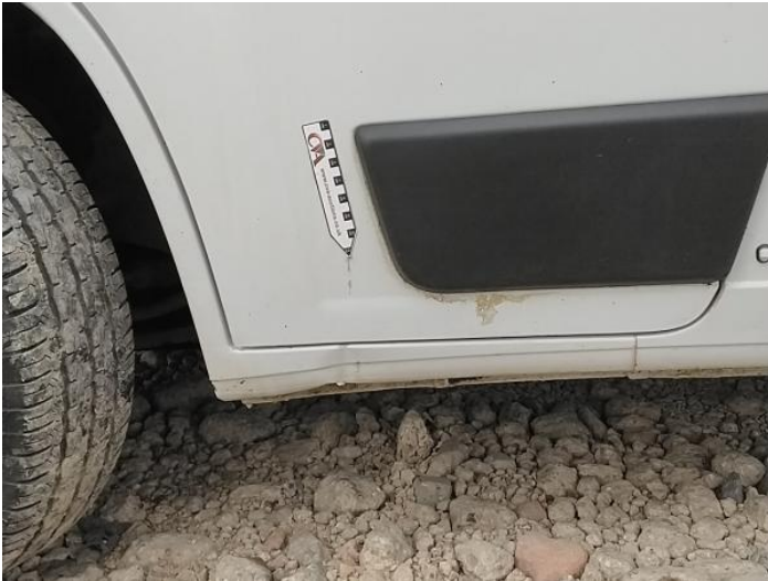
9: Sill ns Dented Between 10mm + 30mm