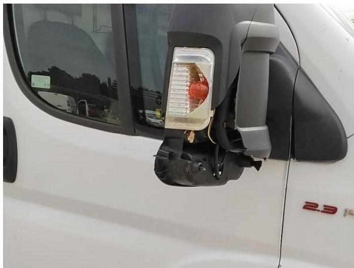
22: Door Mirror Assy osf Broken Replace