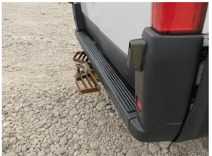
20: Bumper Rear Moulding Scuffed (Unpainted) UpTo 100mm