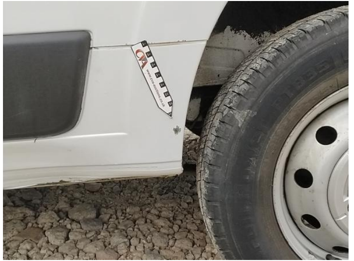
16: Qtr Panel nsr Scratched UpTo 25mm Thru Paint