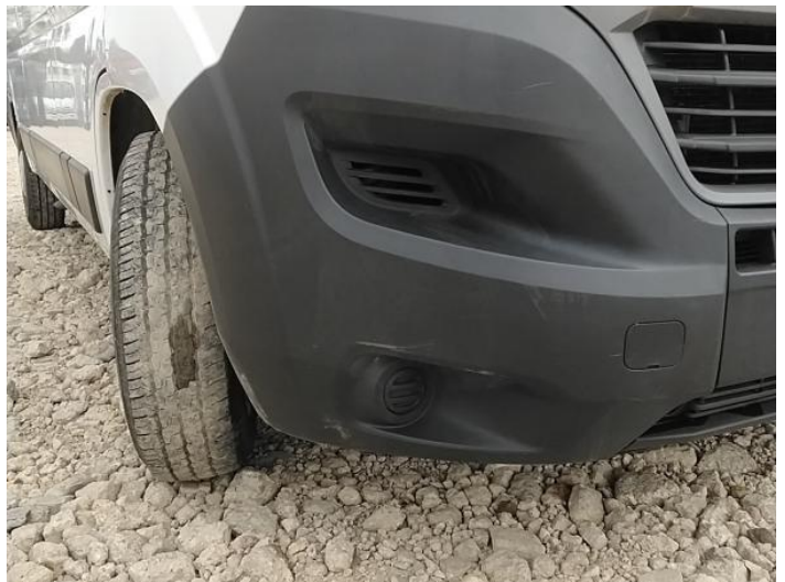
2: Bumper Front Moulding Scuffed (Unpainted) UpTo 100mm