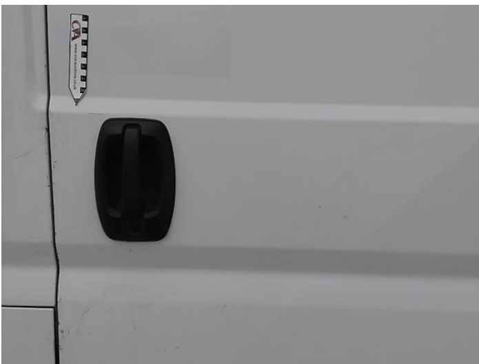
13: Door nsr Scratched UpTo 25mm Thru Paint