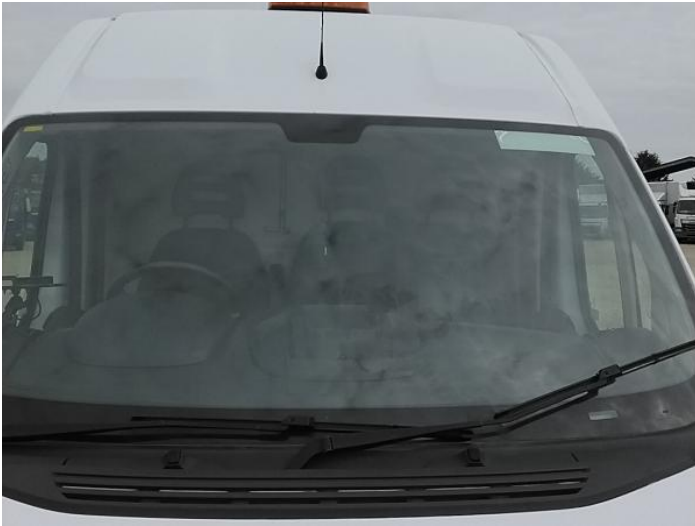
3: Screen Front Chipped UpTo 10mm