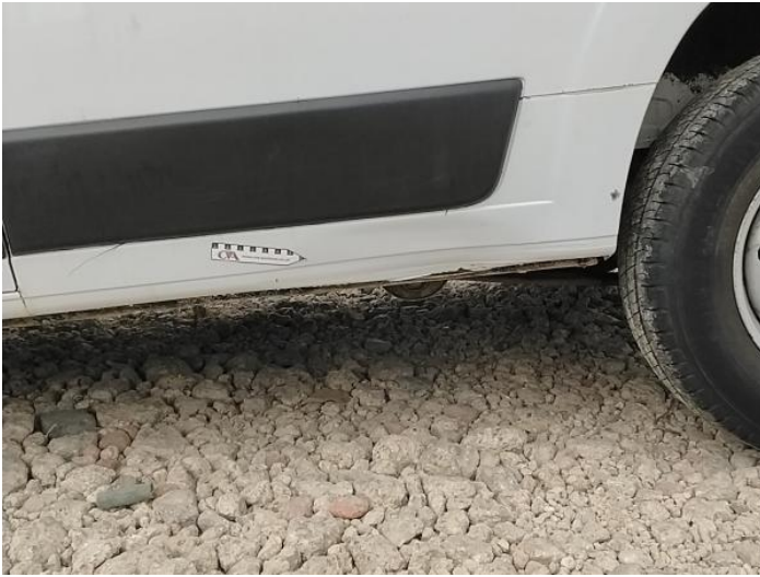
15: Sill ns Dented With Paint Damage