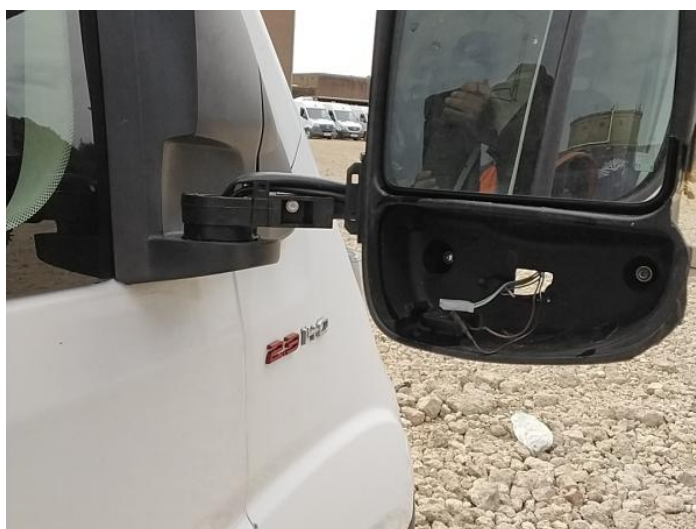
24: Door Mirror Glass os Missing Replace