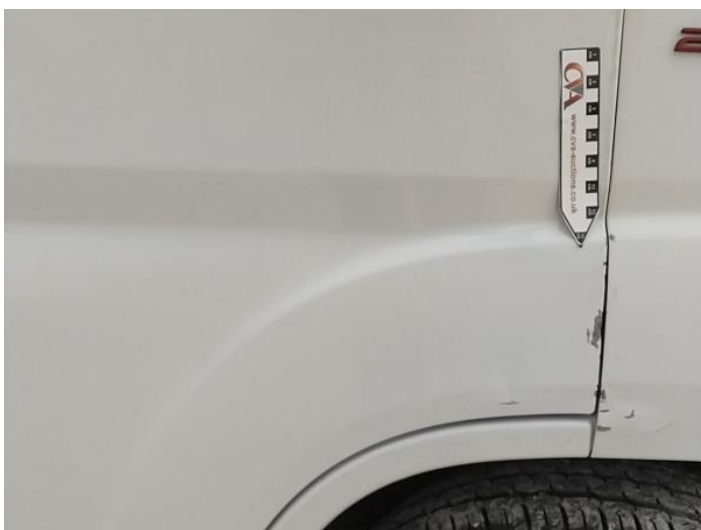
25: Door osf Dented With Paint Damage