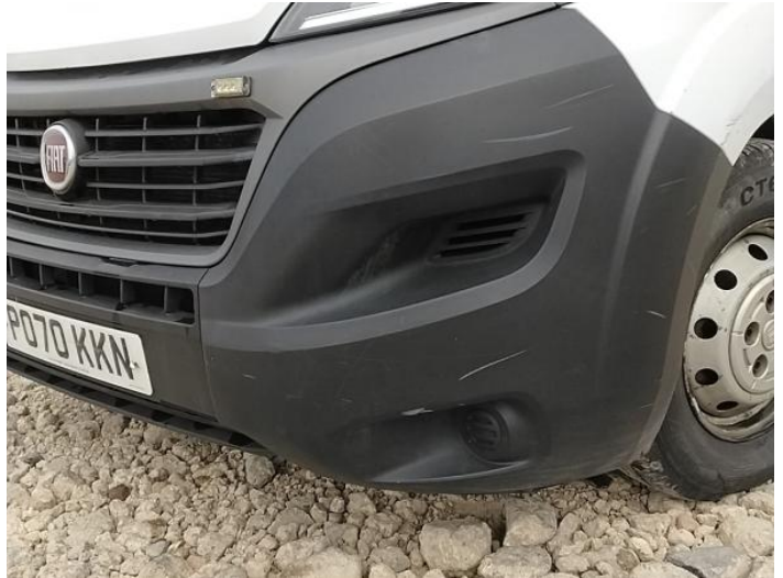
4: Bumper Front Moulding Scuffed (Unpainted) UpTo 100mm