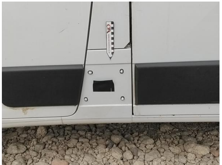
12: Other N/A N/A