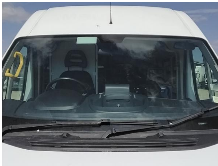
2: Screen Front Chipped UpTo 10mm