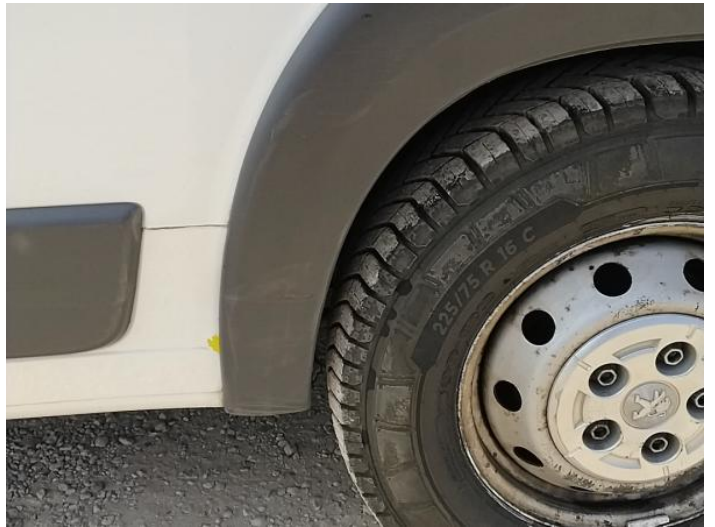
6: Qtr Panel Arch Extension ns Scuffed (Unpainted) UpTo 100mm