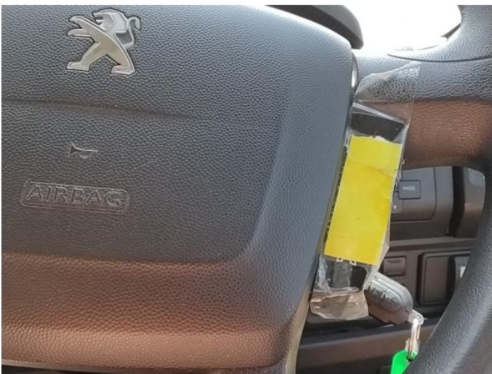
7: Steering Wheel Damaged Replace