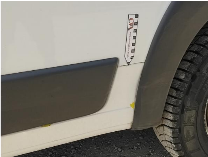
5: Qtr Panel nsr Dented Between 10mm + 30mm