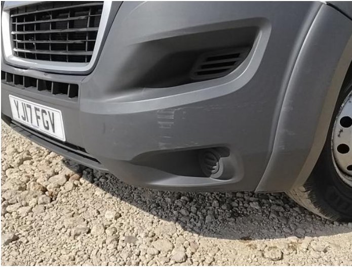
3: Bumper Front Moulding Scuffed (Unpainted) UpTo 100mm