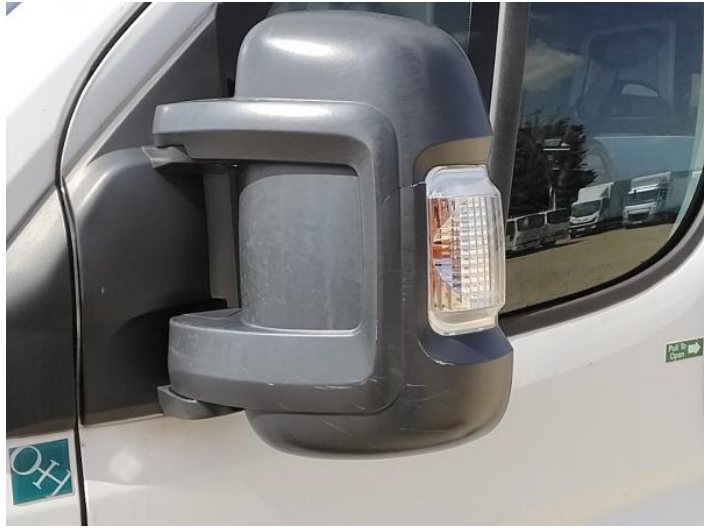
4: Door Mirror Assy nsf Broken Replace