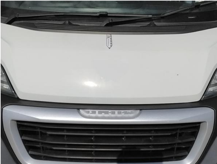
3: Bonnet Chipped Multiple Chips