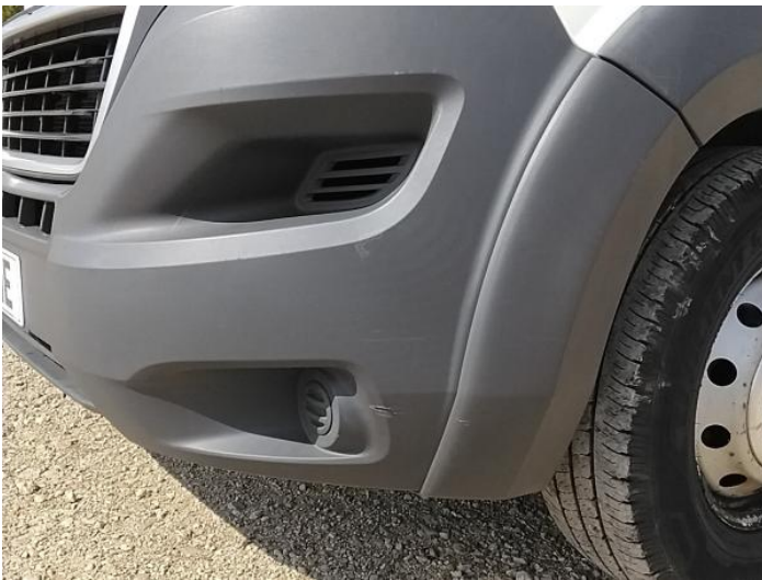
5: Bumper Front Moulding Scuffed (Unpainted) UpTo 100mm