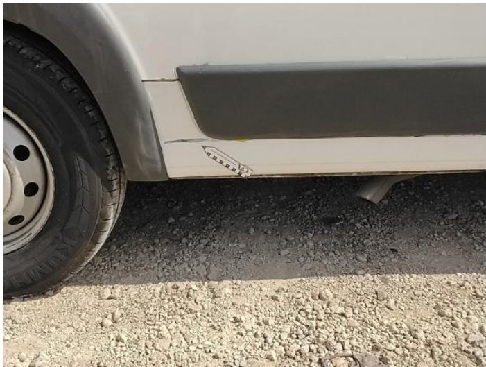
9: Qtr Panel osr Dented With Paint Damage