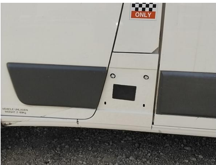
7: Other N/A N/A