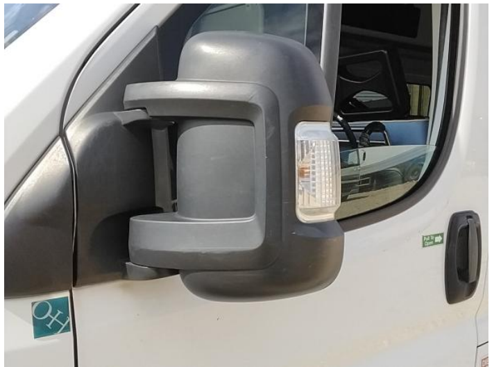
6: Door Mirror Assy nsf Scuffed (Unpainted) UpTo 100mm