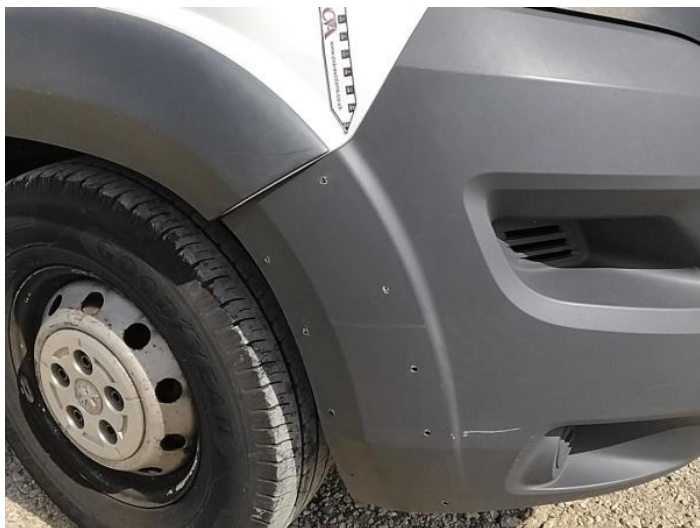
1: Bumper Front Moulding Missing Replace