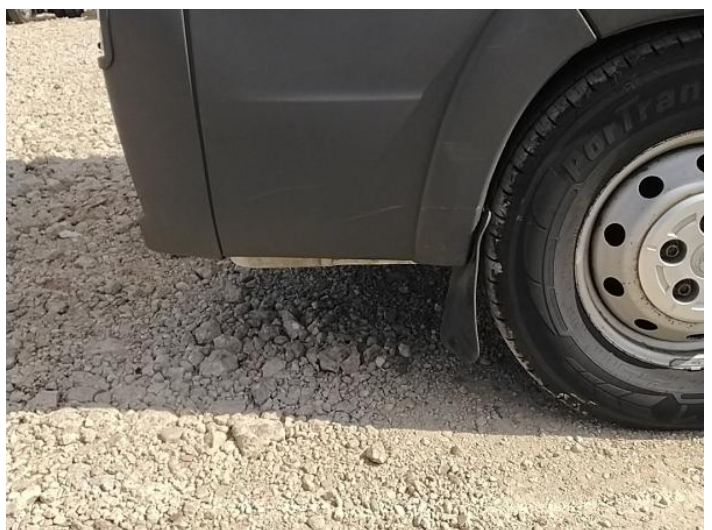
8: Qtr Panel Moulding os Scuffed (Unpainted) UpTo 100mm