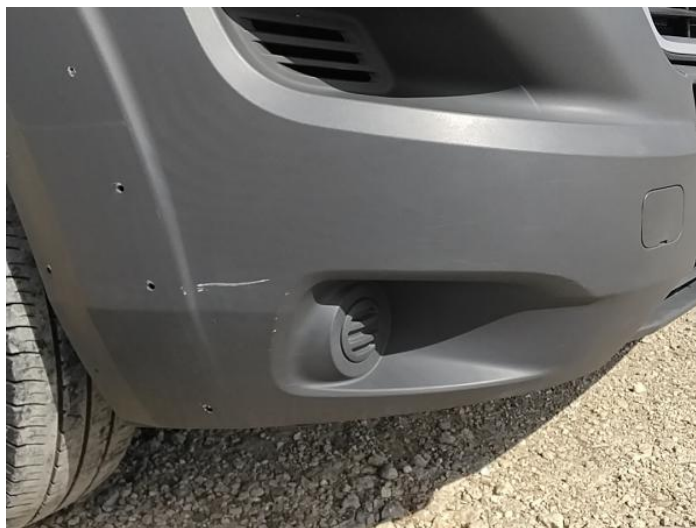
2: Bumper Front Moulding Scuffed (Unpainted) UpTo 100mm