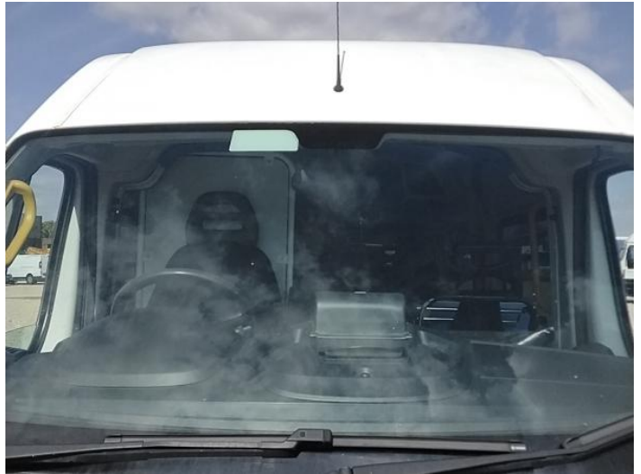
4: Screen Front Chipped Over 10mm