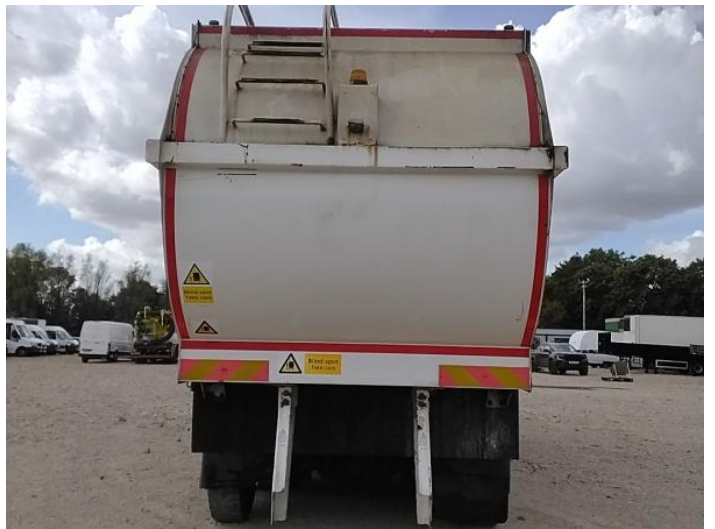
12: Number Plate Rear Missing Replace