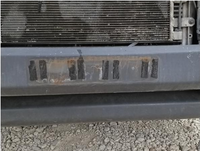
3: Number Plate Front Missing Replace