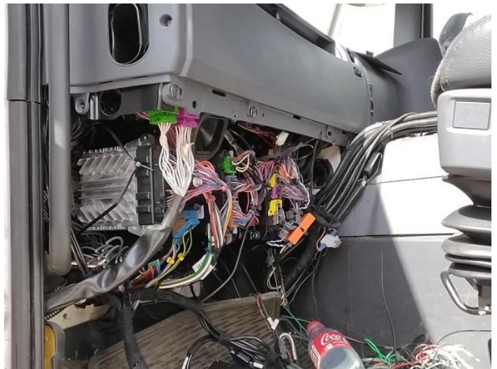
6: Other N/A N/A