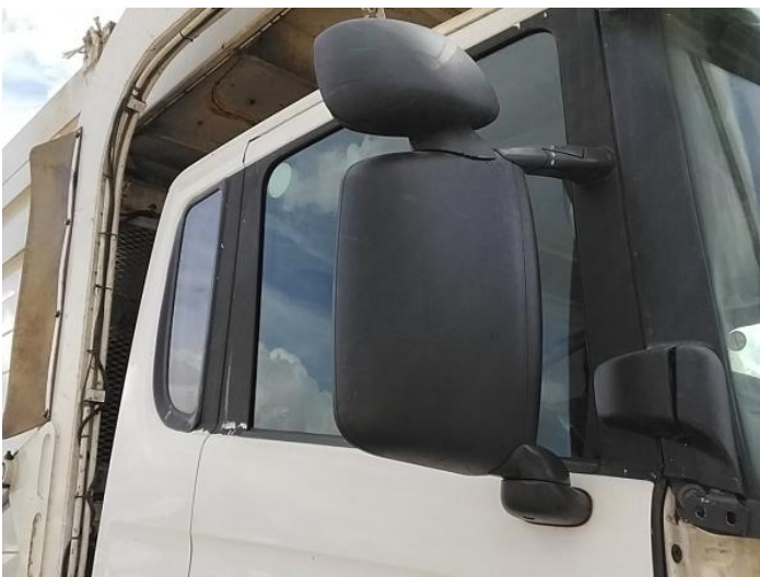
13: Door Mirror Assy osf Scuffed (Unpainted) UpTo 100mm