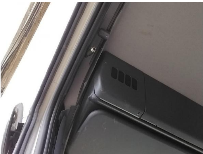
7: Other N/A N/A