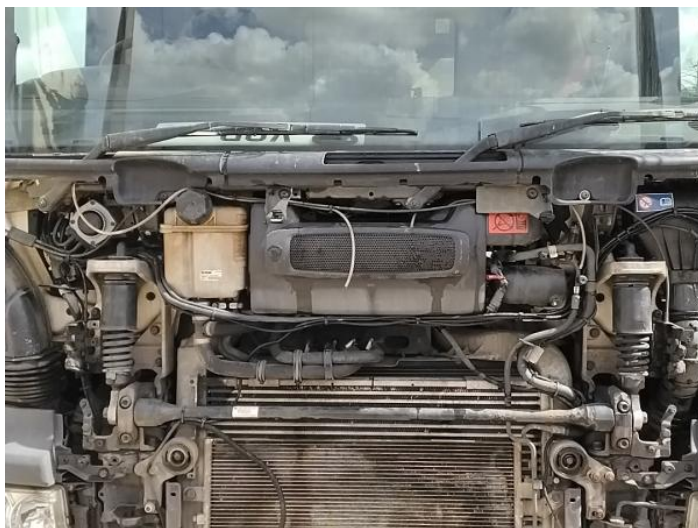
1: Bonnet Missing Replace