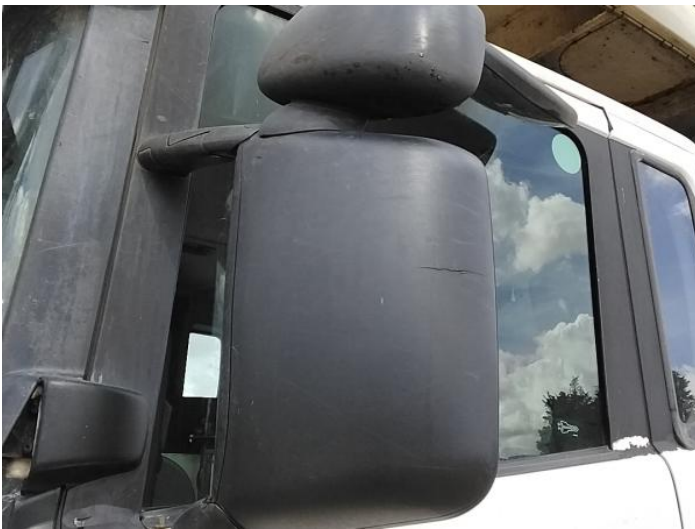
5: Door Mirror Assy nsf Broken Replace