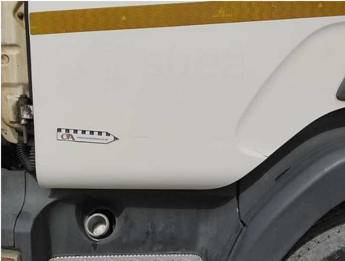
9: Door nsf Scratched Over 25mm Thru Paint