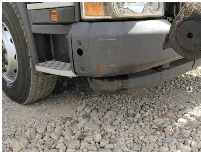
2: Bumper Front Moulding Scuffed (Unpainted) UpTo 100mm