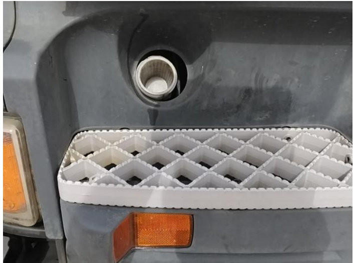
10: Other N/A N/A