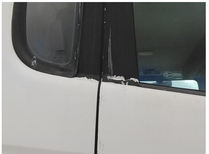
14: Other N/A N/A