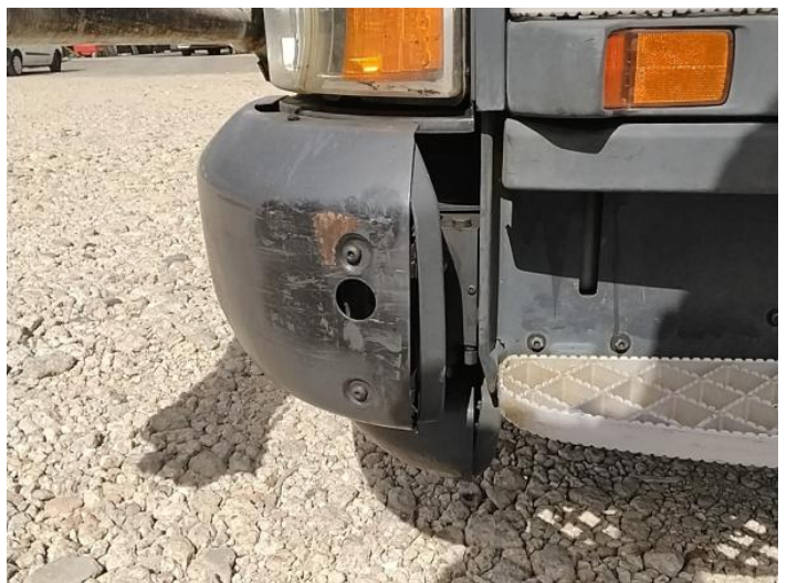
8: Bumper Front Moulding Scuffed (Unpainted) UpTo 100mm