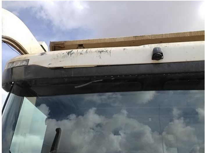
4: Other N/A N/A