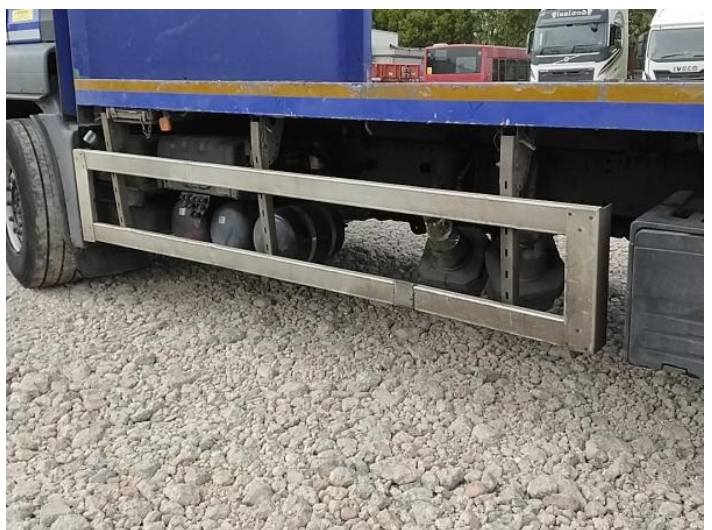
14: Other N/A N/A