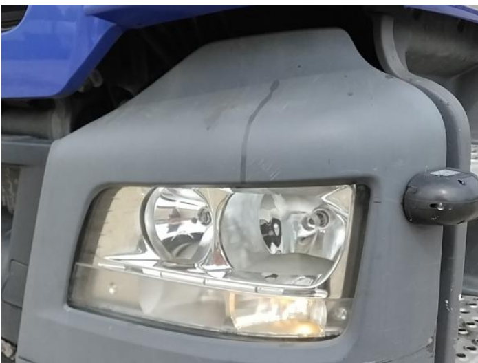
7: Fog Lamp Surround ns Scuffed (Unpainted) Over 100mm