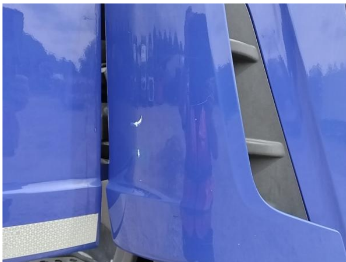
1: Wing osf Scratched UpTo 25mm Thru Paint