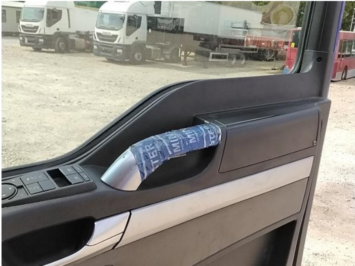
22: Handle Inner osf Damaged Replace