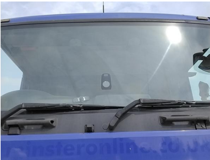
5: Screen Front Cracked Replace