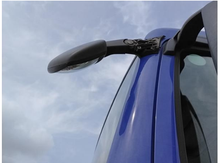
10: Door Mirror Assy nsf Broken Replace