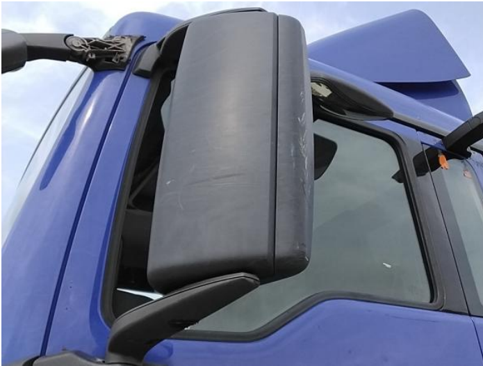
9: Door Mirror Assy nsf Scuffed (Unpainted) UpTo 100mm