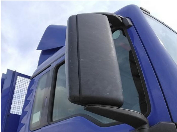
16: Door Mirror Assy osf Scuffed (Unpainted) UpTo 100mm