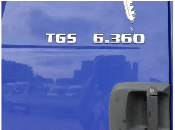
12: Door nsf Scratched UpTo 25mm Thru Paint