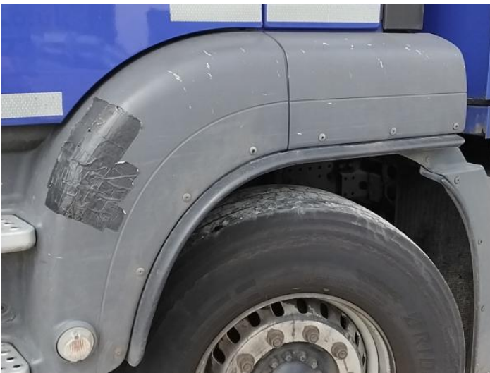
11: Other N/A N/A