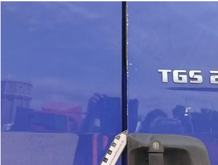
19: Door osf Chipped Edge Chip