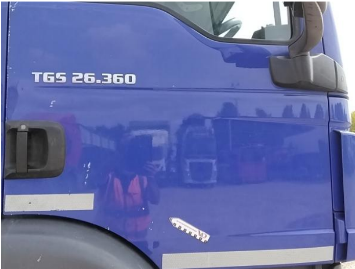
17: Door osf Scratched UpTo 25mm Thru Paint