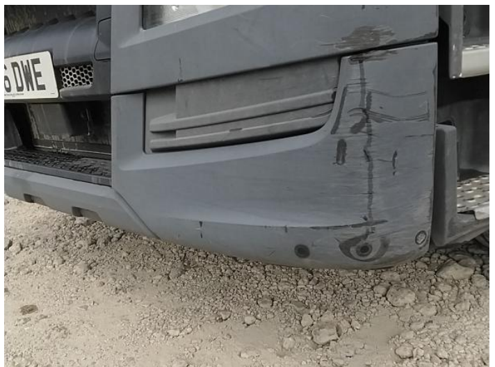
8: Bumper Front Moulding Scuffed (Unpainted) Over 100mm