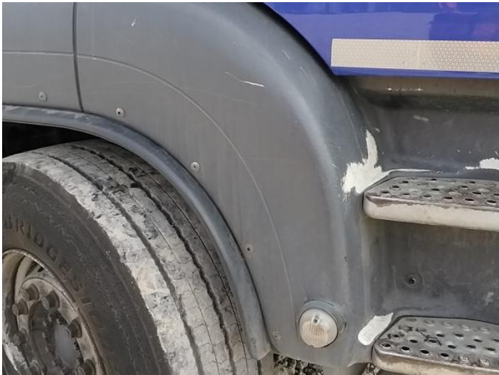
18: Other N/A N/A