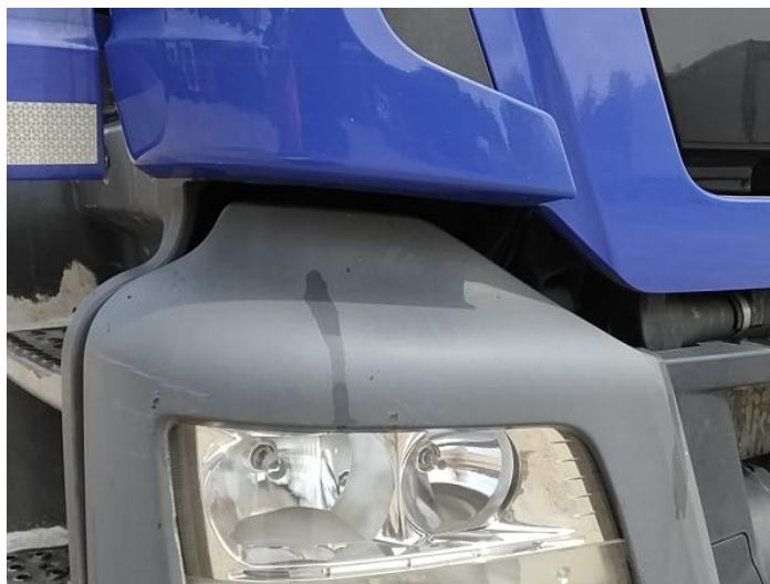
2: Fog Lamp Surround os Scuffed (Unpainted) Over 100mm