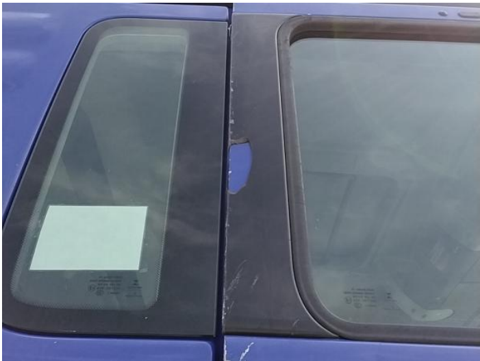
20: Other N/A N/A