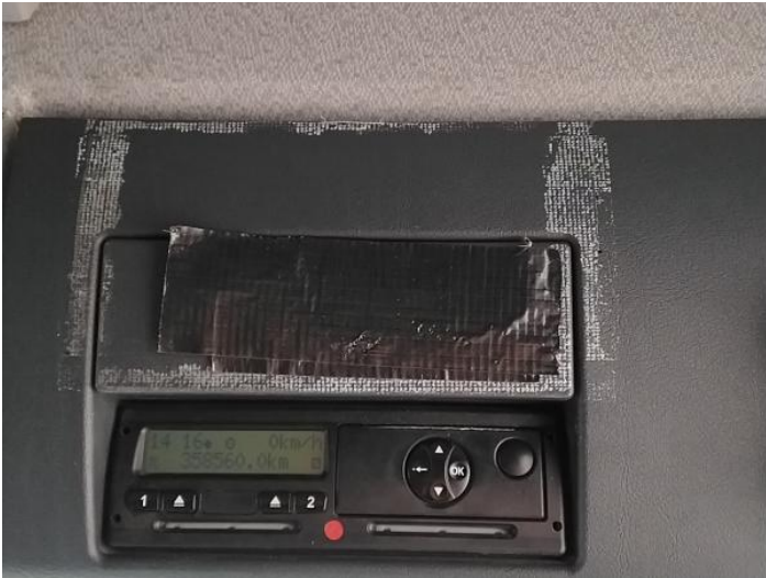
21: Other N/A N/A