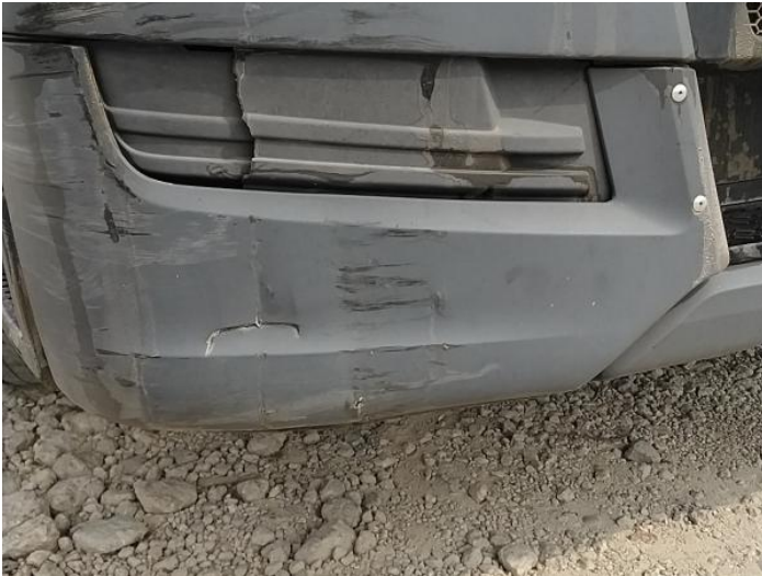
3: Bumper Front Moulding Broken Replace