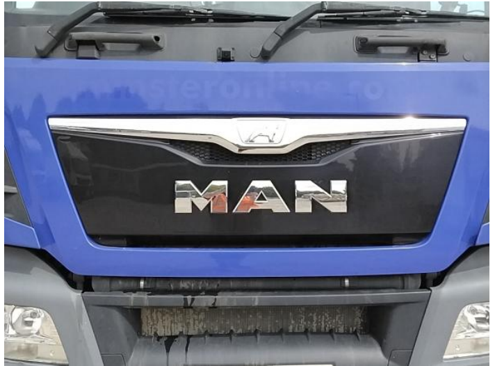
4: Bonnet Chipped 1 To 5