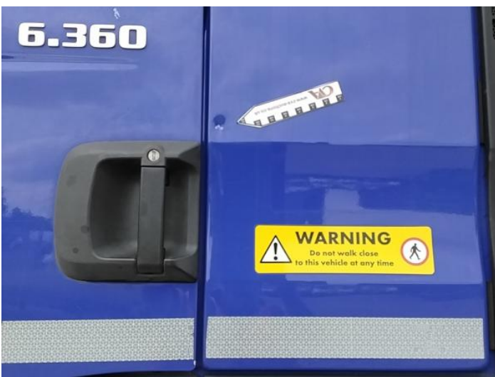
13: Other N/A N/A