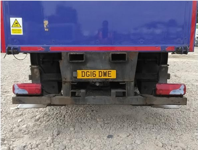
15: Bumper Rear Rusted Over 5mm