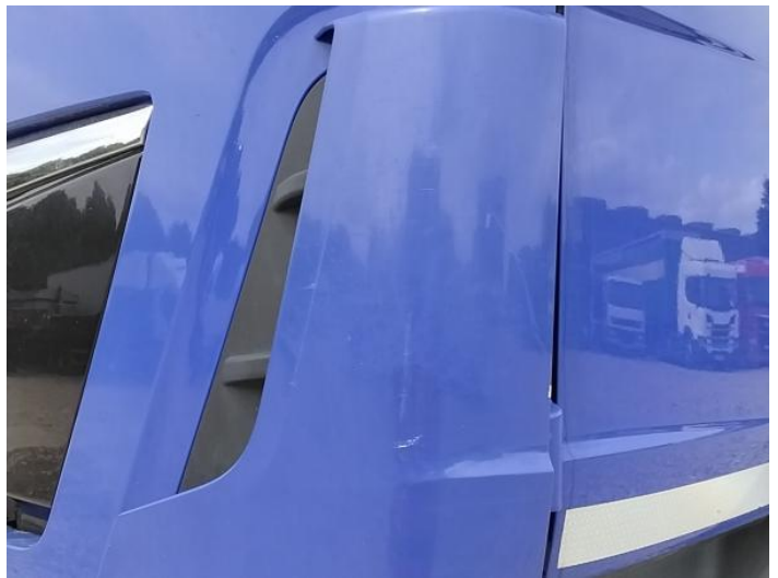
6: Wing nsf Scratched UpTo 25mm Thru Paint