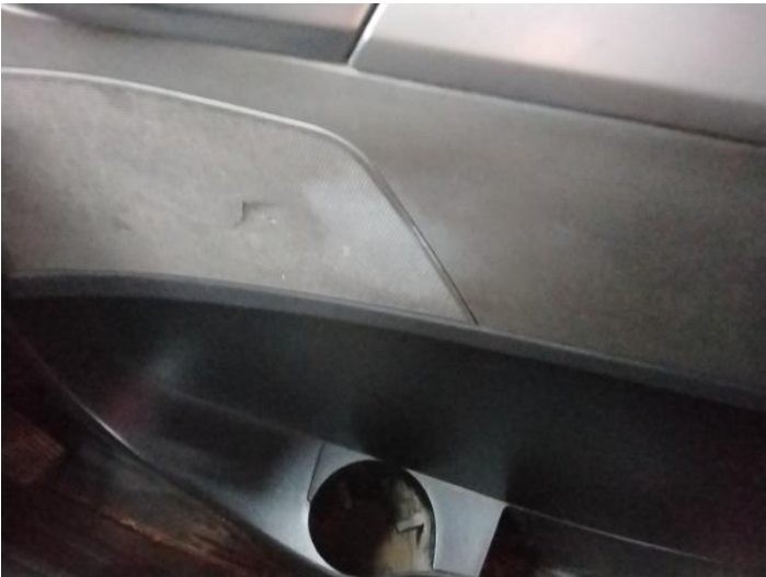
1: Door Pad osf Broken Replace