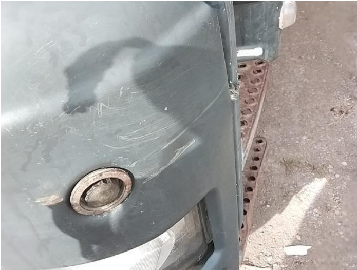
3: Bumper Front Dented With Paint Damage