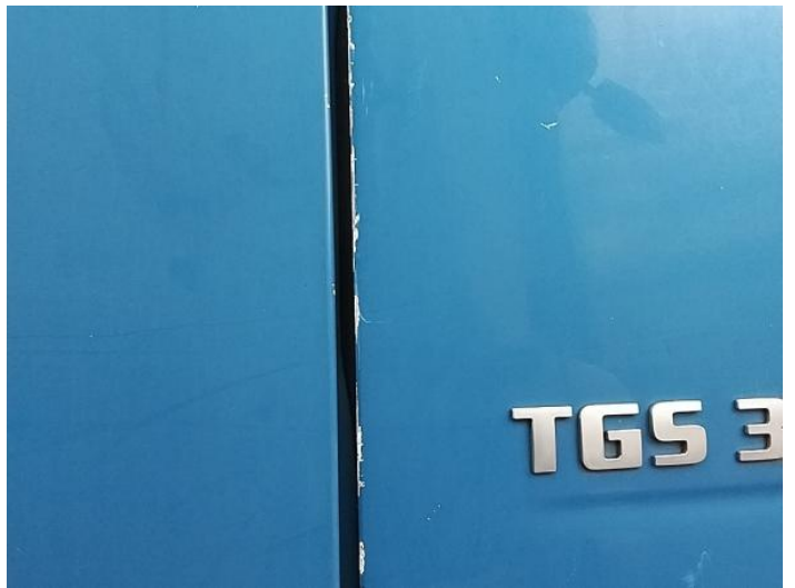
6: Door osf Chipped Multiple Chips