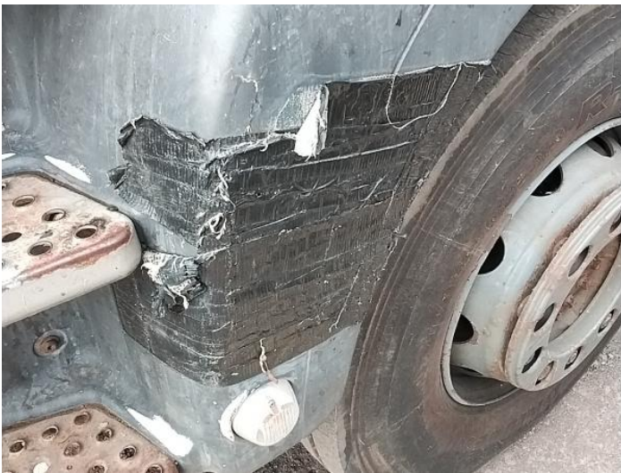
5: Moulding nsf Wing Broken Replace