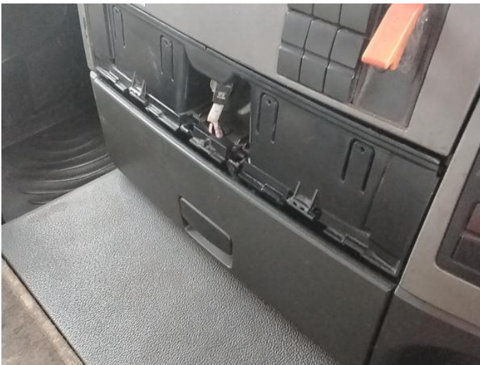
11: Centre Console Front Missing Replace