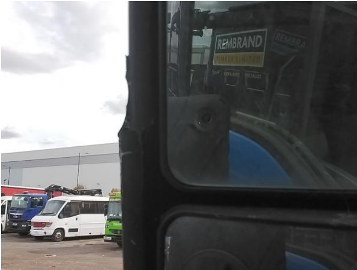
9: Door Mirror Assy nsf Broken Replace