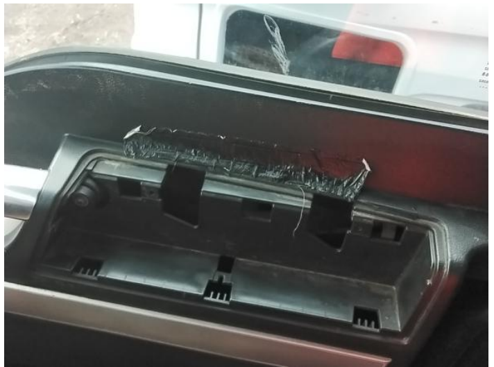
12: Door Pad osf Missing Replace