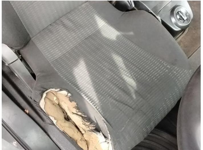
10: Seat Base Cover osf Torn Over 3mm