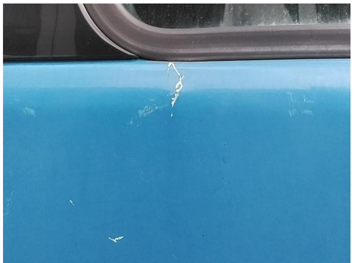
8: Door osf Dented With Paint Damage