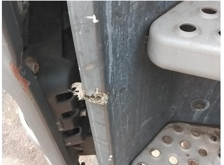
4: Moulding nsf Wing Broken Replace