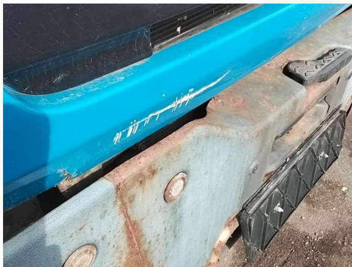
2: Bumper Front Grill Broken Replace