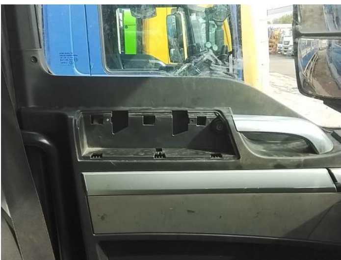
13: Door Pad nsf Missing Replace