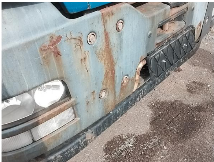
1: Bumper Front Rusted Over 5mm