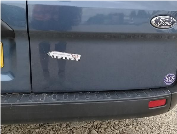
9: Door osr Scratched UpTo 25mm Thru Paint