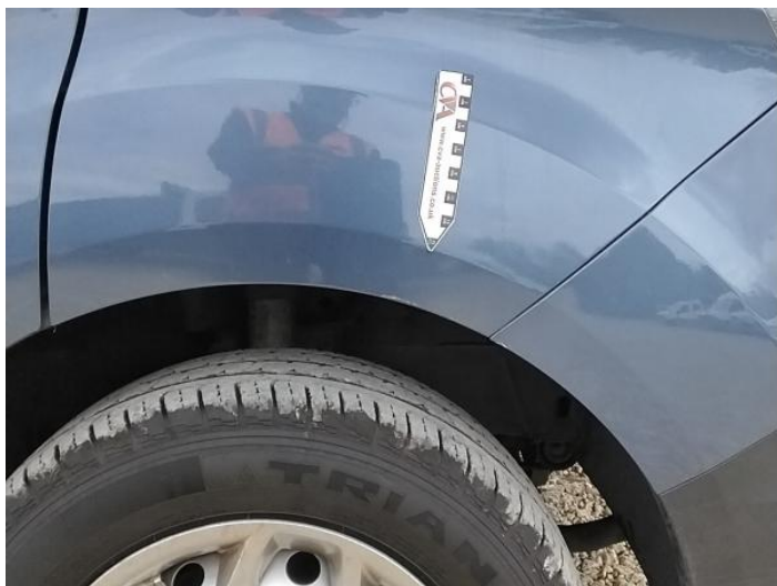
1: Wing osf Scratched UpTo 25mm Thru Paint