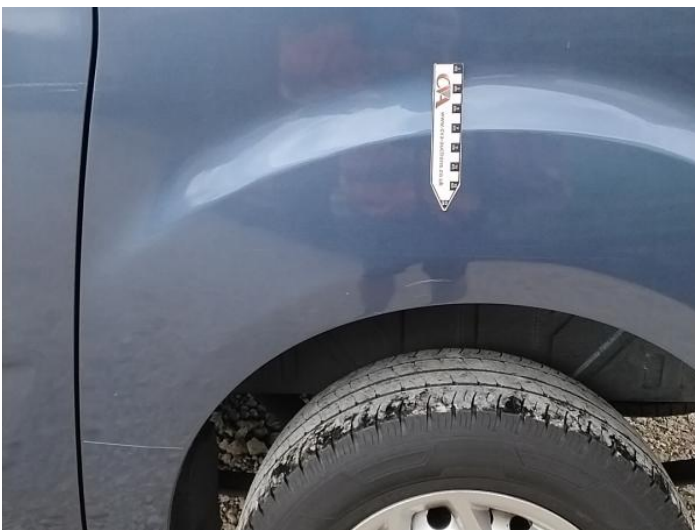
7: Qtr Panel nsr Scratched UpTo 25mm Thru Paint