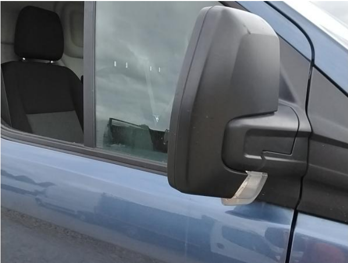
10: Door Mirror Assy osf Scuffed (Unpainted) UpTo 100mm