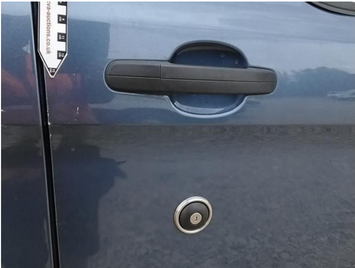
11: Door osf Chipped Edge Chip