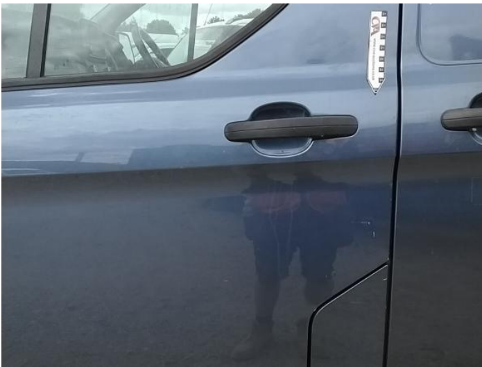
5: Door nsf Scratched UpTo 25mm Thru Paint