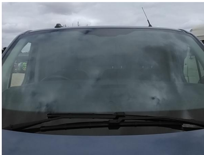
2: Screen Front Chipped UpTo 10mm