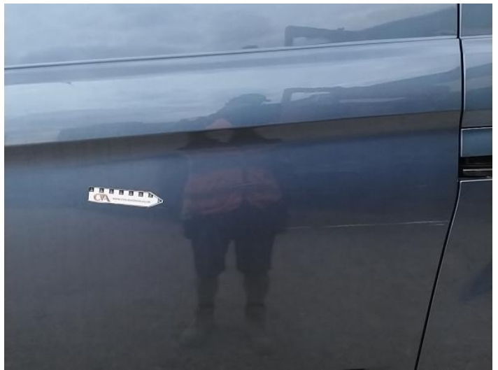
6: Door nsr Scratched Over 25mm Thru Paint