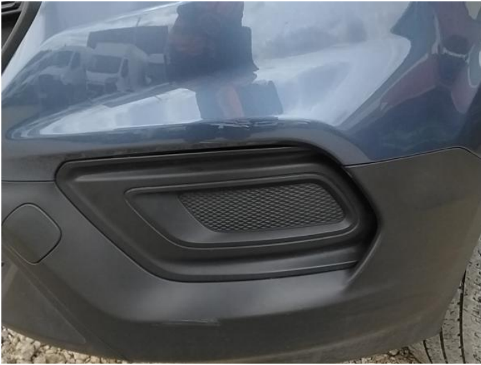
3: Panel Front Scratched UpTo 25mm Thru Paint