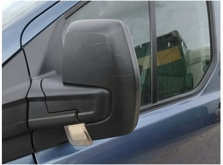
4: Door Mirror Assy nsf Scuffed (Unpainted) UpTo 100mm