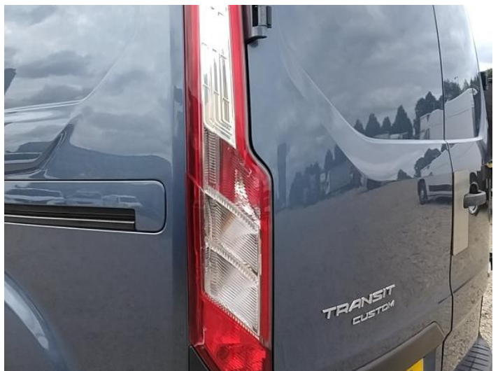
8: Lamp nsr Broken Replace