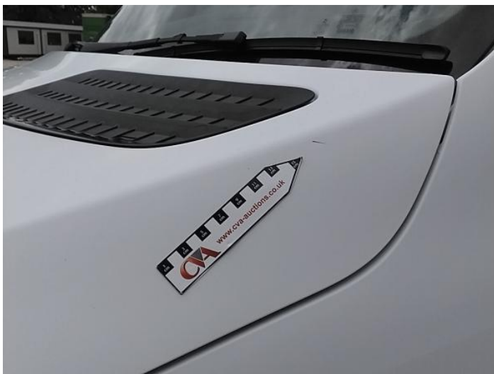
1: Bonnet Scratched UpTo 25mm Thru Paint