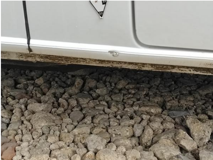
4: Sill os Dented With Paint Damage