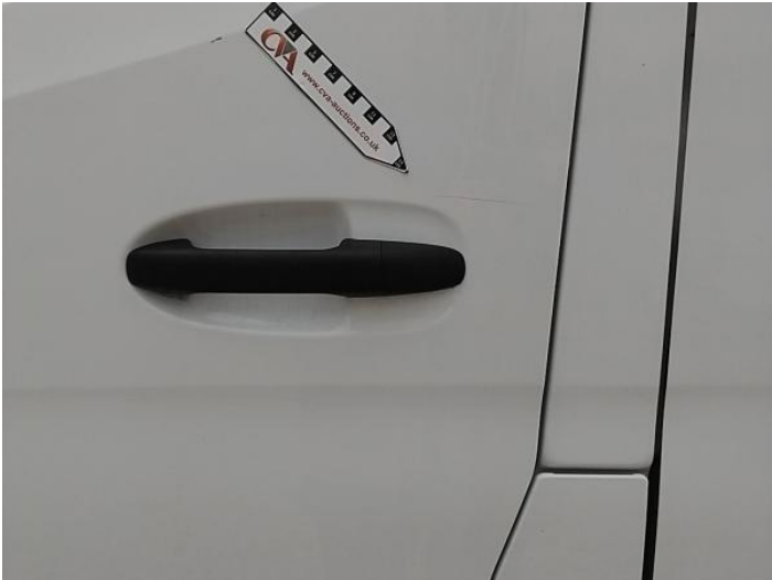
3: Door nsf Scratched UpTo 25mm Not Thru Paint