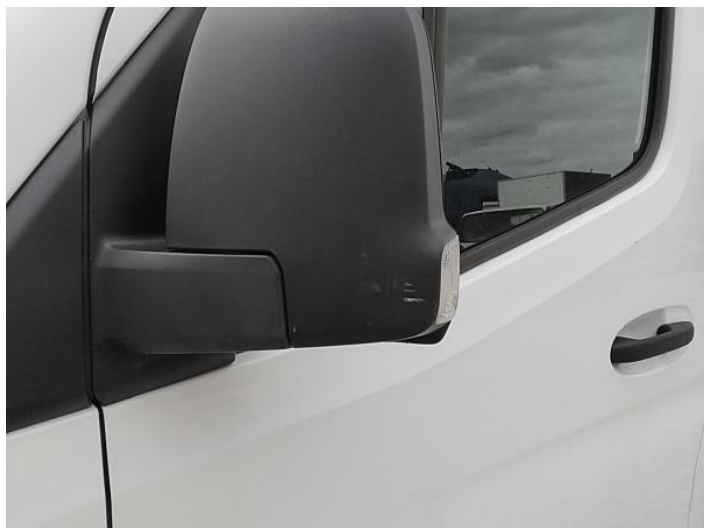
2: Door Mirror Assy nsf Scuffed (Unpainted) UpTo 100mm