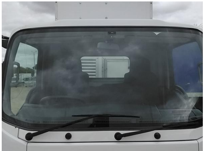
2: Screen Front Cracked Replace