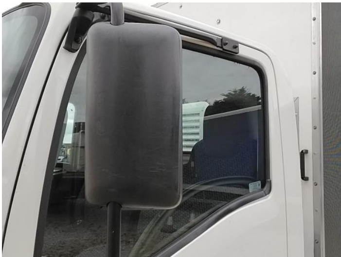
3: Door Mirror Assy nsf Scuffed (Unpainted) UpTo 100mm