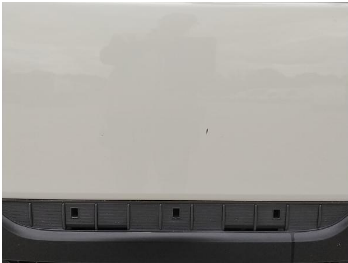
1: Bonnet Scratched UpTo 25mm Thru Paint