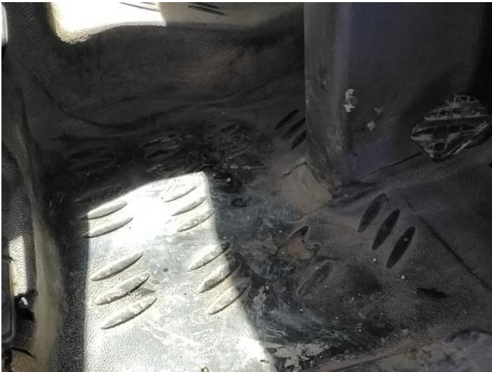
17: Carpets Front Holed Over 3mm