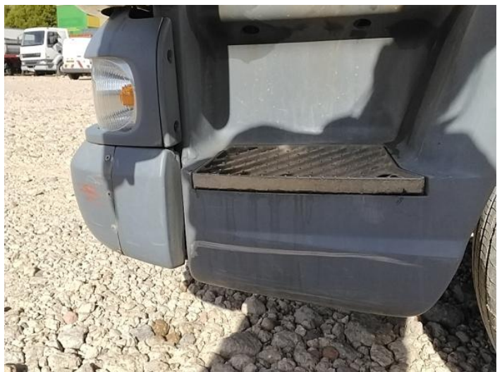
8: Other N/A N/A