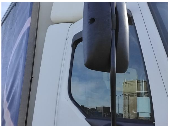
14: Door Mirror Assy osf Scuffed (Unpainted) UpTo 100mm