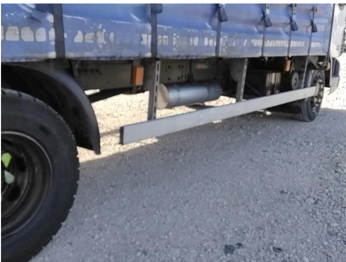
13: Other N/A N/A