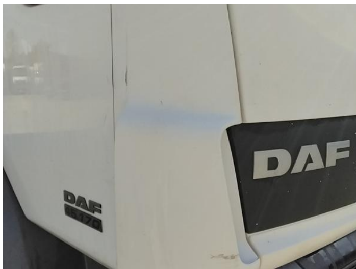
1: Wing osf Scratched UpTo 25mm Thru Paint