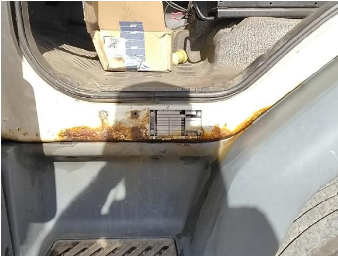
9: Other N/A N/A