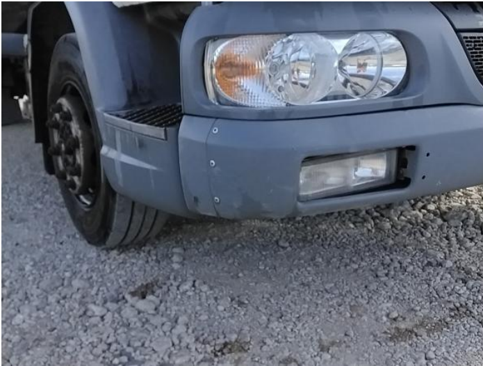
3: Bumper Front Moulding Scuffed (Unpainted) UpTo 100mm