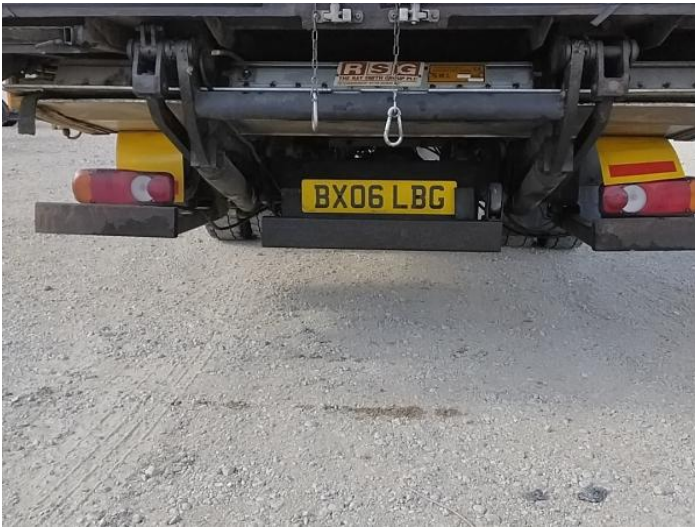
11: Bumper Rear Rusted Over 5mm