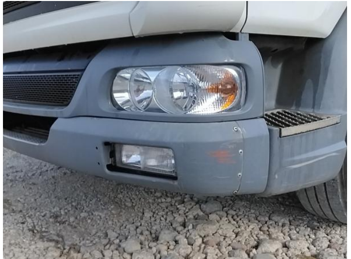
4: Bumper Front Moulding Scuffed (Unpainted) UpTo 100mm