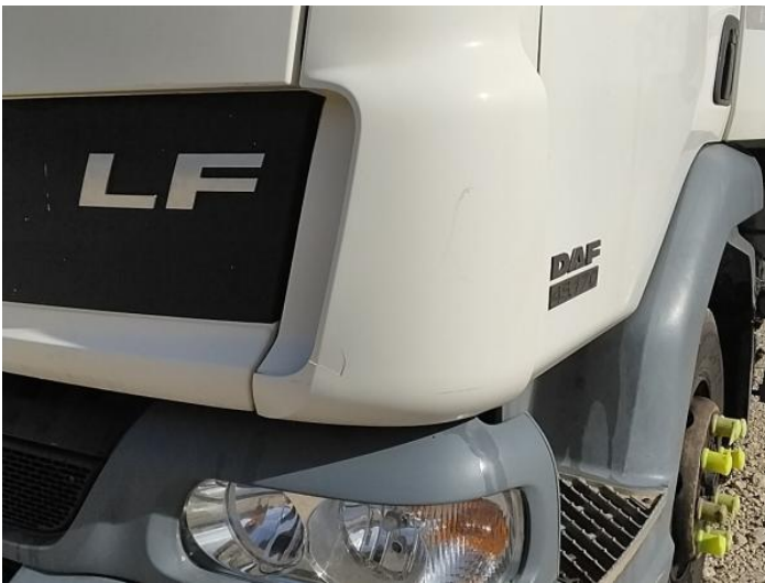
5: Wing nsf Cracked Replace