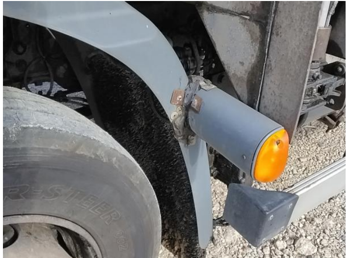
10: Flasher Side Repeater ns Broken Replace