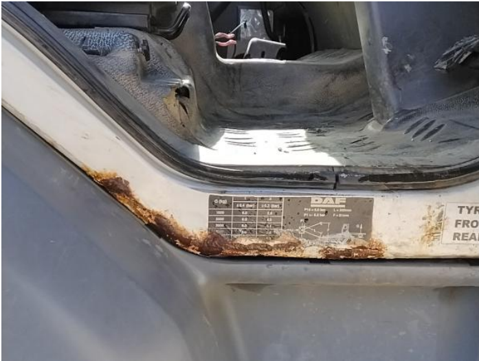
15: Other N/A N/A