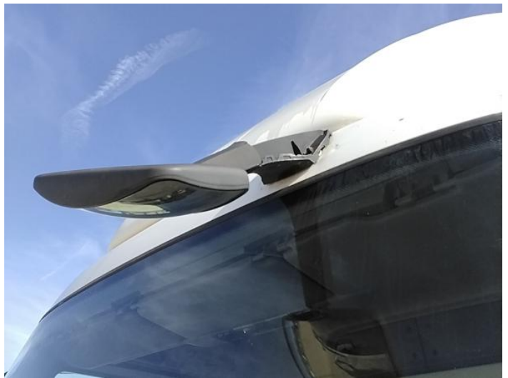
6: Door Mirror Assy nsf Missing Replace