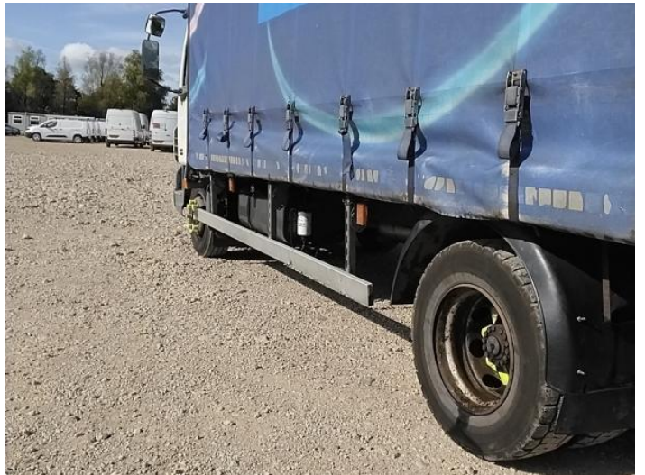
12: Other N/A N/A