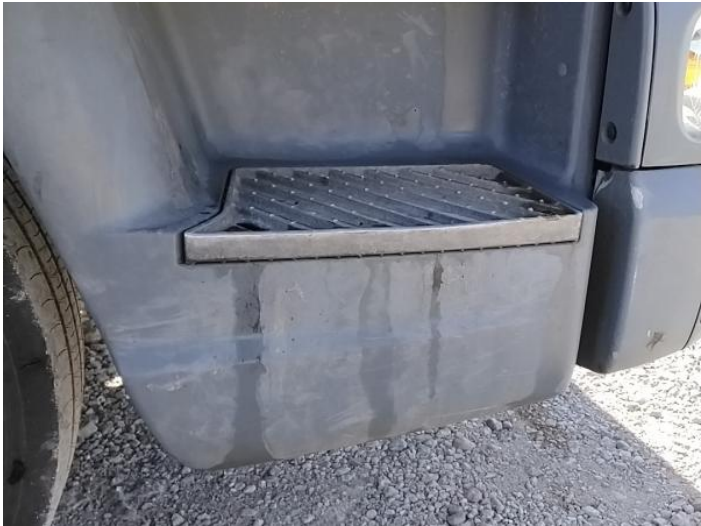
16: Other N/A N/A