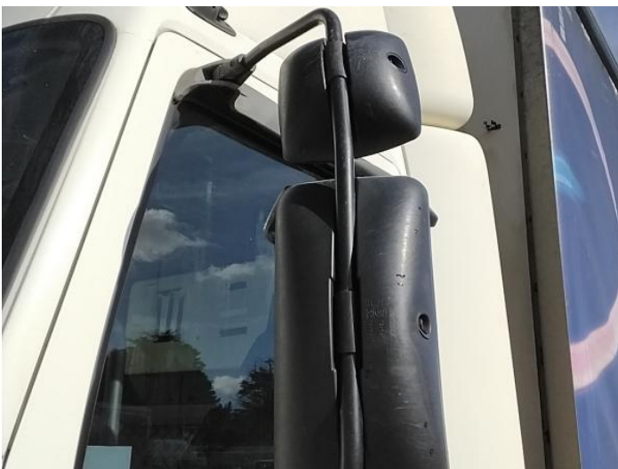
7: Door Mirror Assy nsf Scuffed (Unpainted) UpTo 100mm