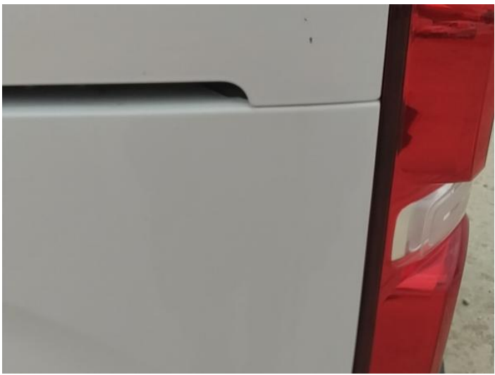
2: Qtr Panel nsr Chipped 1 To 5