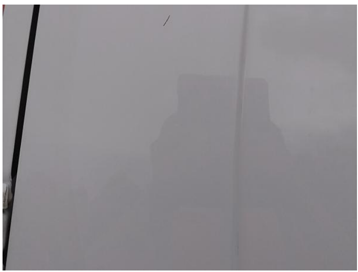
3: Qtr Panel osr Scratched UpTo 25mm Thru Paint