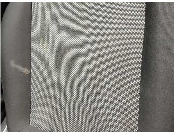
7: Seat Base Cover nsf Soiled Heavy