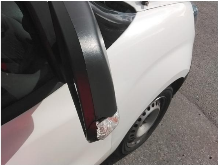
5: Door Mirror Assy osf Broken Replace