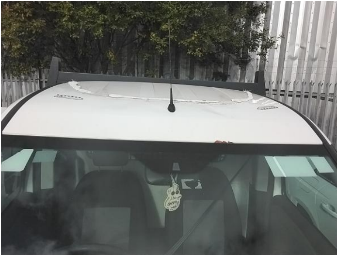
3: Roof Dented Over 30mm