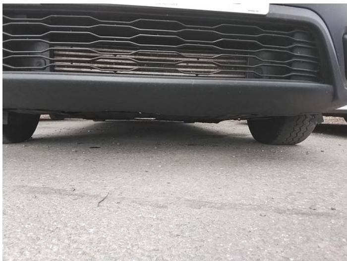
1: Bumper Front Moulding Missing Replace