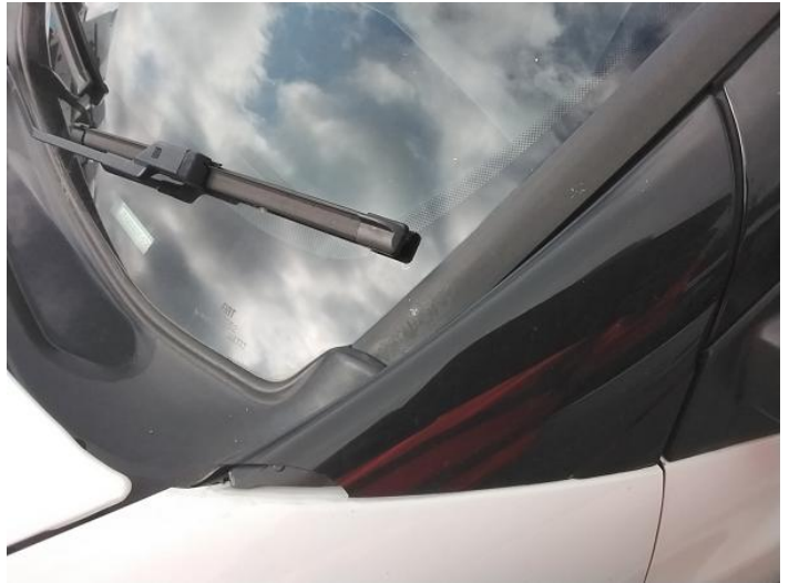
4: Door Moulding nsf Broken Replace