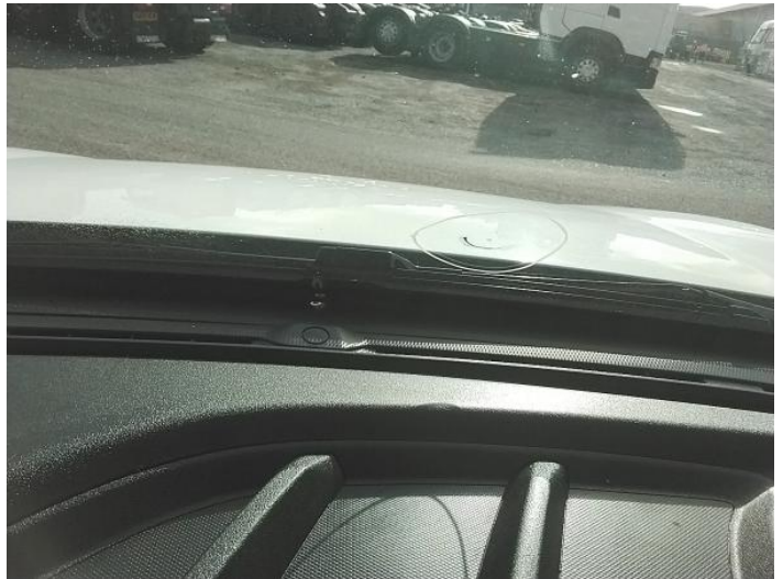
6: Screen Front Cracked Replace