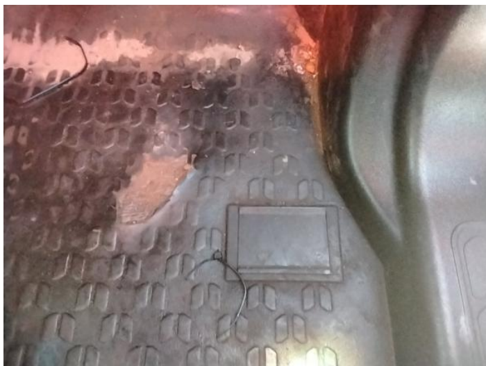
1: Carpets Front Holed Over 3mm