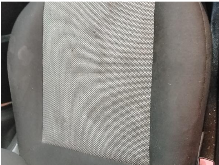
3: Seat Base Cover nsf Soiled Heavy