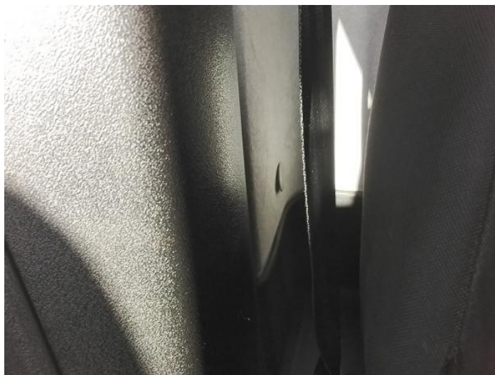
2: Seat Back Cover osf Torn Over 3mm