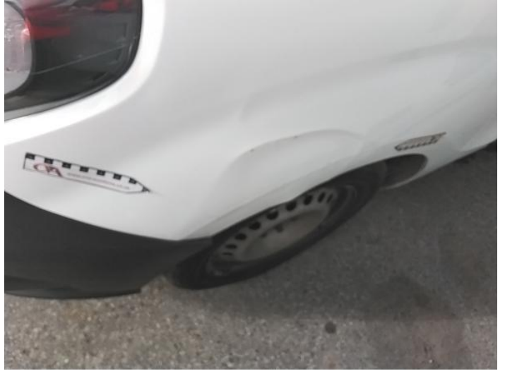
4: Wing nsf Dented With Paint Damage