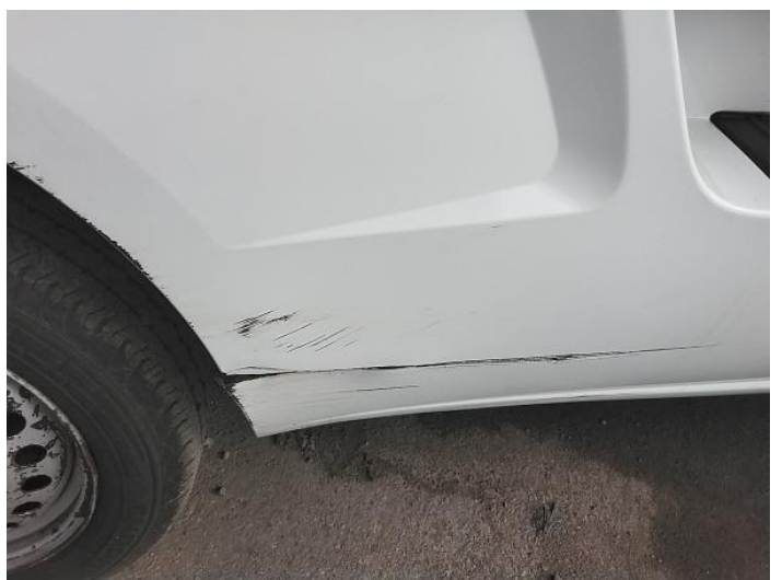
8: Qtr Panel osr Cracked Replace