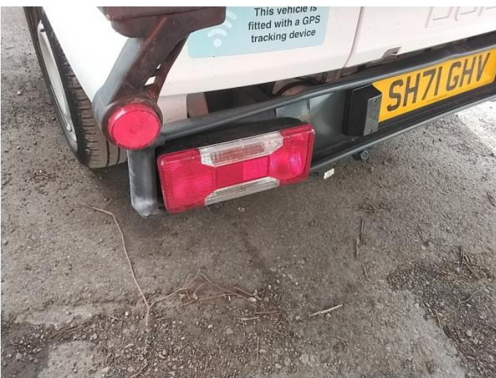
7: Bumper Rear Dented Over 30% Of Panel