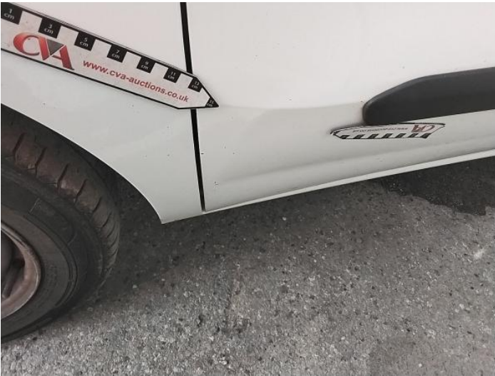
5: Door nsf Dented Over 30mm