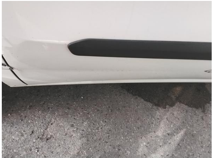
6: Door nsf Dented With Paint Damage