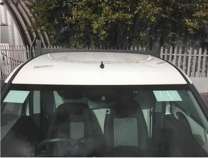
3: Roof Dented Over 30mm