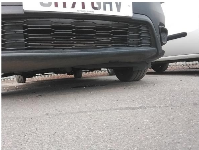
1: Bumper Front Moulding Broken Replace