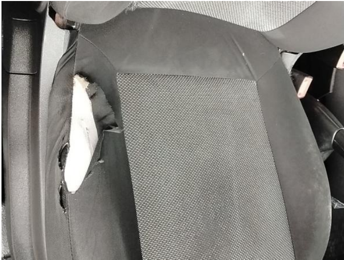
10: Seat Base Cover osf Torn Over 3mm