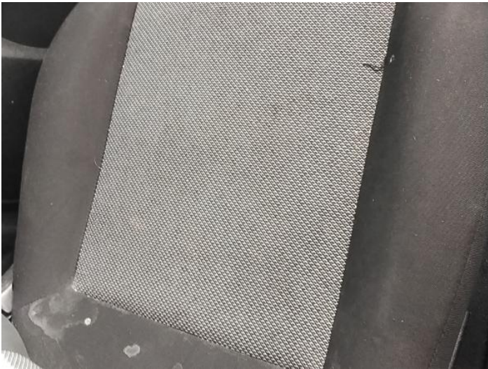
11: Seat Base Cover nsf Soiled Heavy