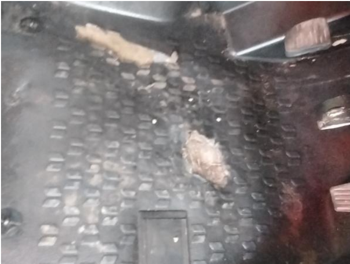
9: Carpets Front Holed Over 3mm