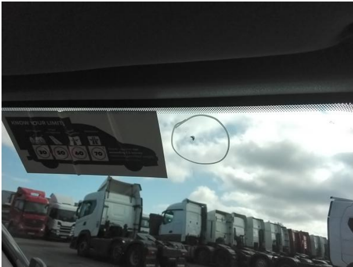
12: Screen Front Chipped Over 10mm