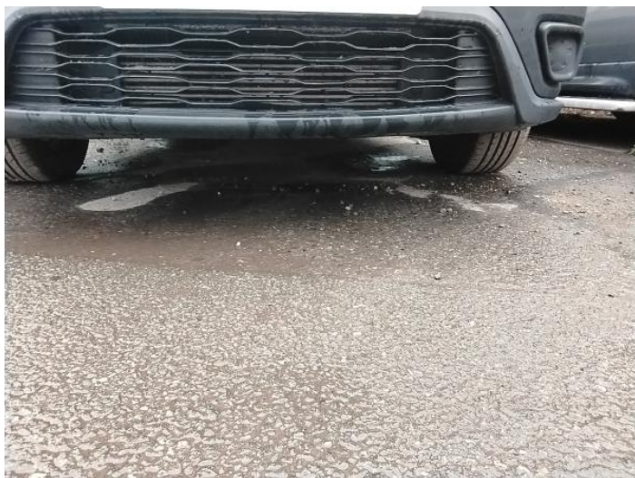
1: Bumper Front Moulding Missing Replace