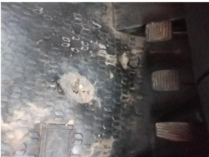
4: Carpets Front Holed Over 3mm