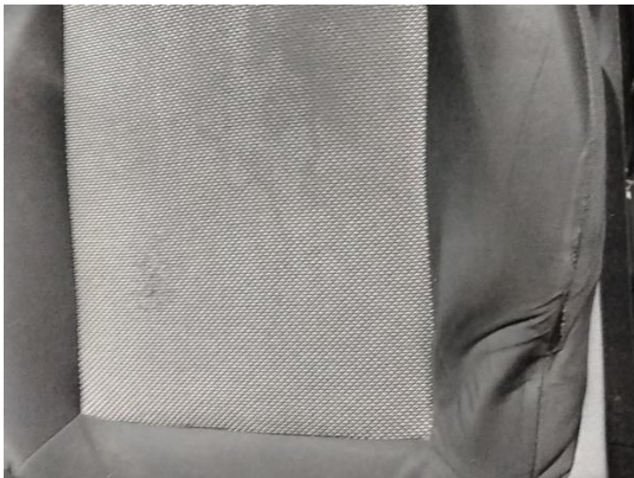
5: Seat Base Cover osf Soiled Heavy