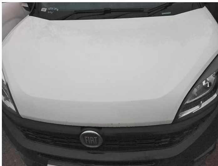
2: Bonnet Chipped Multiple Chips