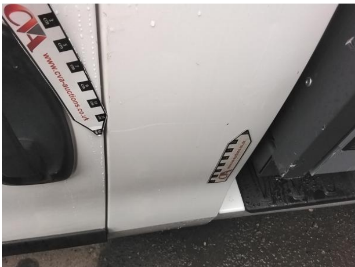
3: B Post ns Scratched Over 25mm Not Thru Paint