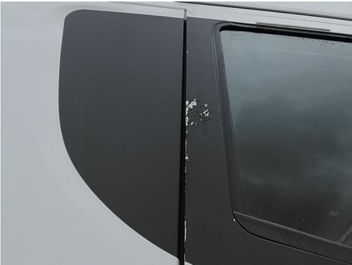
6: Other N/A N/A