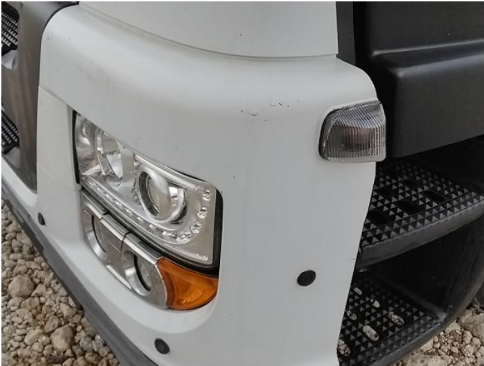
3: Fog Lamp Surround ns Scratched (Painted) UpTo 25mm Thru Paint