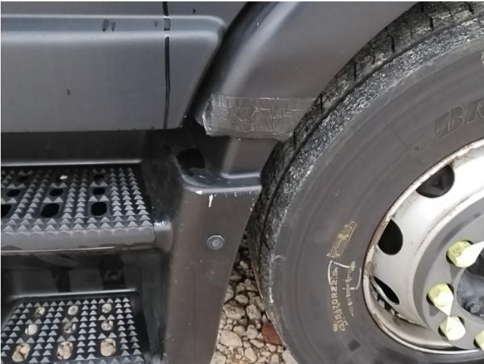
4: Other N/A N/A