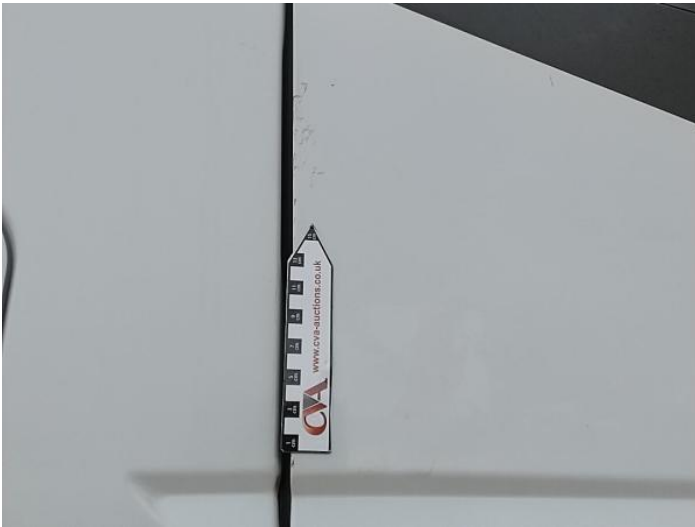
5: Door osf Scratched UpTo 25mm Thru Paint