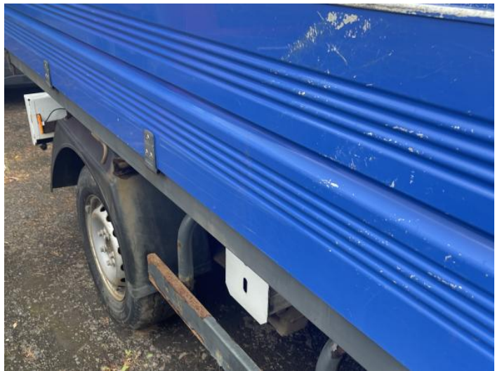
6: Qtr Panel osr Dented With Paint Damage