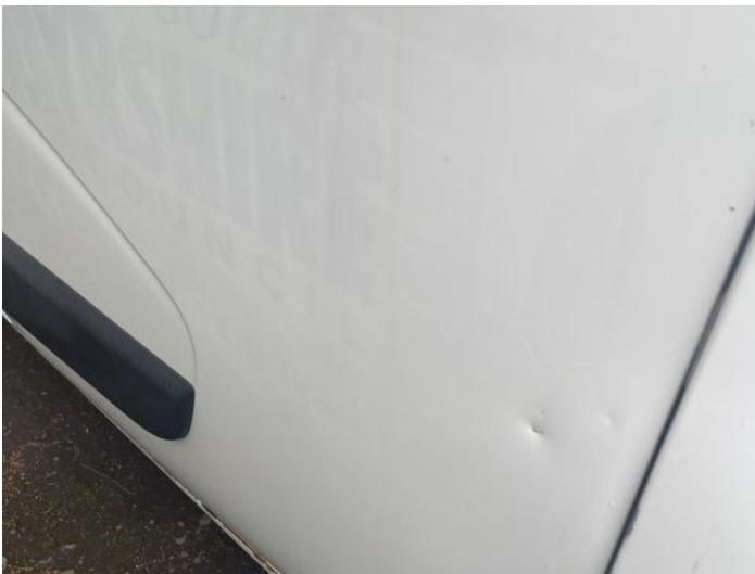
5: Door osf Dented With Paint Damage