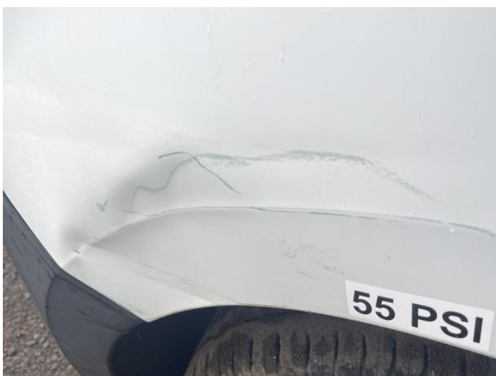
11: Wing nsf Dented With Paint Damage