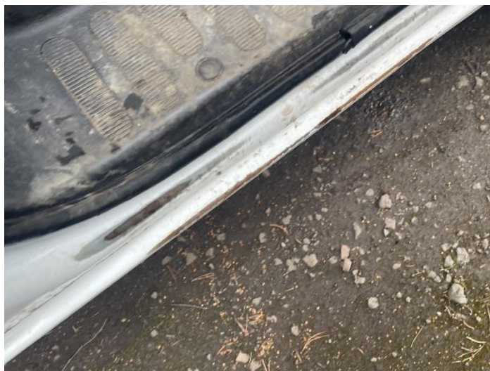
2: Sill os Rusted Over 5mm