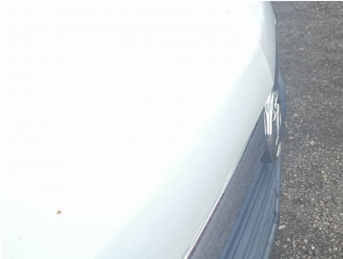
3: Bonnet Dented With Paint Damage