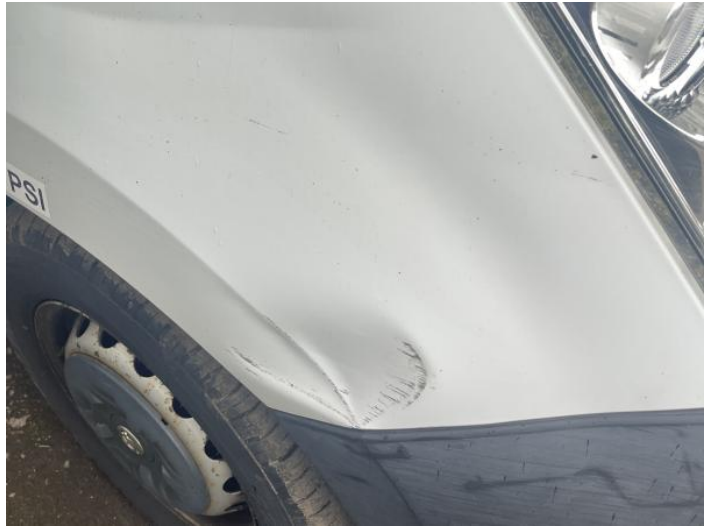
4: Wing osf Dented With Paint Damage