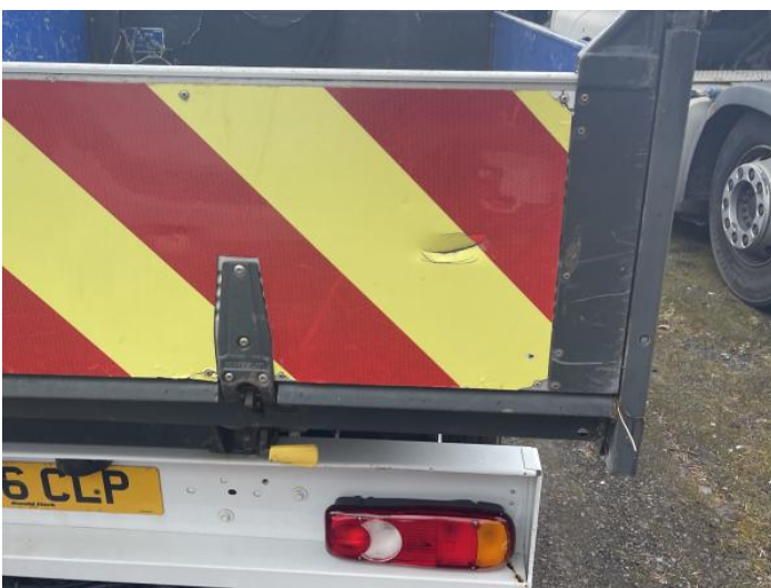
7: Tailgate Dented With Paint Damage