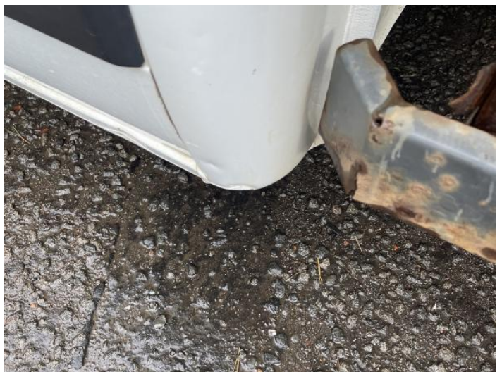
8: D Post ns Dented Over 30mm