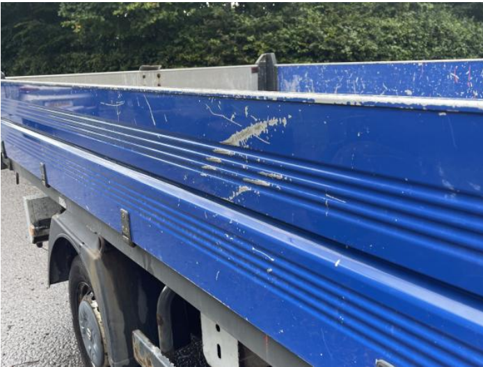
5: Qtr Panel osr Dented With Paint Damage