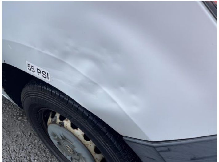
4: Wing osf Dented With Paint Damage