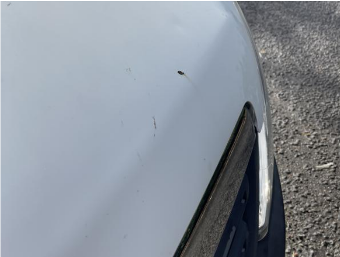
3: Bonnet Dented With Paint Damage