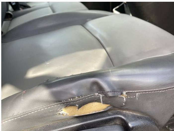
1: Seat Base Cover osf Torn Over 3mm