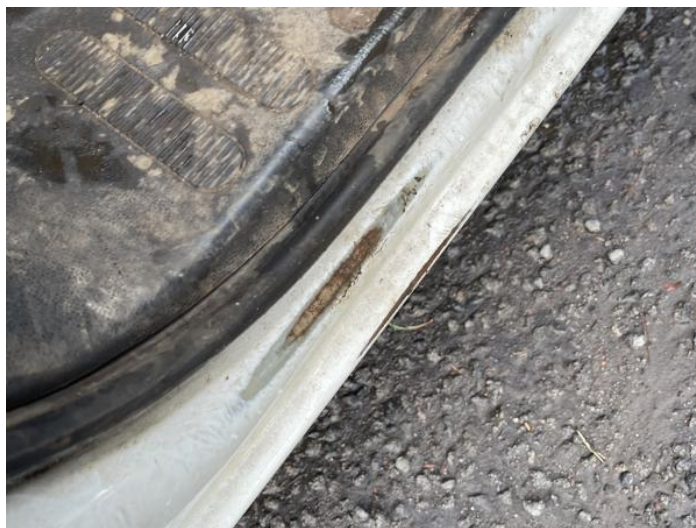
2: Sill os Dented Over 30mm