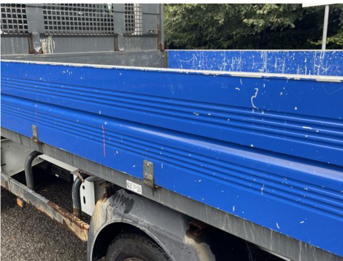
7: Qtr Panel nsr Dented With Paint Damage