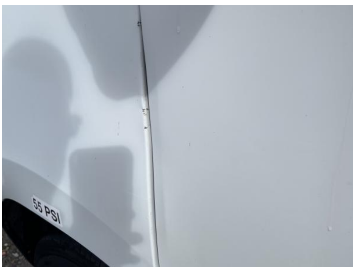
11: Door nsf Dented With Paint Damage