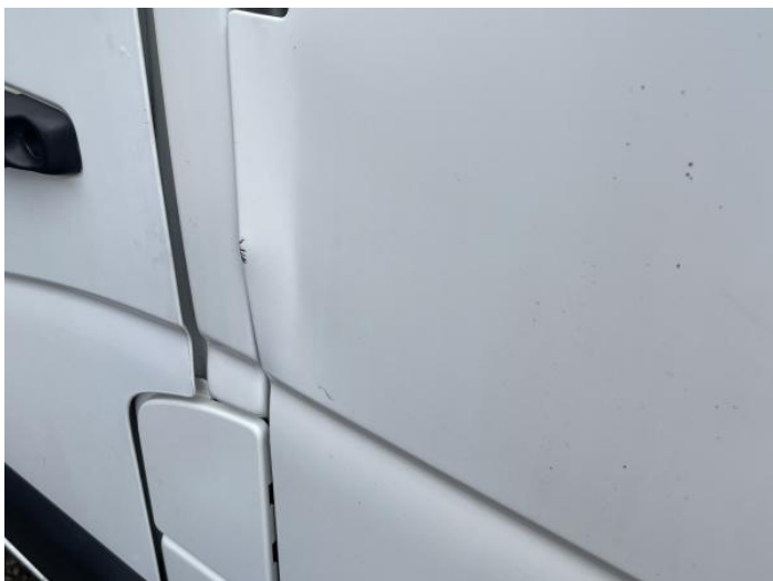
9: Door nsr Dented With Paint Damage