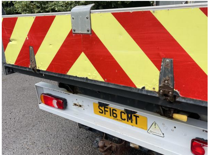
6: Tailgate Dented With Paint Damage