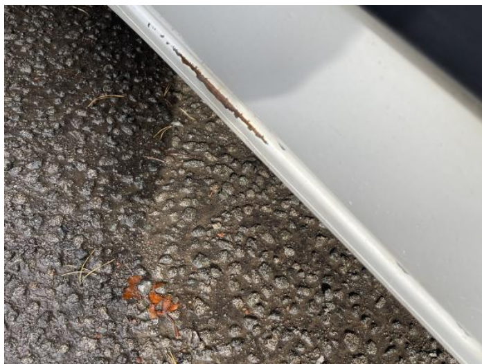
10: Sill ns Rusted Over 5mm