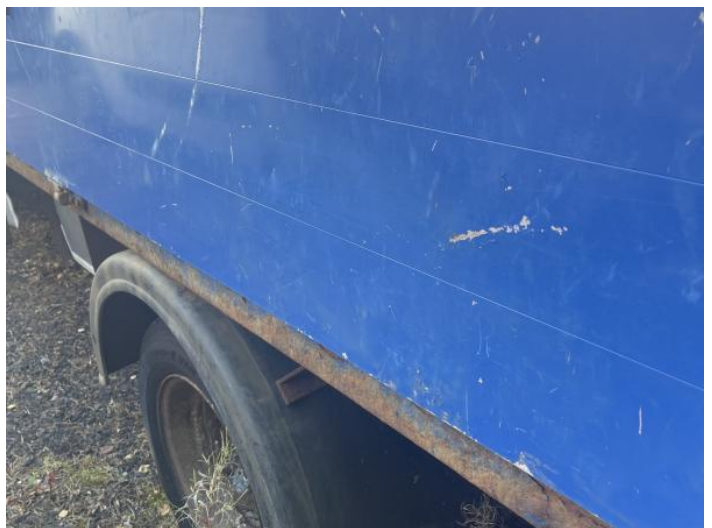
8: Qtr Panel nsr Dented With Paint Damage