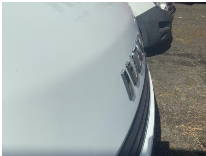
2: Bonnet Dented Over 30mm