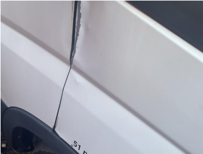
3: Wing osf Dented Over 30mm