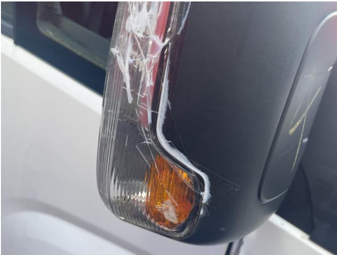
5: Door Mirror Assy osf Broken Replace