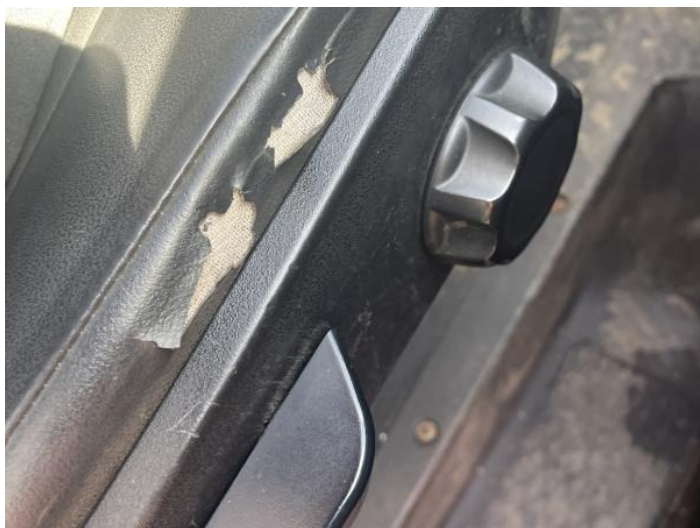
1: Seat Base Cover osf Torn Over 3mm