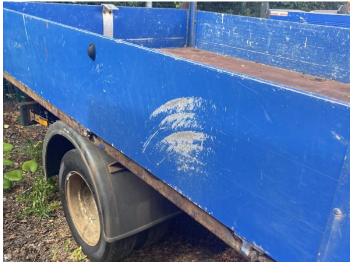
6: Qtr Panel osr Dented Over 30mm