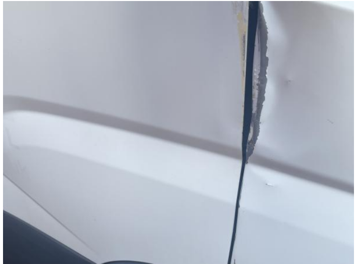
4: Door osf Dented With Paint Damage