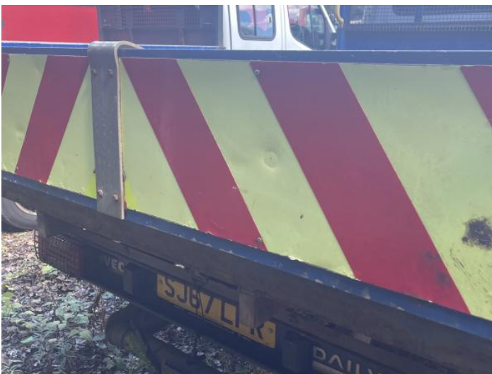
7: Tailgate Dented With Paint Damage