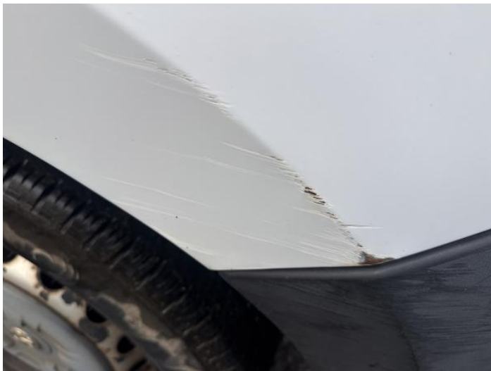
3: Wing osf Scratched Over 25mm Thru Paint