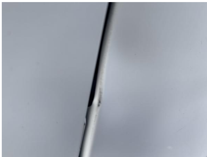
2: Wing osf Dented With Paint Damage