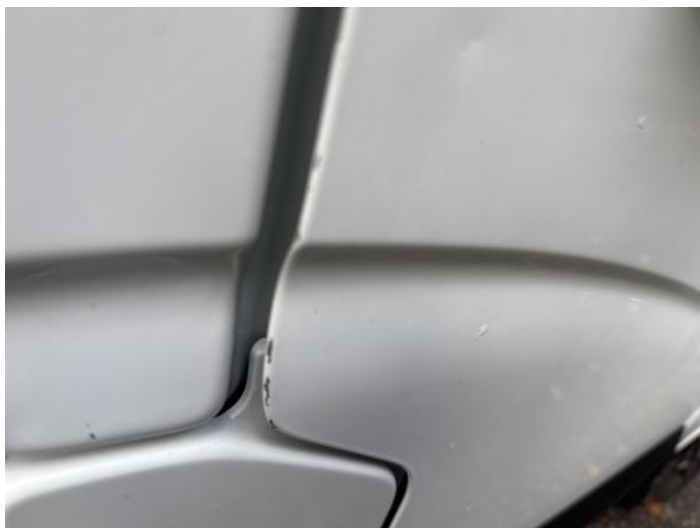
1: Door osf Chipped Edge Chip