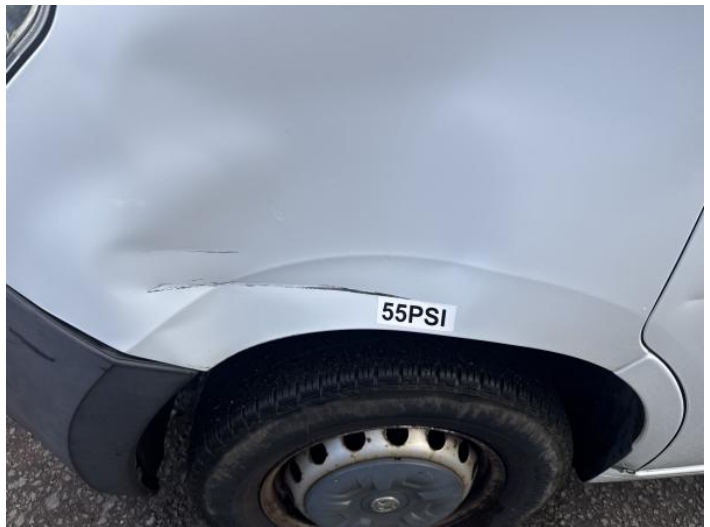
4: Wing nsf Dented With Paint Damage