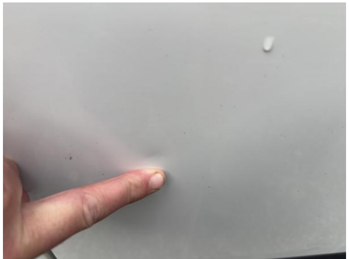
6: Door osr Dented Between 10mm + 30mm