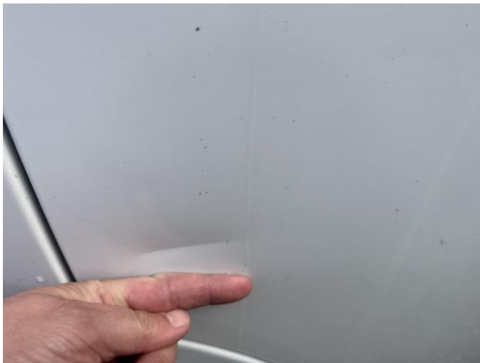
5: Door nsf Dented With Paint Damage