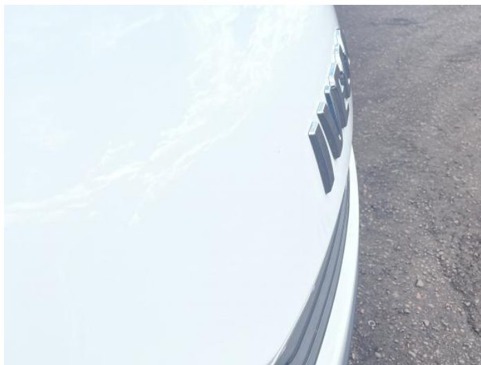
2: Bonnet Dented Over 30mm