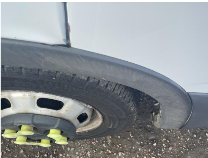
7: Door nsf Dented With Paint Damage