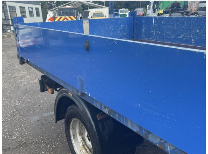
4: Qtr Panel osr Dented With Paint Damage