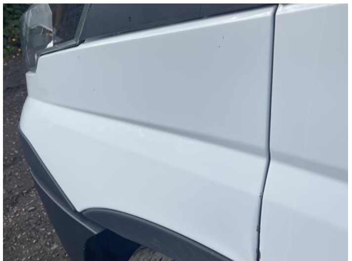
8: Wing nsf Dented With Paint Damage