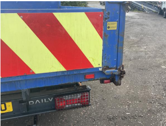
5: Tailgate Rusted Over 5mm