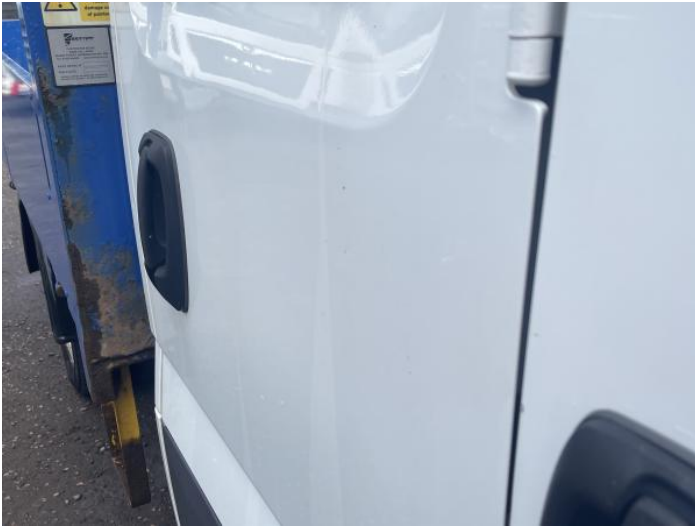
3: Door nsr Dented Over 30mm