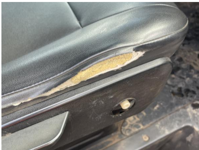
1: Seat Base Cover osf Torn Over 3mm