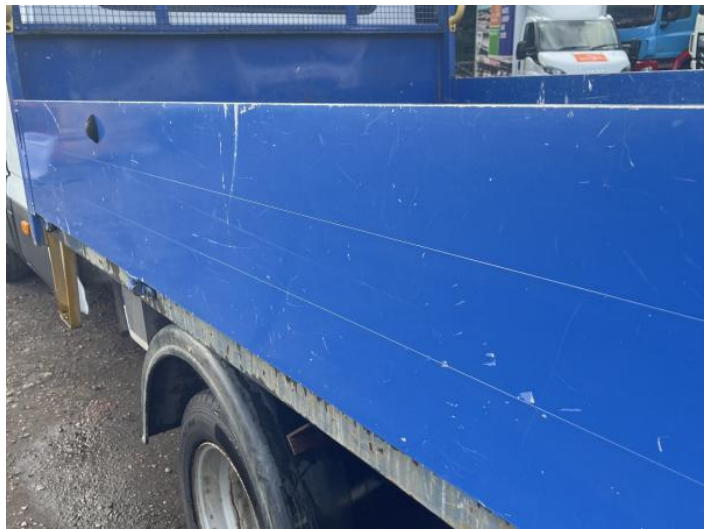
6: Qtr Panel nsr Dented Over 30mm