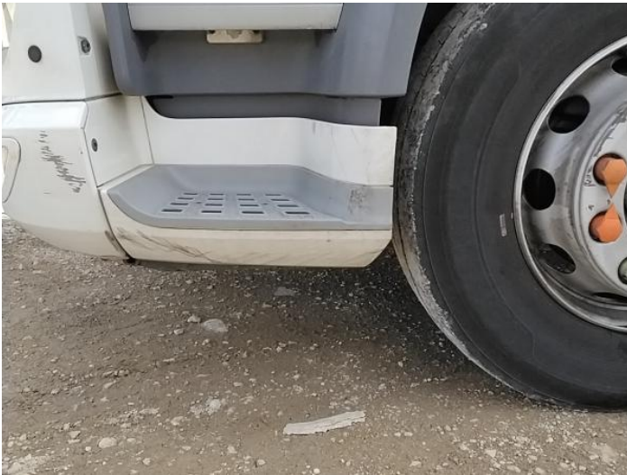
5: Other N/A N/A