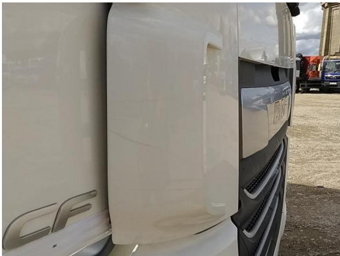
1: Wing osf Scratched Over 25mm Not Thru Paint