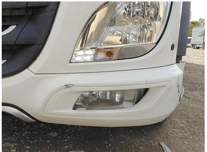
2: Bumper Front Moulding Scratched (Painted) UpTo 25mm Thru Paint