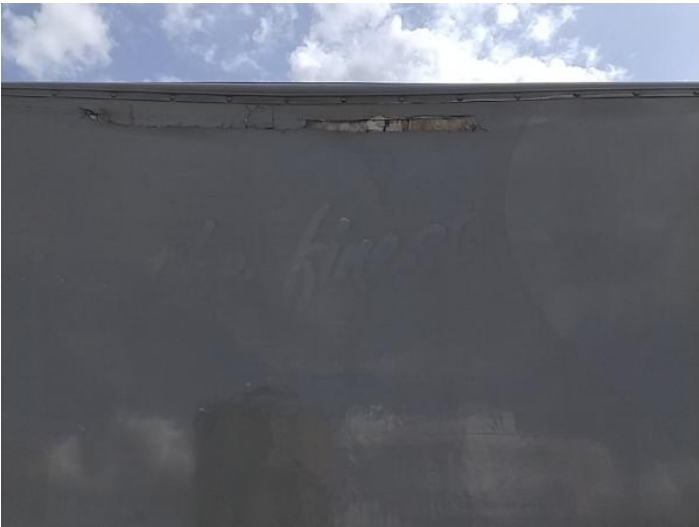
6: Qtr Panel nsr Cracked Replace