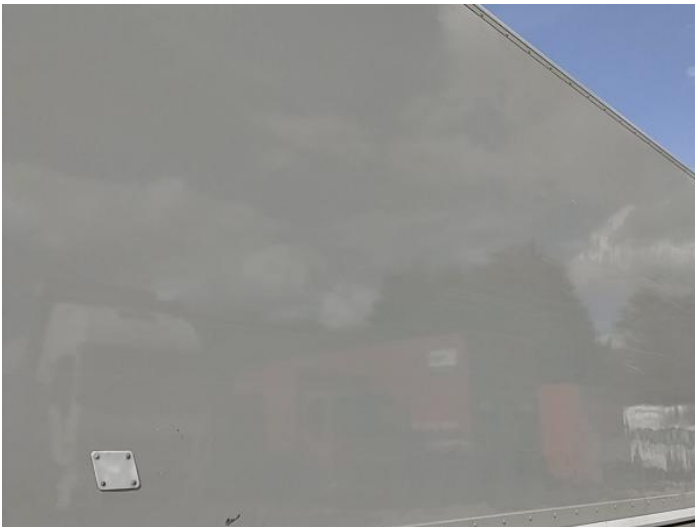
7: Other N/A N/A