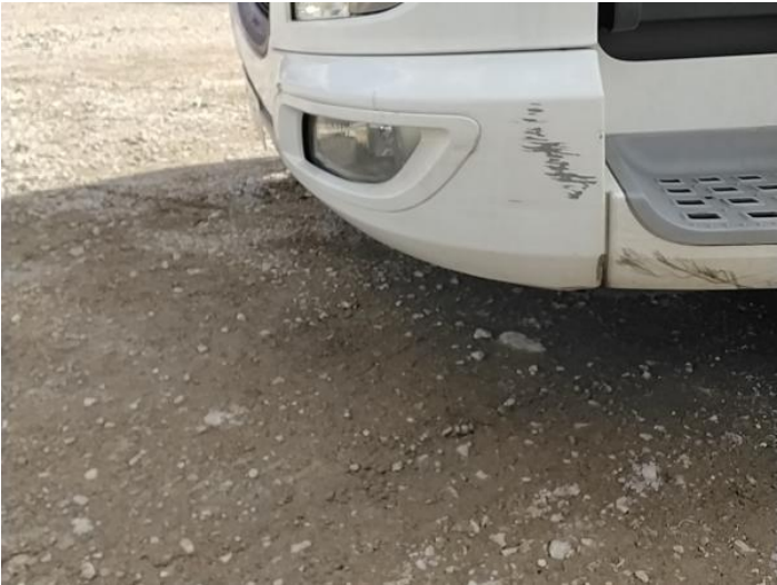
4: Bumper Front Moulding Scratched (Painted) UpTo 25mm Thru Paint