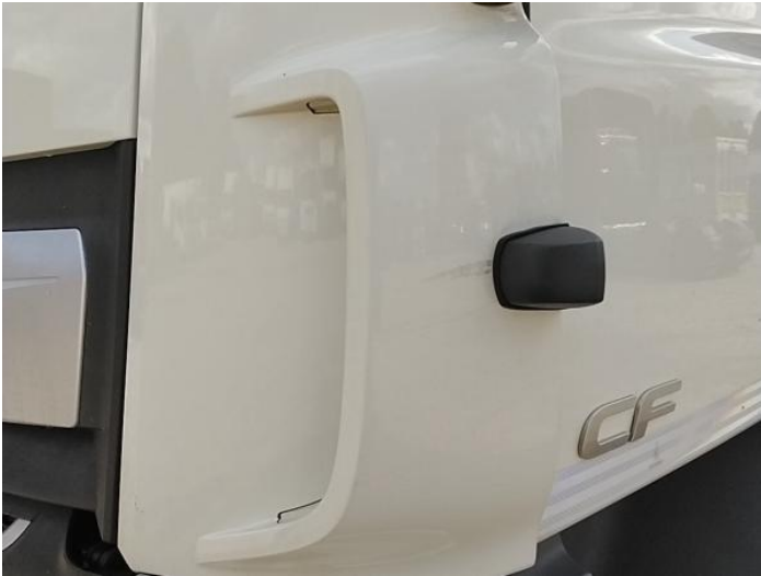
3: Wing nsf Scratched UpTo 25mm Not Thru Paint