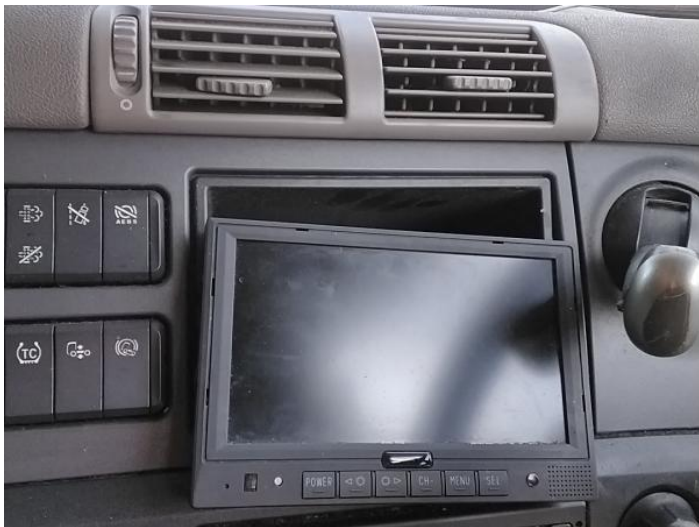
9: Other N/A N/A