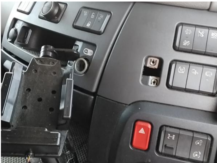
10: Other N/A N/A