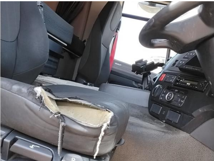
8: Seat Base Cover osf Holed Over 3mm