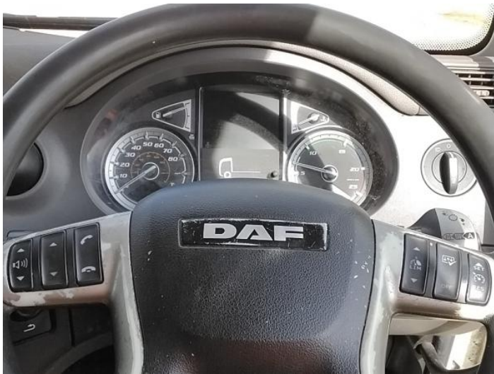
11: Other N/A N/A