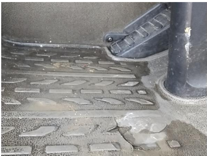
13: Carpets Front Holed Over 3mm