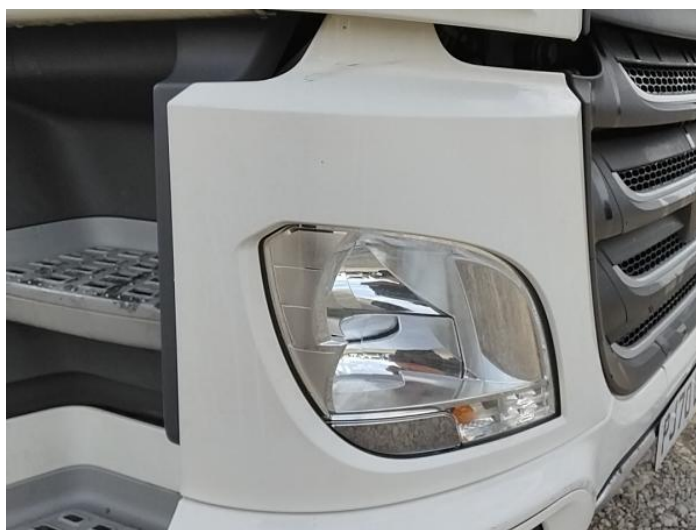
2: Fog Lamp Surround os Scratched (Painted) UpTo 25mm Not Thru Paint