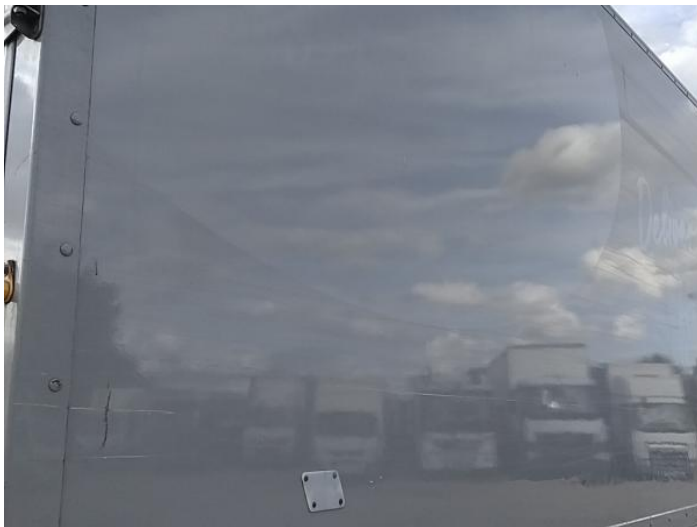
11: Qtr Panel osr Scratched Over 25mm Thru Paint