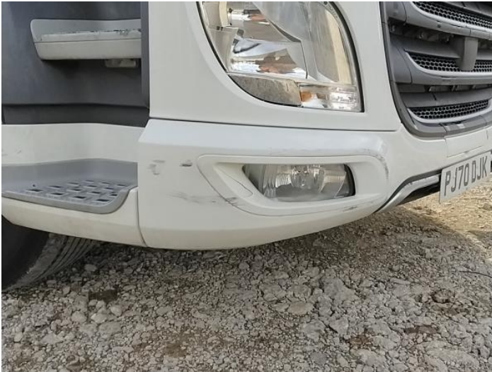
3: Bumper Front Moulding Scratched (Painted) Over 25mm Thru Paint