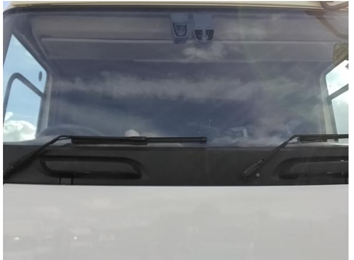
4: Screen Front Chipped Over 10mm