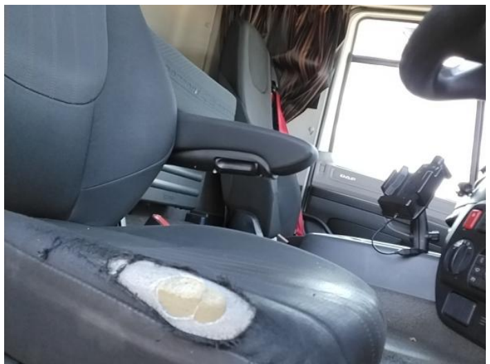
14: Seat Base Cover osf Holed Over 3mm