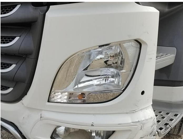
7: Fog Lamp Surrounds Scratched (Painted) UpTo 25mm Not Thru Paint