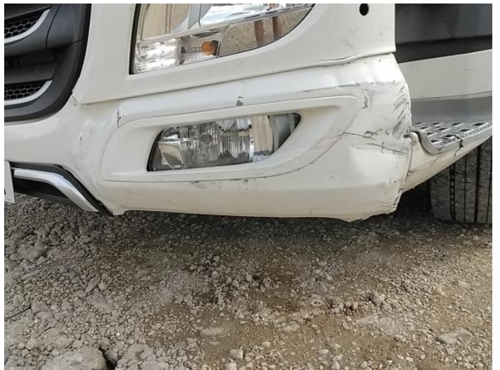
6: Bumper Front Moulding Broken Replace