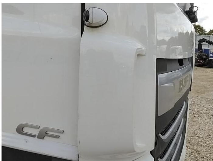
1: Wing osf Scratched UpTo 25mm Not Thru Paint