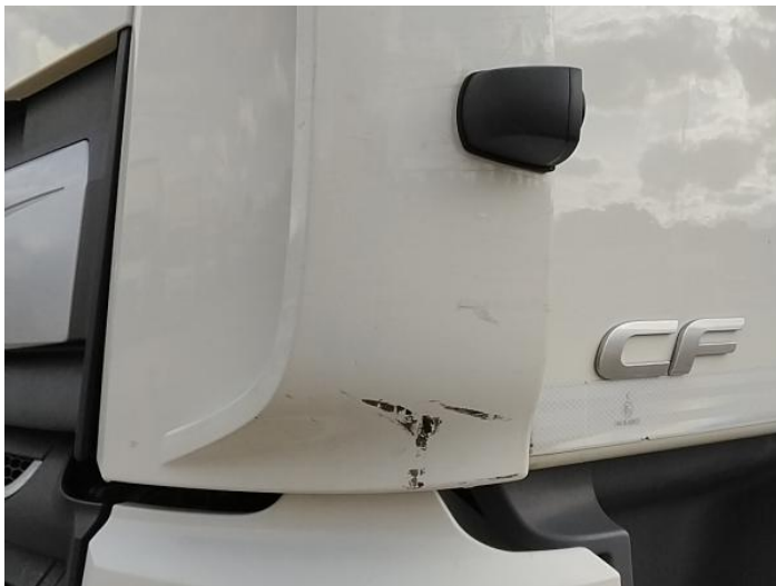
9: Wing nsf Scratched UpTo 25mm Not Thru Paint