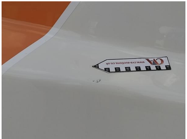
12: Door osf Dented Over 2 UpTo 10mm