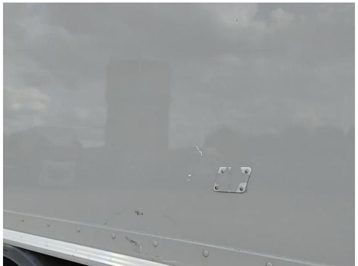
10: Qtr Panel nsr Scratched Over 25mm Thru Paint