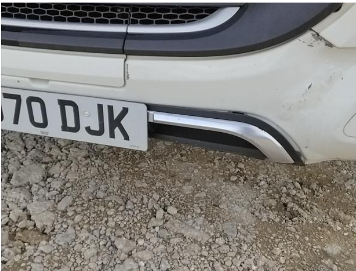
5: Grille Front Broken Replace