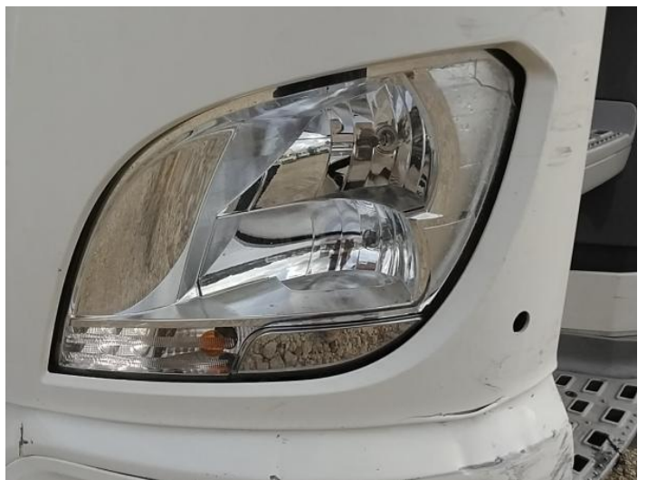
8: Headlamp Broken Replace