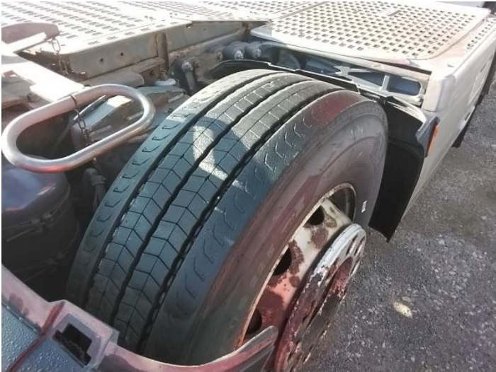
3: Qtr Panel Moulding os Missing Replace