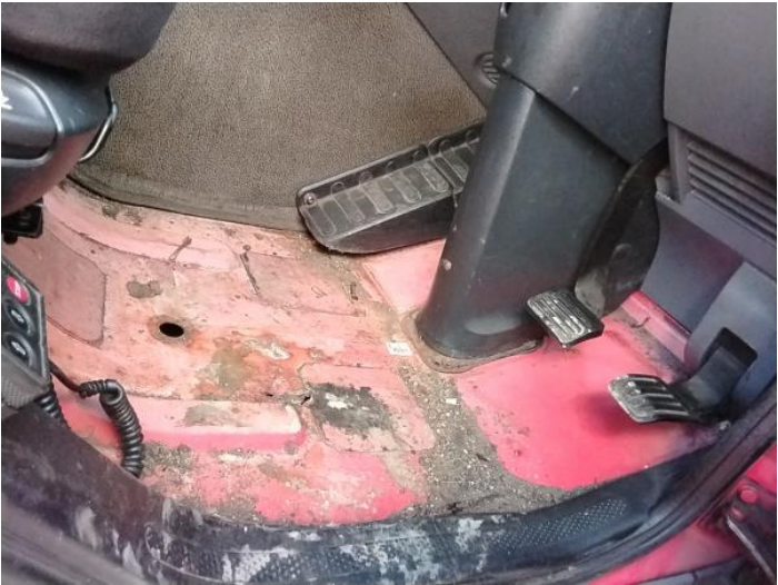
4: Carpets Front Missing Replace