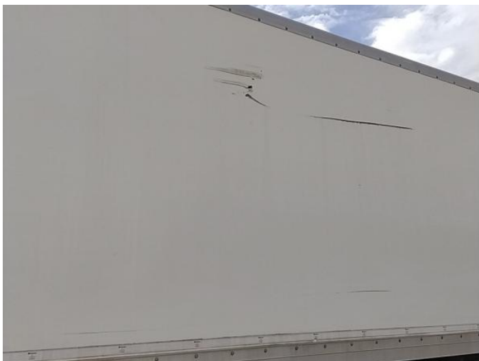
9: Qtr Panel osr Scratched Over 25mm Not Thru Paint