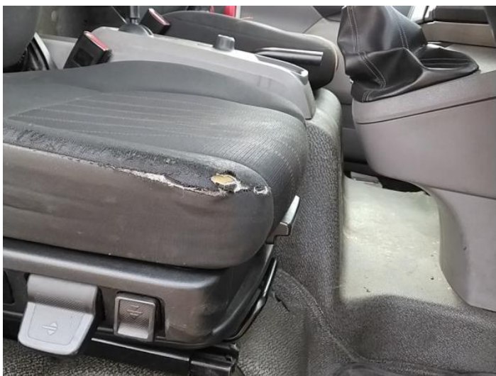
11: Seat Base Cover osf Holed Over 3mm