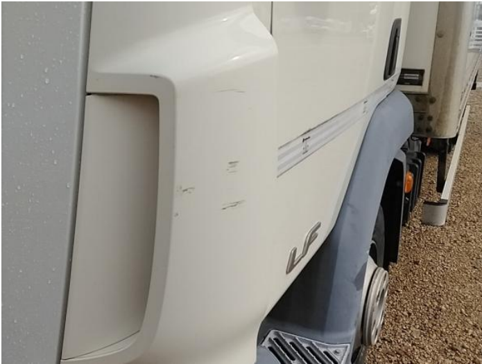
3: Wing nsf Scratched Over 25mm Thru Paint