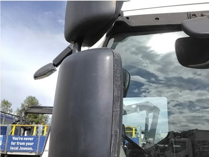
4: Door Mirror Assy nsf Scuffed (Unpainted) UpTo 100mm