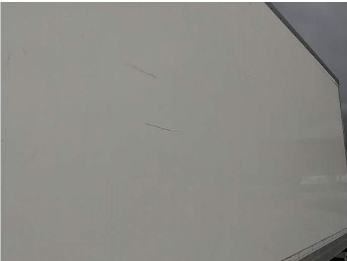
8: Qtr Panel nsr Scratched Over 25mm Not Thru Paint