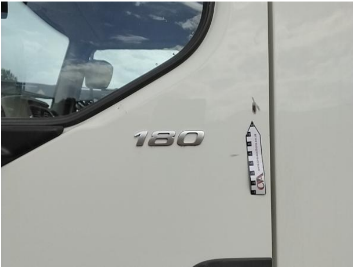
5: Door nsf Scratched UpTo 25mm Thru Paint