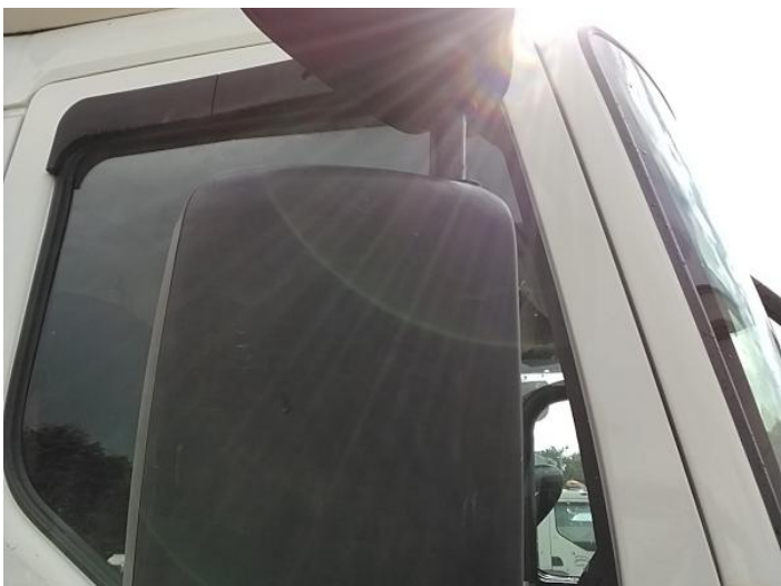
10: Door Mirror Assy osf Scuffed (Unpainted) UpTo 100mm