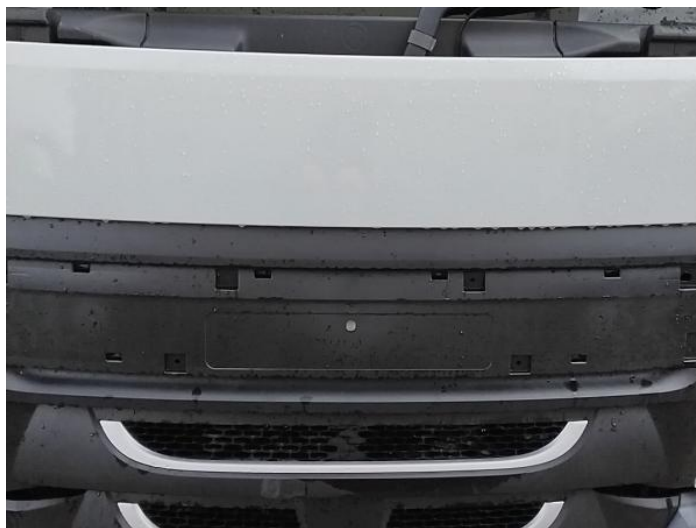
2: Badgedecal Front Missing Replace