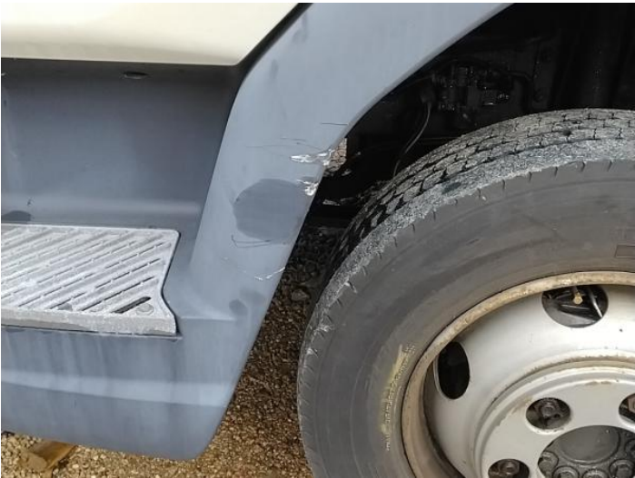
6: Other N/A N/A