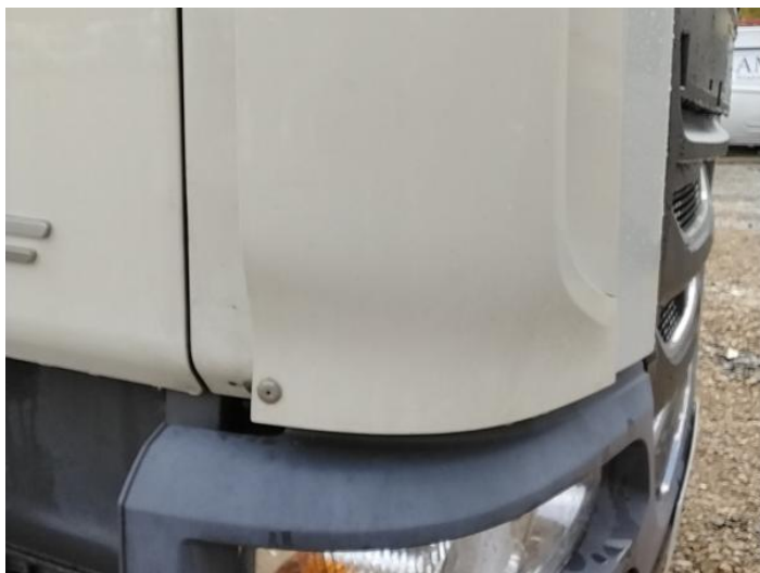
1: Wing osf Poor Previous Repair Poor Colour