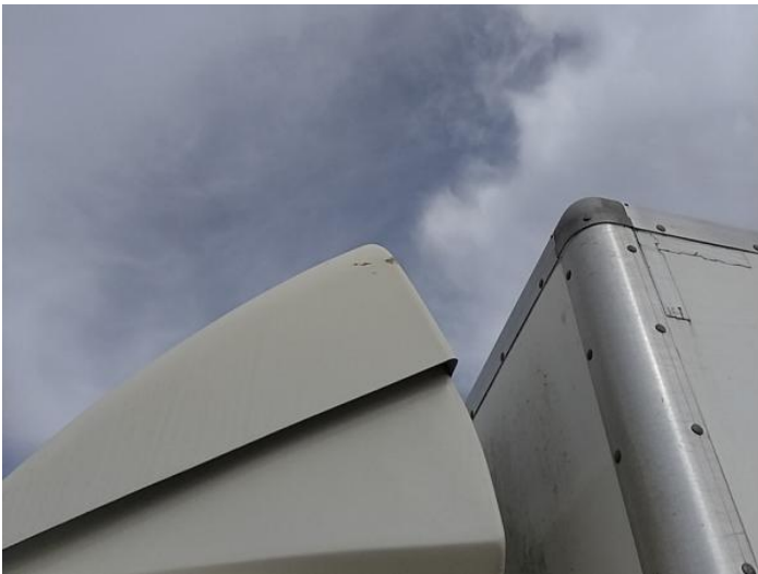
7: Other N/A N/A