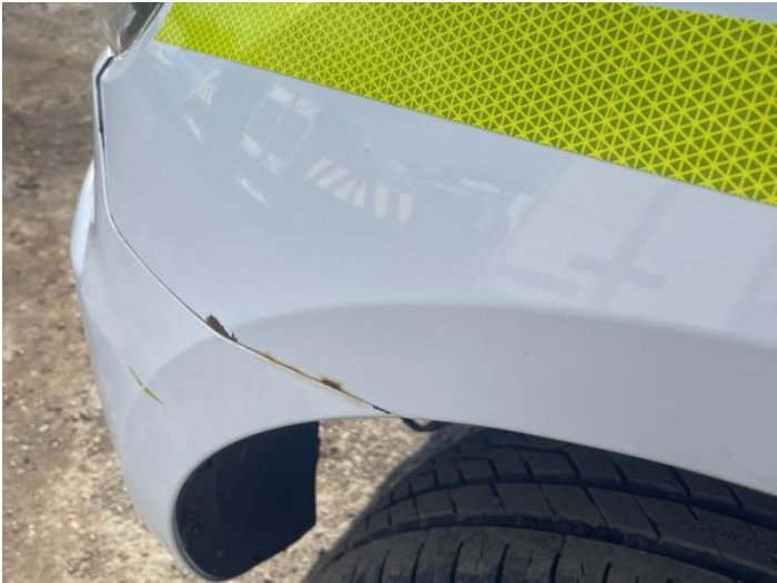
9: Wing nsf Rusted Over 5mm