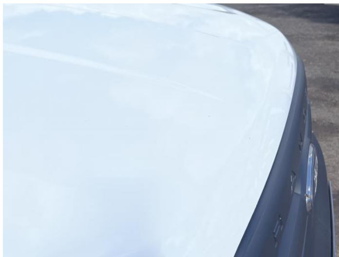
2: Bonnet Dented Over 30mm