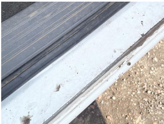
1: Sill os Rusted Over 5mm