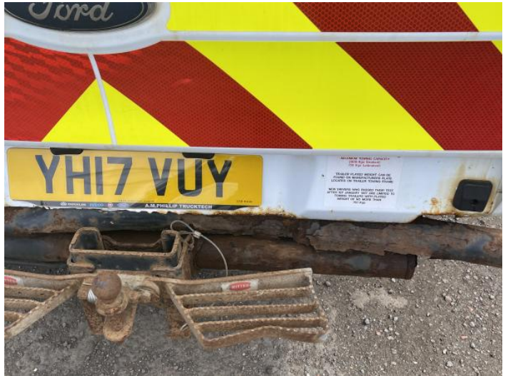
6: Tailgate Dented With Paint Damage