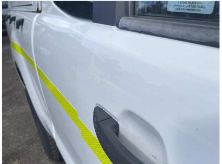
4: Door osf Dented Over 30mm