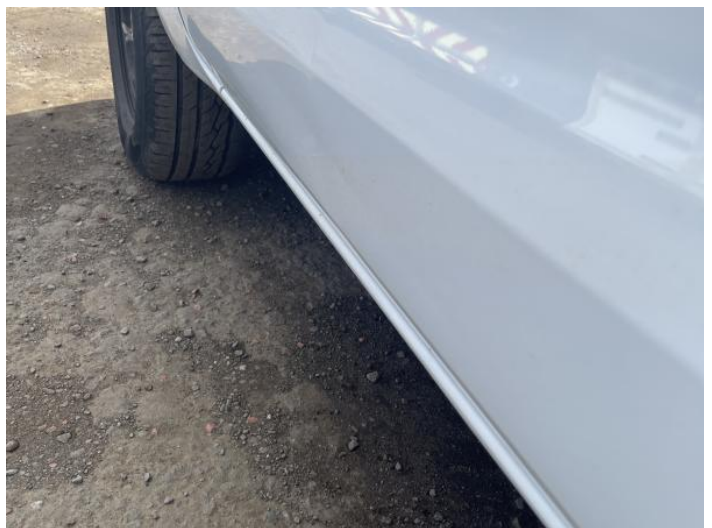
8: Door nsf Dented Over 30mm