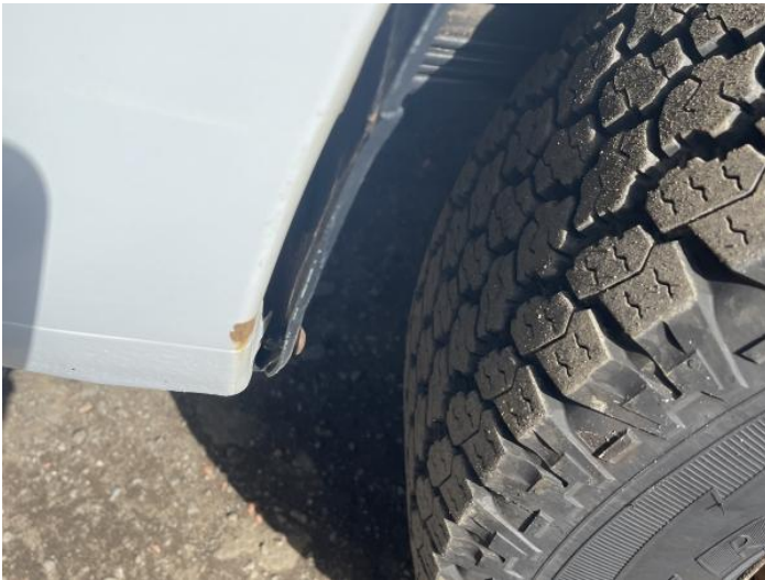
5: Qtr Panel osr Dented Over 30mm