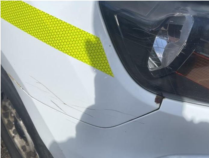
3: Wing osf Rusted Over 5mm