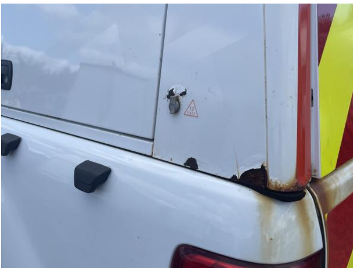
7: Qtr Panel nsr Rusted Over 5mm