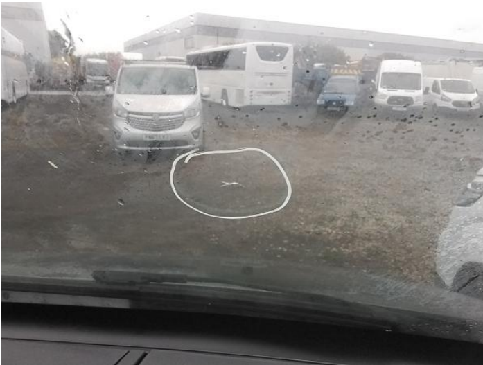
5: Screen Front Cracked Replace