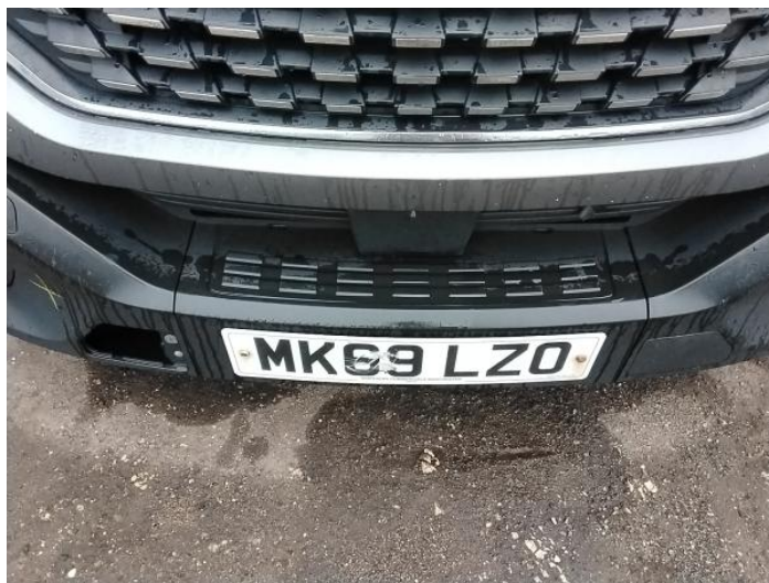
2: Number Plate Front Broken Replace