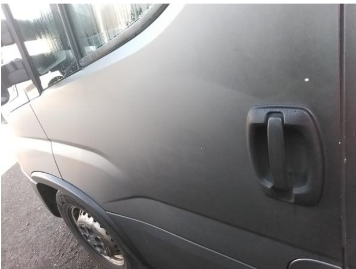
7: Door nsf Chipped Multiple Chips