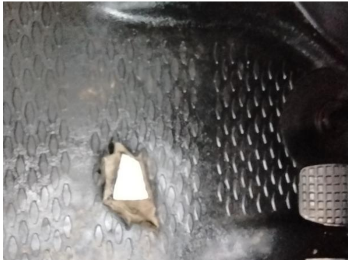
6: Carpets Front Holed Over 3mm