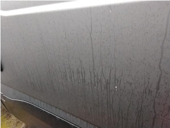
3: Qtr Panel nsr Chipped Multiple Chips