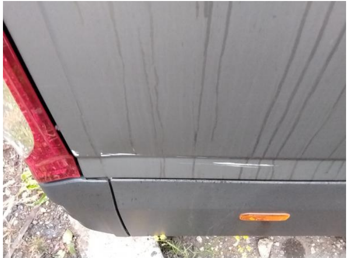
4: Qtr Panel osr Scratched Over 25mm Not Thru Paint