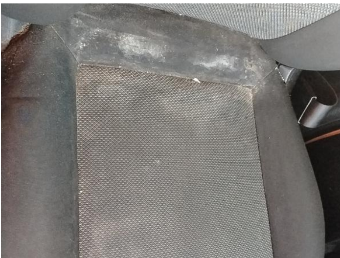
7: Seat Base Cover nsf Soiled Heavy