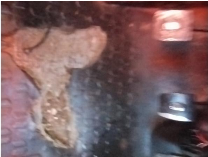
5: Carpets Front Holed Over 3mm