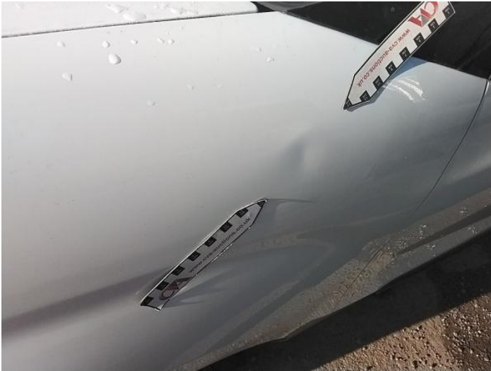
3: Wing nsf Dented Over 30mm