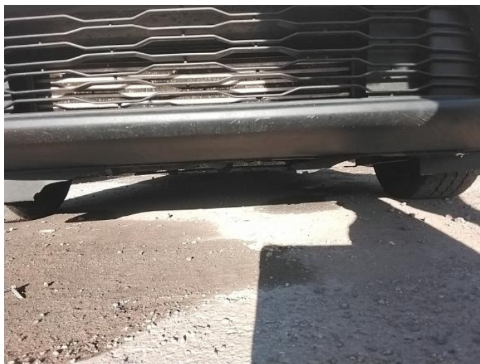
2: Bumper Front Moulding Broken Replace