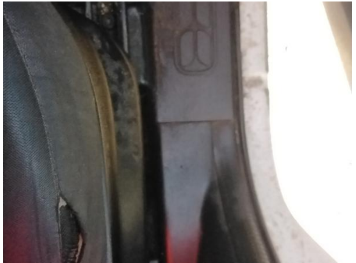
6: Seat Base Cover osf Torn Over 3mm