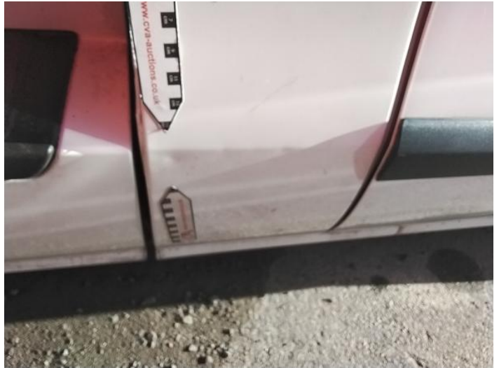
4: B Post os Dented Over 30mm