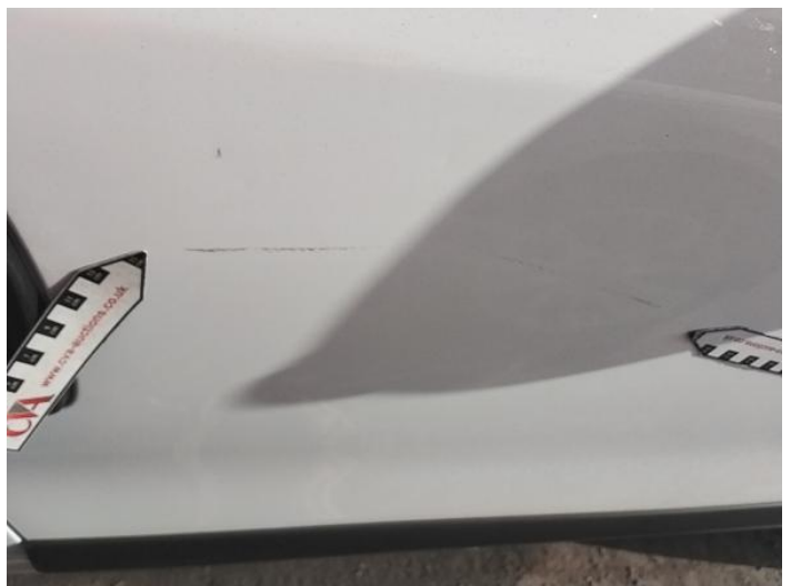
8: Door osf Scratched Over 25mm Thru Paint