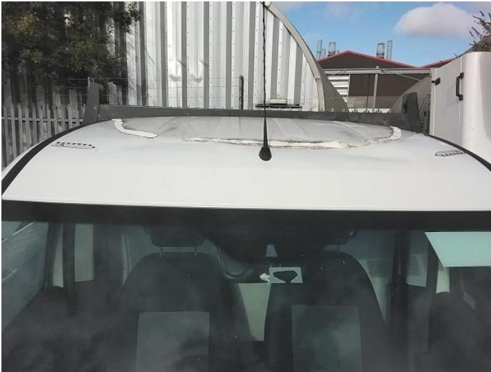
3: Roof Dented Over 30mm