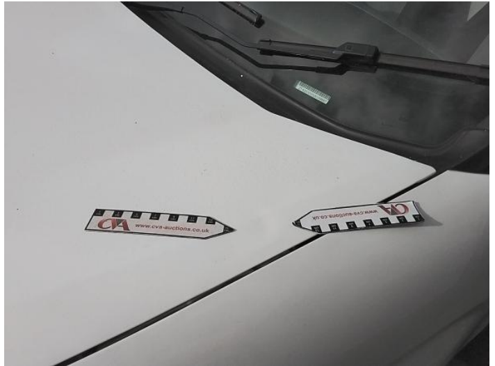
4: Bonnet Dented Over 30mm