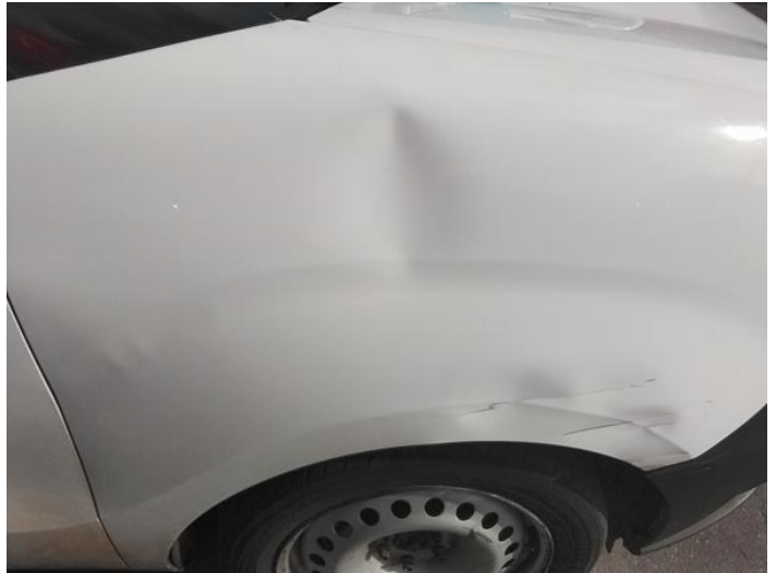
10: Wing osf Dented Over 30% Of Panel