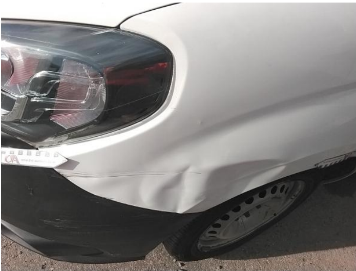
5: Wing nsf Dented With Paint Damage