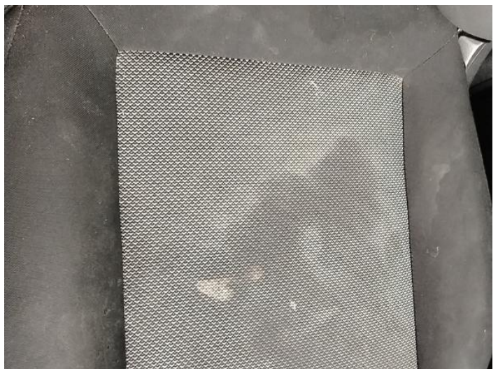
14: Seat Base Cover nsf Soiled Heavy