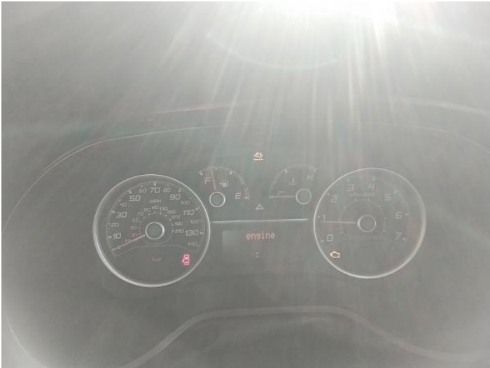
15: Dash Warning Lights Displayed No Action