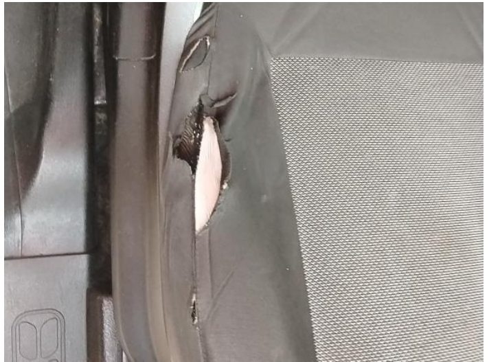
12: Seat Base Cover osf Torn Over 3mm