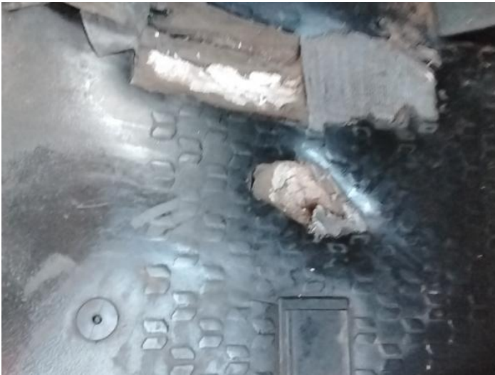
11: Carpets Front Holed Over 3mm