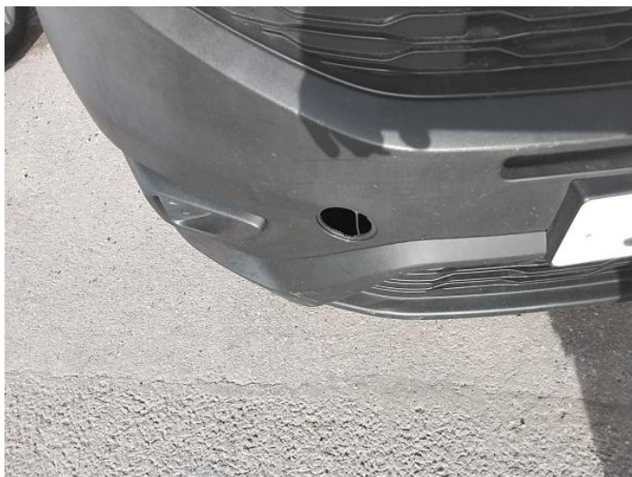
1: Bumper Front Moulding Missing Replace