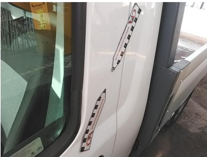
7: Door nsf Dented Over 30mm