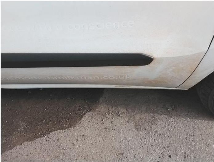
9: Door osf Chipped Multiple Chips