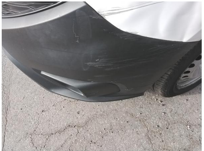
6: Bumper Front Scratched Over 100mm Thru Paint