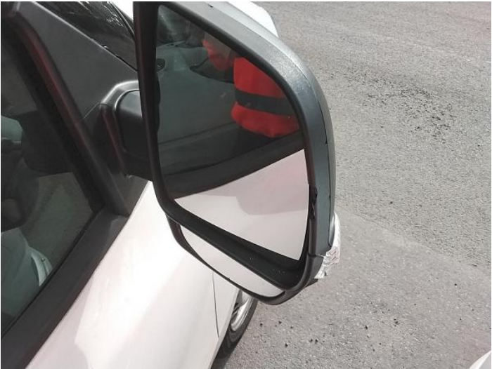
16: Door Mirror Assy osf Broken Replace