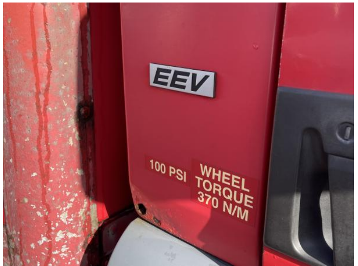
6: B Post os Hole UpTo 10mm