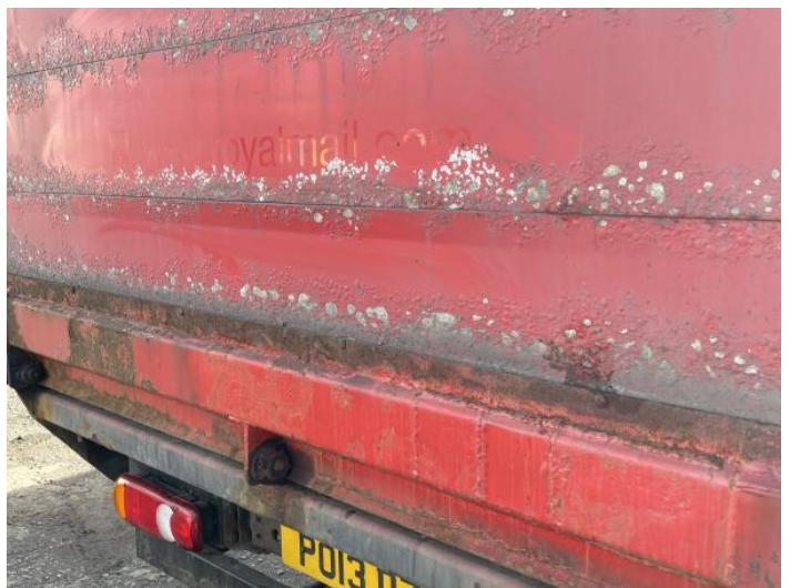
8: Tailgate Rusted Over 5mm