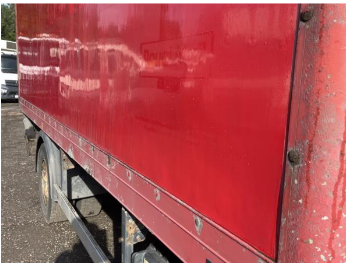
7: Qtr Panel osr Rusted Over 5mm