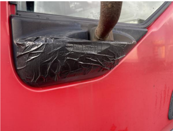
10: Door Mirror Assy nsf Broken Replace