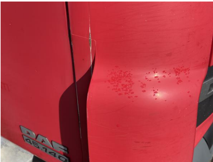
5: Wing osf Dented With Paint Damage