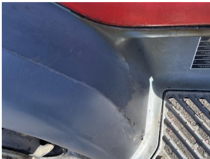
2: Door Moulding osf Scuffed (Unpainted) Over 100mm