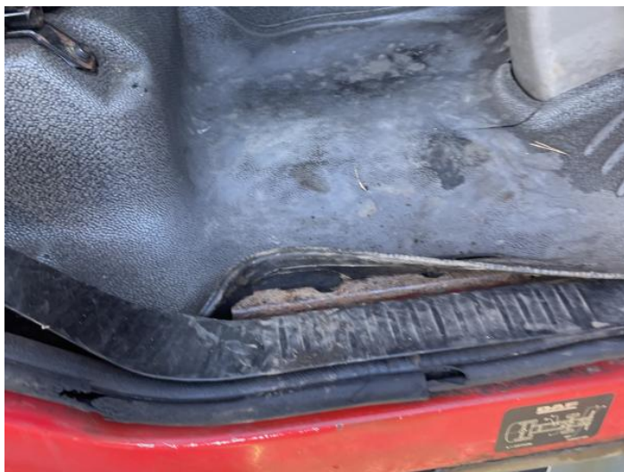
1: Carpets Front Holed Over 3mm