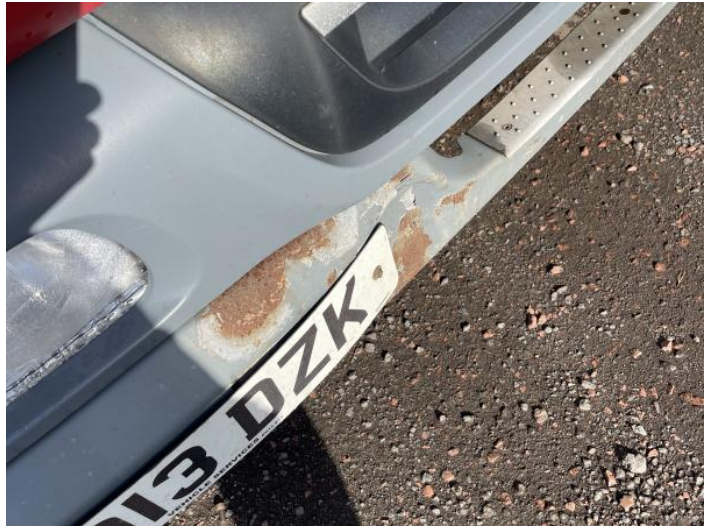
4: Bumper Front Rusted Over 5mm