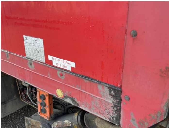
9: Qtr Panel nsr Rusted Over 5mm