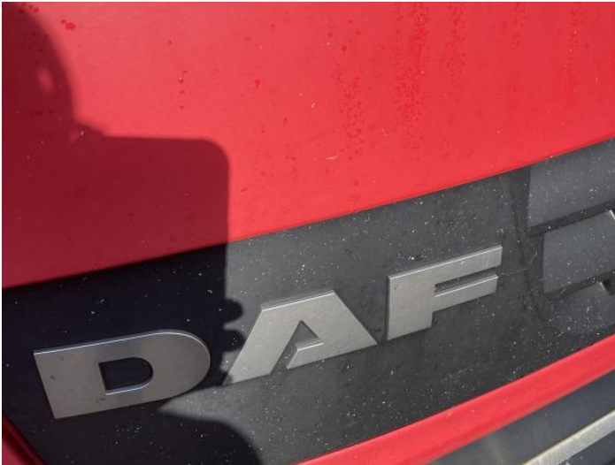
3: Bonnet Chipped Multiple Chips