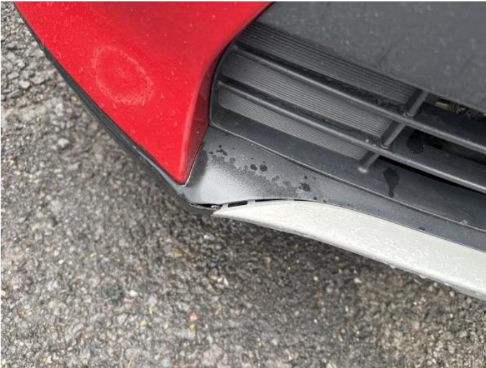
3: Bumper Front Moulding Broken Replace