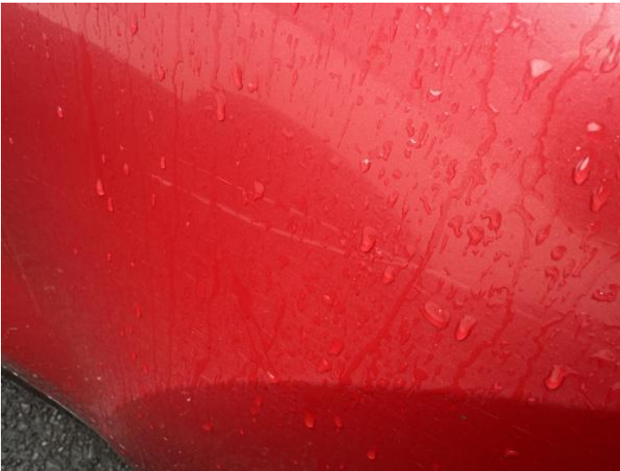
5: Door nsr Scratched Over 25mm Not Thru Paint