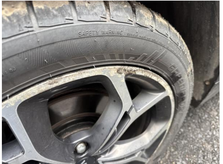
4: Wheel nsf Corroded Light