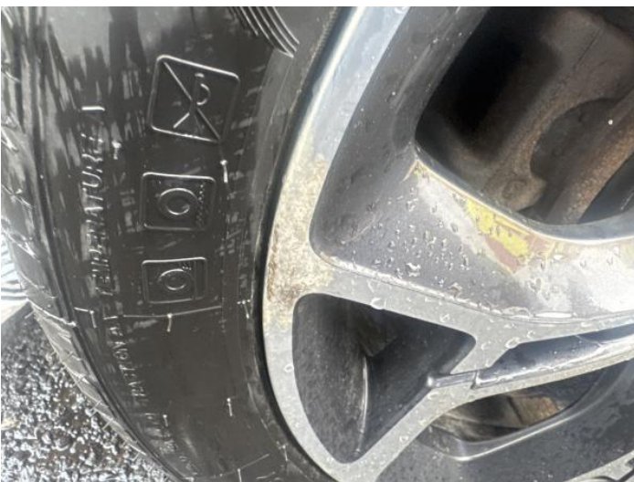
7: Wheel osr Corroded Light