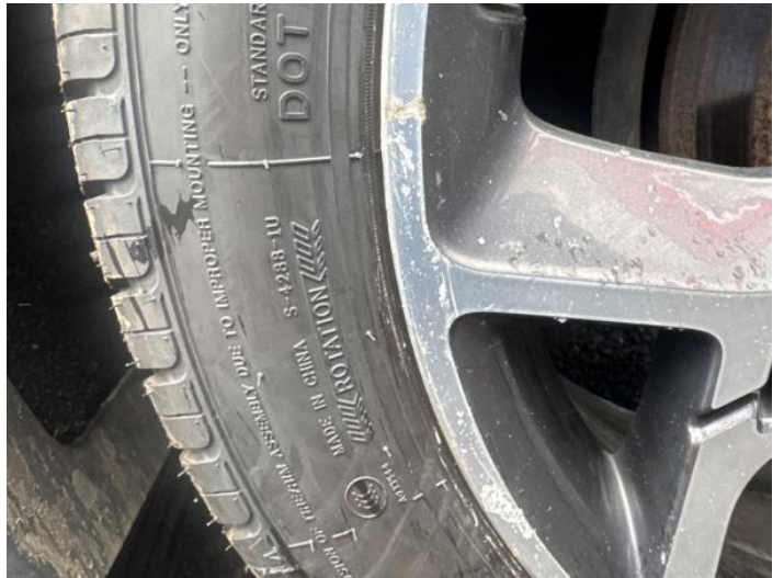
6: Wheel nsr Corroded Light