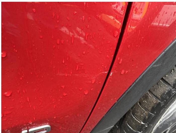
1: Wing of Scratched Over 25mm Thru Paint