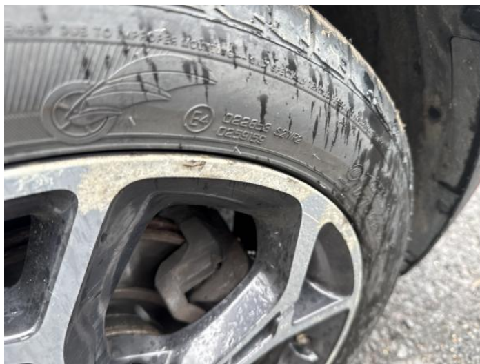
2: Wheel of Corroded Light