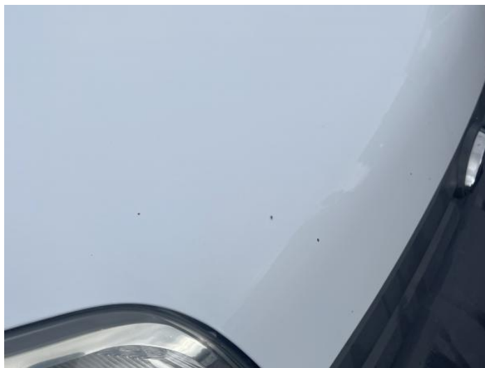
2: Bonnet Chipped 1 To 5