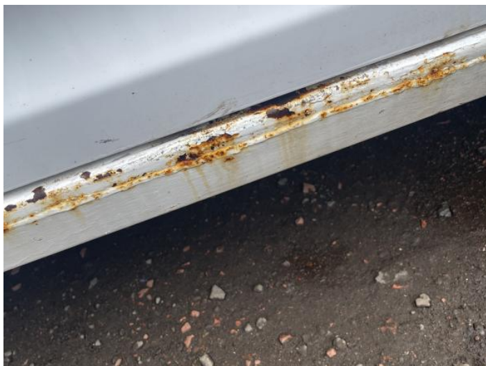
1: Sill os Rusted Over 5mm