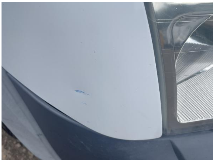
3: Wing osf Dented Over 30mm