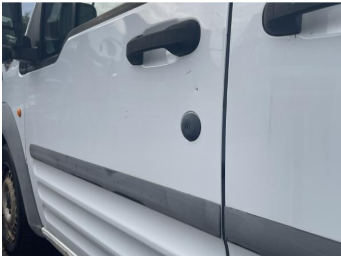
9: Door nsf Dented Over 30mm