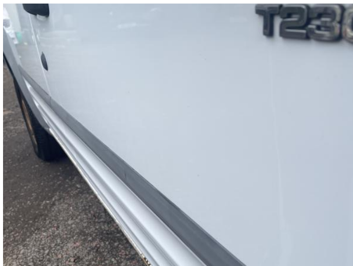
4: Door osf Dented Over 30mm