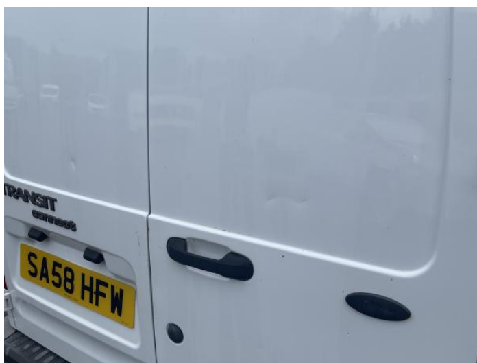
6: Tailgate Dented Over 30mm