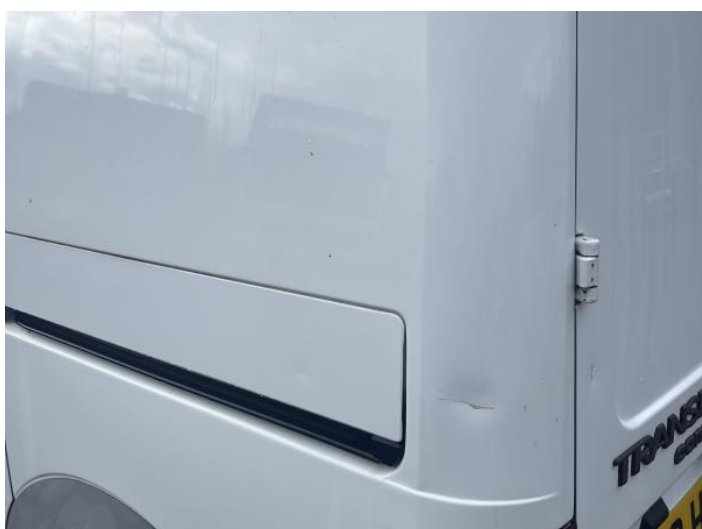
7: Qtr Panel nsr Dented Over 30mm