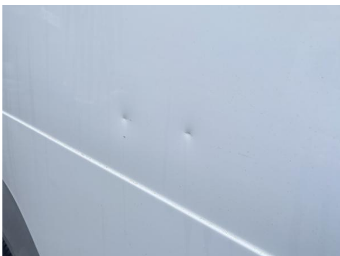
5: Qtr Panel osr Dented Over 30mm