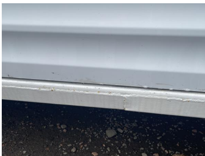
8: Sill ns Rusted Over 5mm