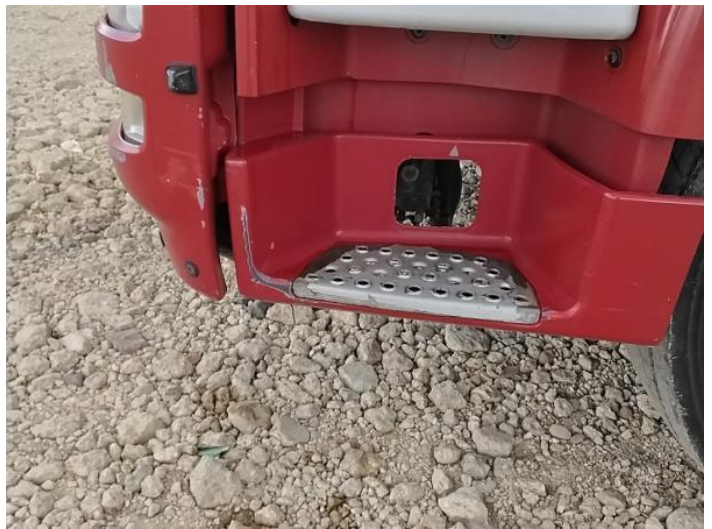
6: Other N/A N/A