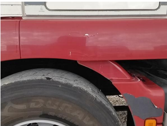
7: Other N/A N/A