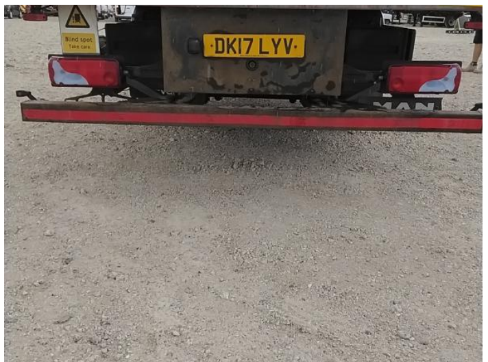
8: Bumper Rear Rusted Over 5mm