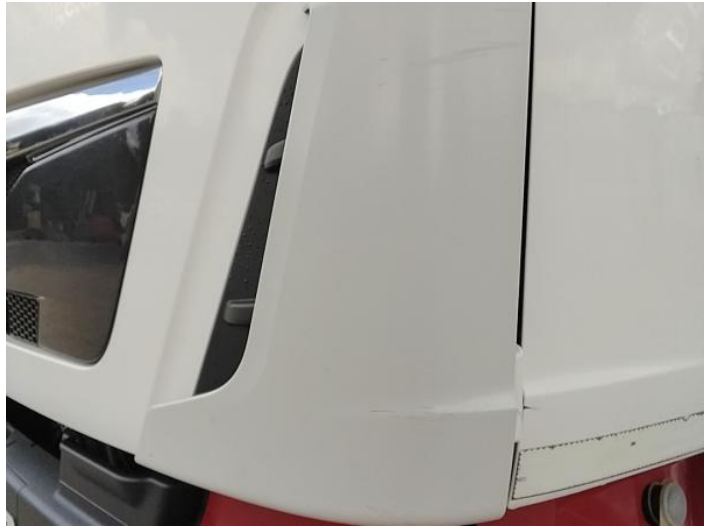
4: Wing nsf Scratched UpTo 25mm Thru Paint