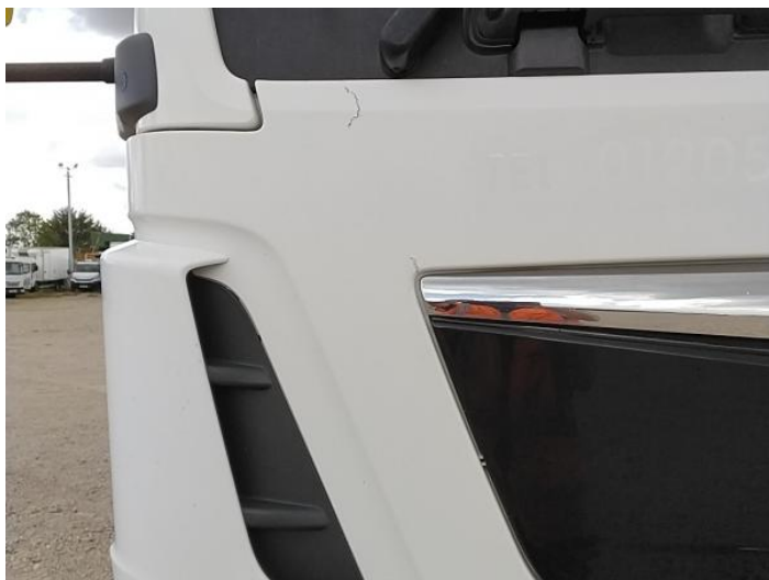
1: Bonnet Cracked Replace