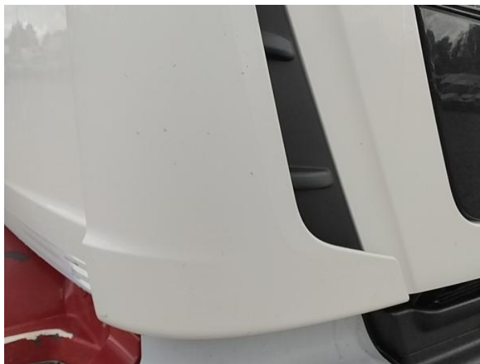
2: Wing osf Chipped Multiple Chips