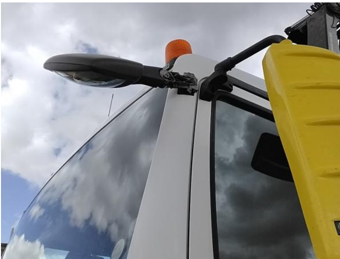
5: Door Mirror Assy nsf Missing Replace