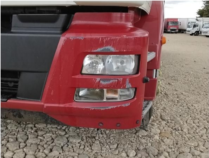
3: Fog Lamp Surround ns Scratched (Painted) Over 25mm Thru Paint