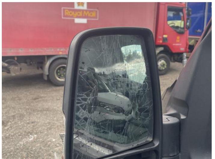
8: Flasher Side Repeater ns Broken Replace