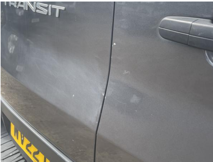
5: Tailgate Dented Over 30mm