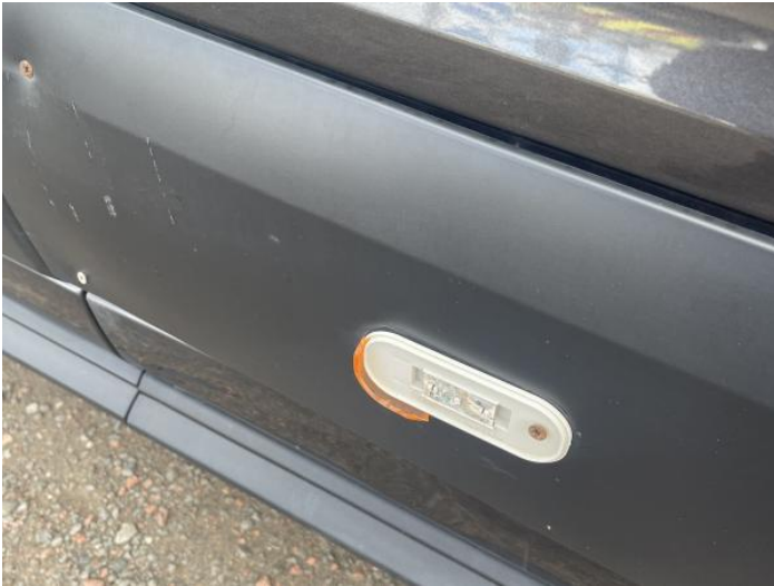
3: Flasher Side Repeater os Broken Replace