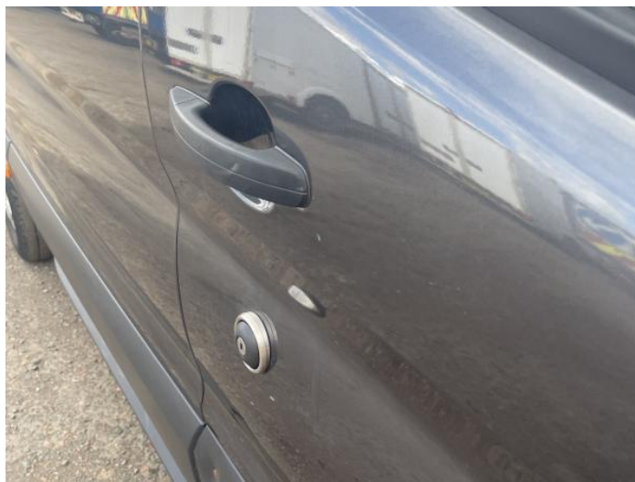
2: Door osf Dented Over 30mm