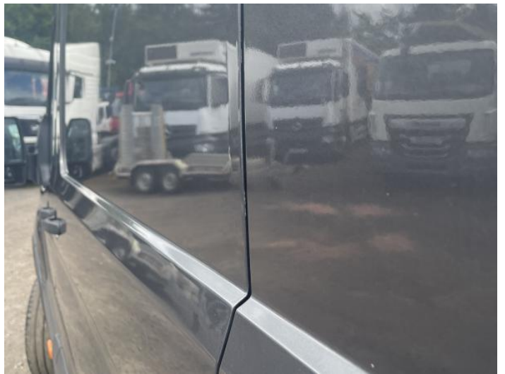
6: Door nsr Dented Over 30mm