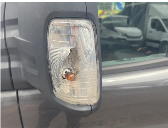
7: Flasher Side Repeater ns Broken Replace