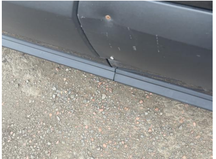
4: Door Moulding osf Broken Replace