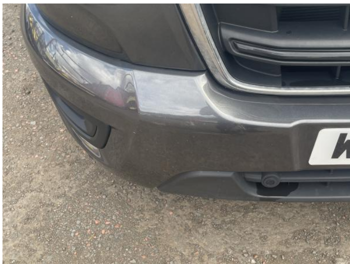
1: Bumper Front Scratched Over 25mm Not Thru Paint